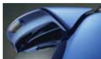
REAR ROOF SPOILER Available on all models (Not compatible with Rear Visor)