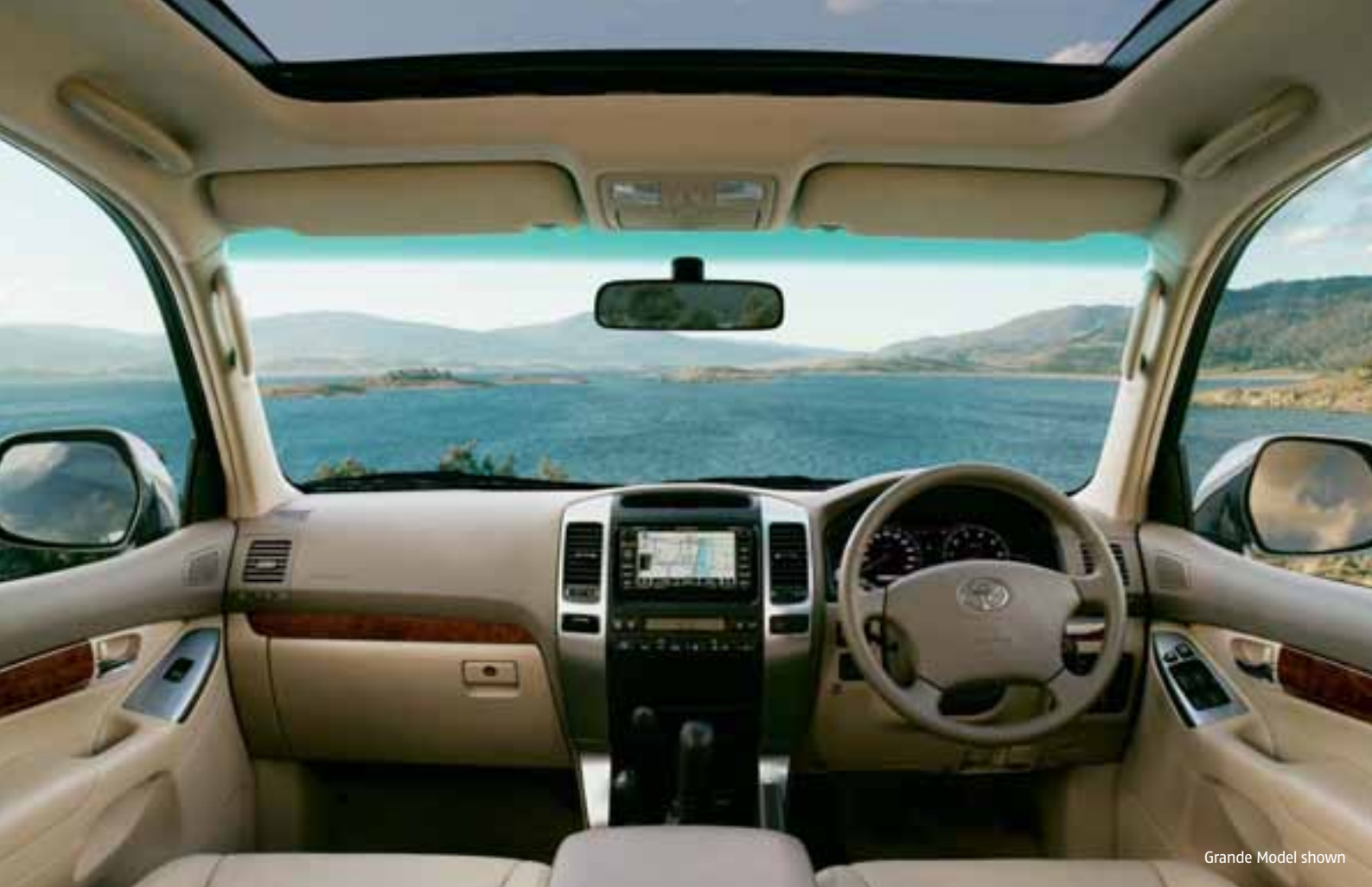
Grande Model shown