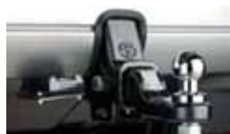
TOWBAR, TOWBALL & TRAILER WIRING HARNESS Available on all models