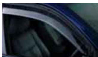
FRONT WEATHERSHIELDS Available on all models