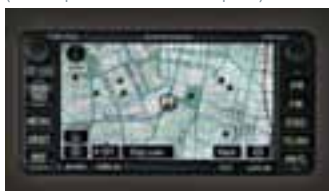
SATELLITE NAVIGATION AUDIO SYSTEM** - INCL. 4 IN-DASH MP3, CD CHANGER WITH BLUETOOTH™^^ COMMUNICATIONS AND AUDIO INPUT JACK^^ Available on GX, GXL and VX