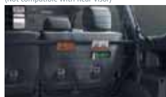
CARGO BARRIER Available on GX and GXL