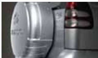
HARD COLOUR CODED SPARE WHEEL COVER Available on all models