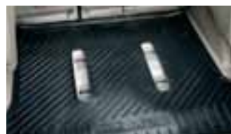
ALL WEATHER RUBBER CARGO MAT Available on all models