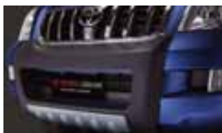
FRONT BUMPER GUARD (AIRBAG COMPATIBLE) Available on all models