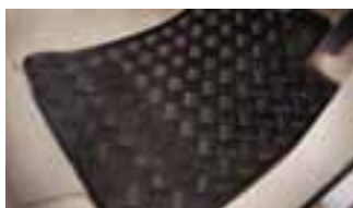
ALL WEATHER RUBBER FLOOR MATS Available on all models