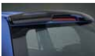
REAR VISOR Available on all models (Not compatible with Rear Roof Spoiler)