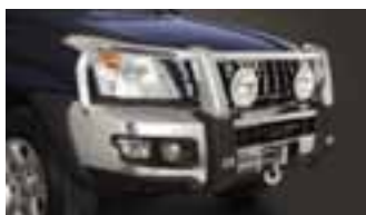
SOVEREIGN ALLOY BULL BAR (AIRBAG AND WINCH COMPATIBLE) Available on all models

THESE ARE JUST SOME OF THE ACCESSORIES AVAILABLE FOR YOUR PRADO. FOR A COMPLETE LIST AND FURTHER DETAILS, PLEASE SEE YOUR TOYOTA DEALER OR REFER TO OUR WEBSITE.