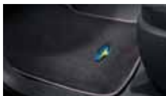
CARPET FLOOR MATS Available on all models