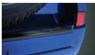
PARKASSIST-REVERSE PARKING SENSORS (4-HEAD KIT) Available on all models