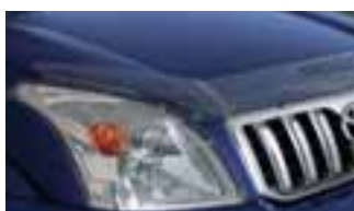
BONNET PROTECTOR & HEADLAMP COVERS (SOLD SEPARATELY) Available on all models