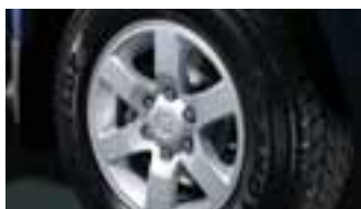
PHOENIX ALLOY WHEELS (17" X 7.5") Available on all models