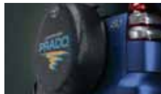
SOFT SPARE WHEEL COVER Available on all models