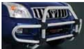
OVERBUMPER BULL BAR (AIRBAG COMPATIBLE) Available on all models