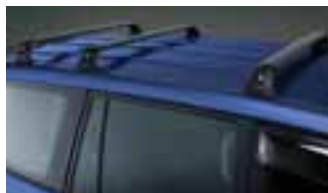
AERO ROOF RACKS (3 BAR SET SHOWN) Available on all models