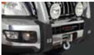
SUPERWINCH AND WINCH CRADLE Available on all models