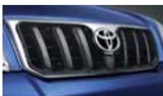
INSECT SCREEN Available on all models