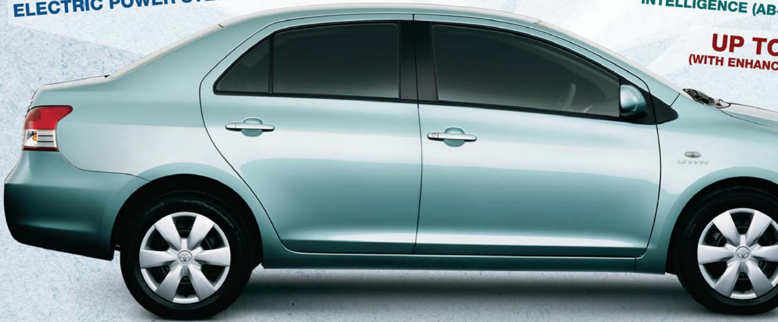
YRS model shown in Aqua Marine