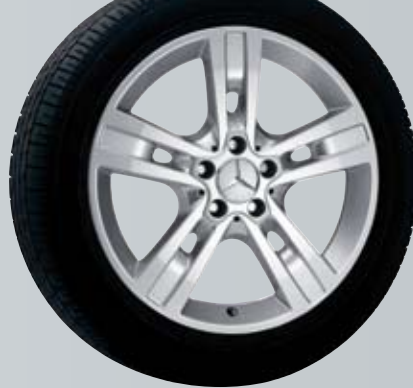
Gyas | 5-spoke wheel

Other magical ways to personalise your car can be found overleaf.