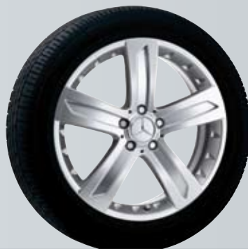
Klemola | 5-spoke wheel

Wheel: 8.5 J x 20 ET 60 | Tyre: 265/45 R20 B6 647 4212; not compatible with snow chains