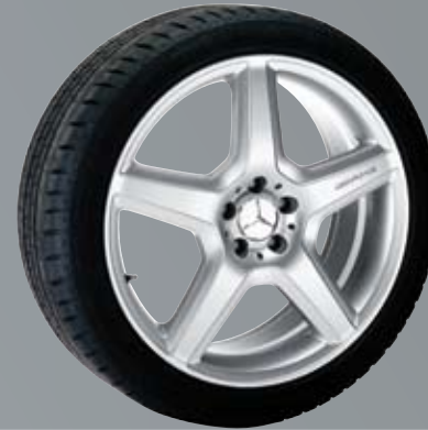
AMG 5-spoke wheel | Style III

Wheel: 10 J x 20 ET 46 | Tyre: 295/40 R20