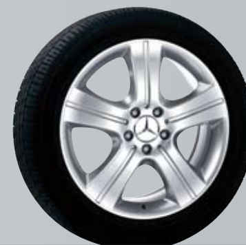
Mintaka | 5-spoke wheel

Wheel: 9.5 J x 19 ET 56 | Tyre: 285/45 R19 B6 647 4368; not compatible with snow chains