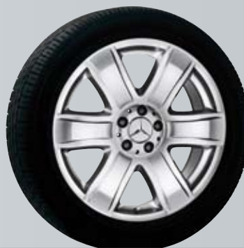
Alrai | 6-spoke wheel

Wheel: 8 J x 19 ET 60 | Tyre: 255/50 R19 B6 647 4217