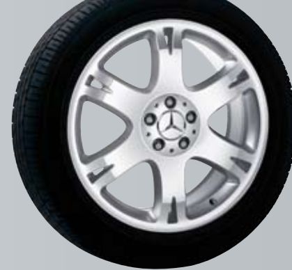
Rukbat | 6-spoke wheel

Wheel: 8 J x 18 ET 60 | Tyre: 255/55 R18 B6 647 4216