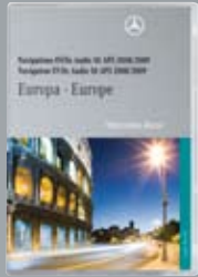
Europe navigation DVD for Audio 50 APS

The data for the Mercedes-Benz navigation systems is regularly updated. Please ask your Mercedes-Benz partner for the latest map versions