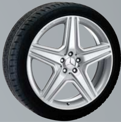
AMG 5-spoke wheel | Style III

AMG light-alloy wheel | Finish: silver, high-sheen