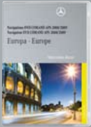
Europe navigation DVD for COMAND APS