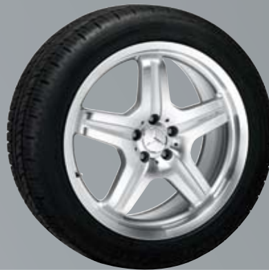
AMG 5-spoke wheel | Style VI

Wheel: 9 J x 21 ET 48 | Tyre: 265/40 R21