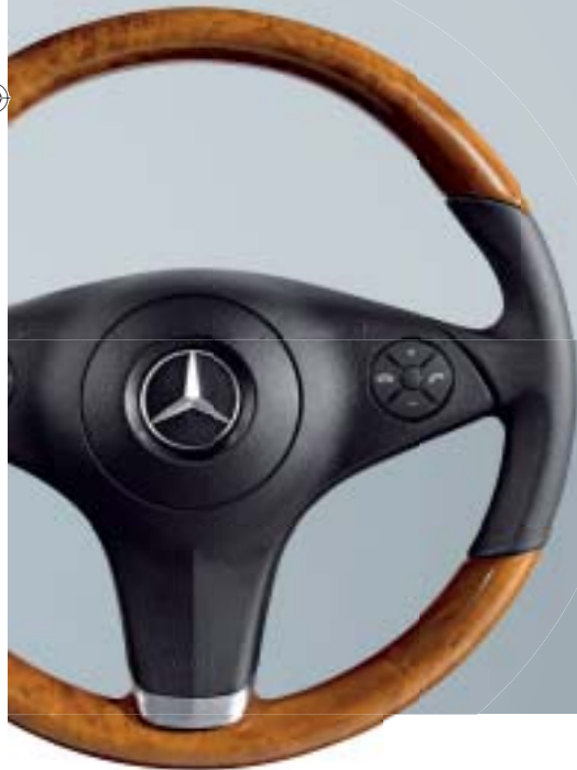
Wood/leather steering wheel

For those who appreciate comfort, there are plenty of extras to choose from. Including a plexiglass draught-stop that protects the occupants of the SLK from the wind, without depriving them of that glorious sensation of being in direct contact with the outside world.