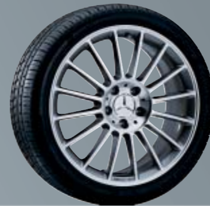
18" AMG multi-spoke wheel | Style V AMG light-alloy wheel | Finish: titanium grey, high-sheen Wheel: 7.5 J x 18 ET 37 | Tyre: 225/40 R18 Option for rear axle: Wheel: 8.5 J x 18 ET 30 | Tyre: 245/35 R18

AMG bodystyling comprises a front apron with round, clear-lens, chrome-ringed fog lamps, a rear apron, side skirts and a rear spoiler lip (painted in body colour) | also pictured on pages 44/45 |