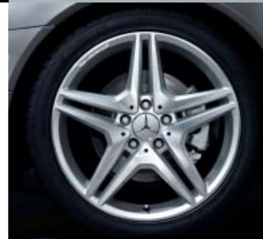
18" AMG 5-twin-spoke wheel | Style IV AMG light-alloy wheel Finish: silver, high-sheen Wheel: 7.5 J x 18 ET 37 | Tyre: 225/40 R18 Option for rear axle: Wheel: 8.5 J x 18 ET 30 | Tyre: 245/35 R18 | also available as 17" wheel | pictured on p 45 |

Further information on AMG accessories can be found in the current AMG accessories brochure