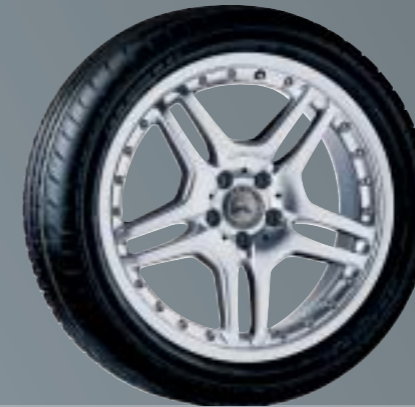
18" AMG 5-twin-spoke wheel, multi-piece, Style IV AMG light-alloy wheel | Finish: sterling silver Wheel: 7.5 J x 18 ET 37 | Tyre: 225/40 R18 Option for rear axle: Wheel: 8.5 J x 18 ET 30 | Tyre: 245/35 R18