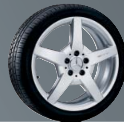
18" AMG 5-spoke wheel | Style IV AMG light-alloy wheel | Finish: titanium silver Wheel: 7.5 J x 18 ET 37 | Tyre: 225/40 R18 Option for rear axle: Wheel: 8.5 J x 18 ET 30 | Tyre: 245/35 R18