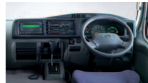
Driver comfort. Deluxe model shown.