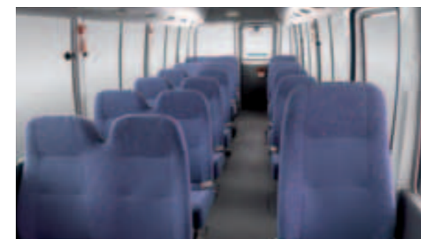
Comfort and space. Deluxe model shown.