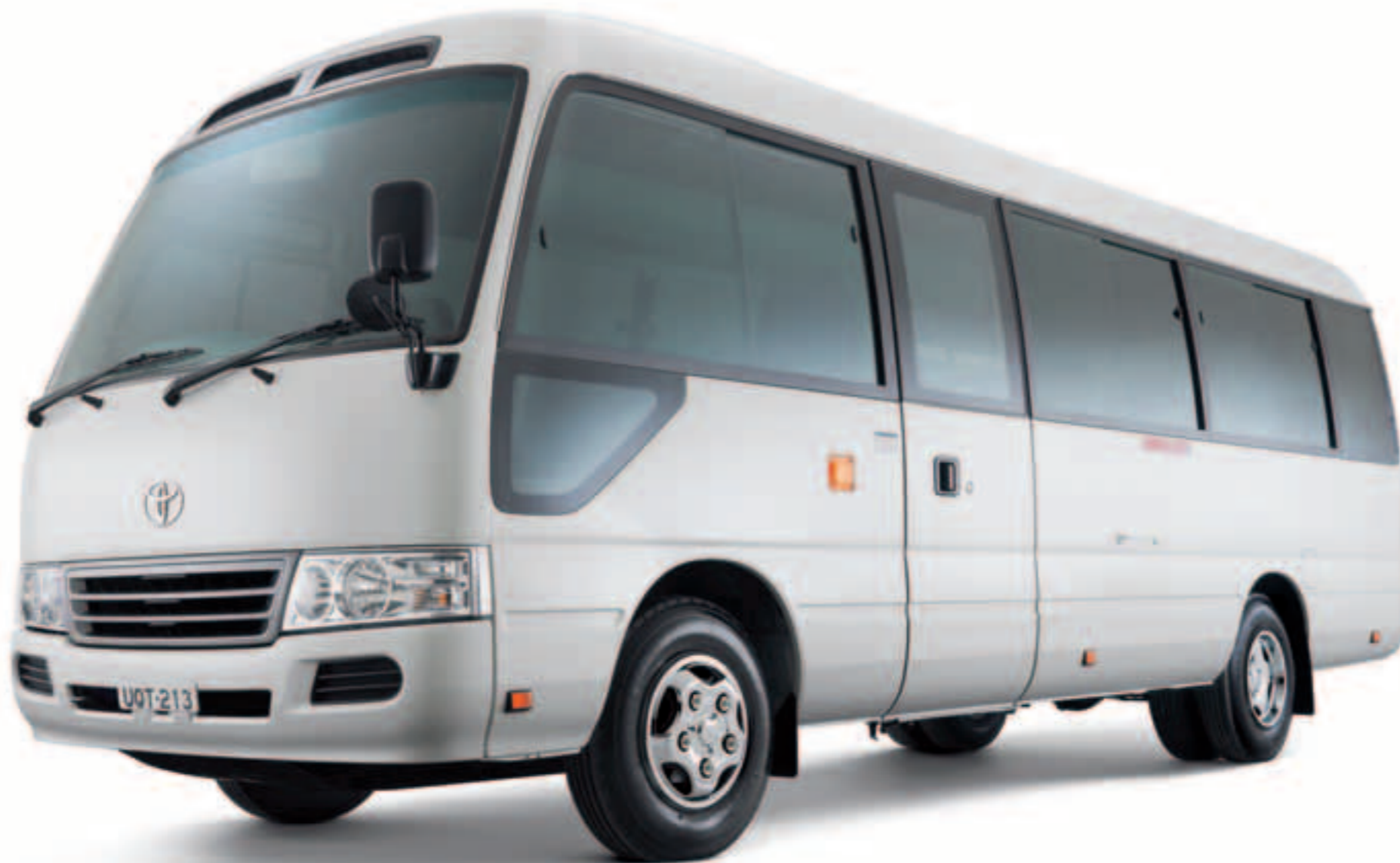
Deluxe model shown.