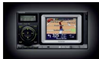
FOLLOWME SOUND AND NAVIGATION SYSTEM* - INCLUDES SINGLE IN-DASH MP3 CD CHANGER AND RADIO WITH BLUETOOTH™† HANDSFREE COMMUNICATIONS, USB IN AND (OPTIONAL) IPOD® CONTROL‡