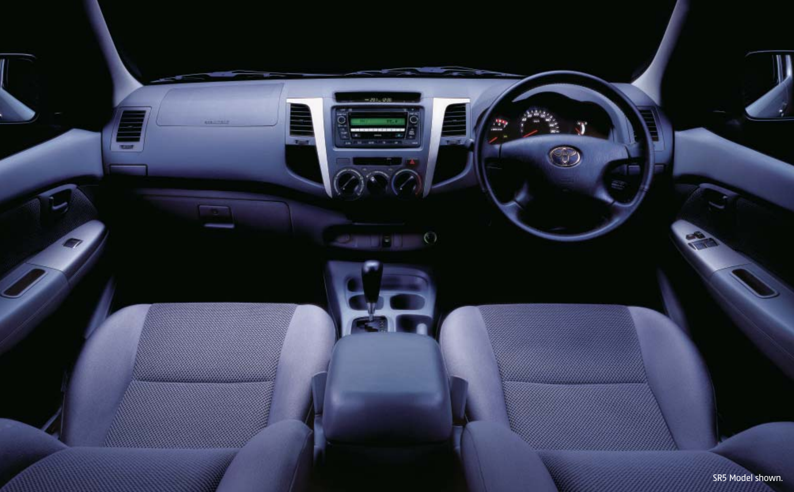
SR5 Model shown.