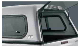
CANOPY (HIGH ROOF)