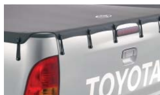
SOFT TONNEAU COVER