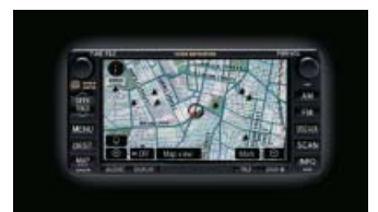
SATELLITE NAVIGATION AUDIO SYSTEM* - INCLUDES 4 IN-DASH MP3 CD CHANGER AND RADIO WITH BLUETOOTH™† HANDSFREE COMMUNICATIONS