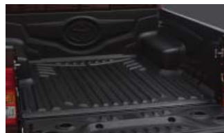
UTE LINER AND TAILGATE LINER