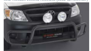
STEEL BULL BAR - OVERBUMPER STYLE AIRBAG COMPATIBLE