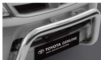
ALLOY NUDDGE BAR - AIRBAG COMPATIBLE