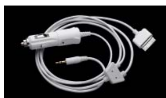
AUDIO CABLE AND CAR CHARGER FOR IPOD®