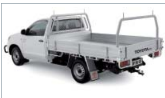
ALLOY TRAY BODY WITH OPTIONAL REAR RACK AND ALLOY WINDOW PROTECTOR FITTED

THESE ARE JUST SOME OF THE ACCESSORIES AVAILABLE FOR YOUR HILUX. FOR A COMPLETE LIST AND FURTHER DETAILS, PLEASE SEE YOUR TOYOTA DEALER OR REFER TO OUR WEBSITE.