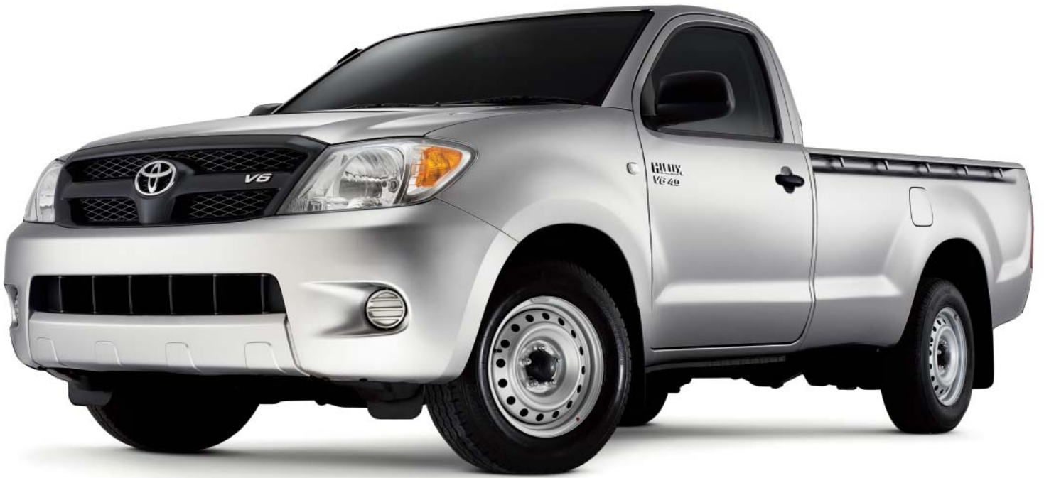
4x2 Single Cab SR model shown.