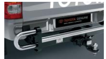
TOWBAR WITH REAR STEP (2250kg Braked)* TOWBALL AND TRAILER WIRING HARNESS (SOLD SEPARATELY)