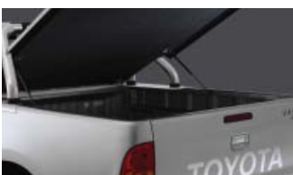
HARD TONNEAU COVER