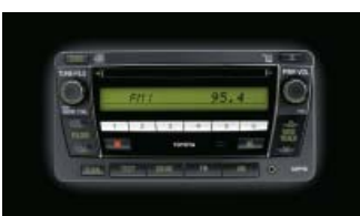
6 IN-DASH MP3 COMPATIBLE CD CHANGER & RADIO WITH BLUETOOTH™† HANDSFREE COMMUNICATIONS & AUXILIARY AUDIO INPUT