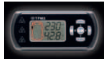
TYRE PRESSURE MONITORING SYSTEM