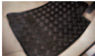
ALL WEATHER RUBBER FLOOR MATS