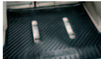
ALL WEATHER RUBBER CARGO MAT