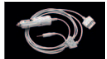
AUDIO CABLE AND CAR CHARGER FOR IPOD®** Available for all vehicles with Auxiliary Input