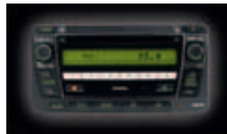
6 IN-DASH MP3 COMPATIBLE CD CHANGER & RADIO WITH BLUETOOTH™††† HANDSFREE COMMUNICATIONS & AUXILIARY AUDIO INPUT Available on Standard, GX, GXL, VX.