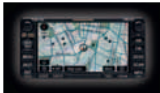
SATELLITE NAVIGATION AUDIO SYSTEM** – INCLUDES 4 IN-DASH MP3 CD CHANGER & RADIO WITH BLUETOOTH™††† HANDSFREE COMMUNICATIONS & (OPTIONAL) AUXILIARY AUDIO INPUT (OPTIONAL REAR VIEW CAMERA AVAILABLE†) Available on Standard, GX, GXL, VX.