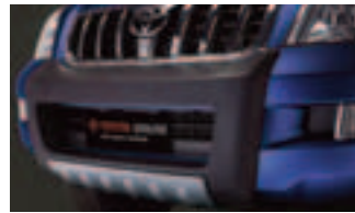
FRONT BUMPER GUARD (AIRBAG COMPATIBLE)