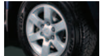
PHOENIX ALLOY WHEELS (17" X 75")