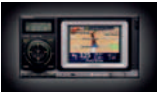
FOLLOWME SOUND AND NAVIGATION SYSTEM** – INCLUDES SINGLE IN-DASH MP3 CD CHANGER & RADIO WITH BLUETOOTH™††† HANDSFREE COMMUNICATIONS, USB IN AND (OPTIONAL) IPOD®‡ CONTROL†