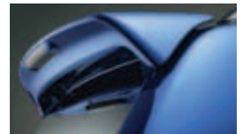
REAR ROOF SPOILER (Not compatible with Rear Visor)