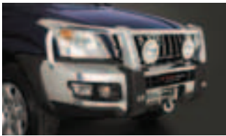
SOVEREIGN ALLOY BULL BAR AND SUPERWINCH – SOLD SEPARATELY (AIRBAG AND WINCH COMPATIBLE)

THESE ARE JUST SOME OF THE ACCESSORIES AVAILABLE FOR YOUR PRADO. FOR A COMPLETE LIST AND FURTHER DETAILS, PLEASE SEE YOUR TOYOTA DEALER OR REFER TO ACCESSORIES.TOYOTA.COM.AU