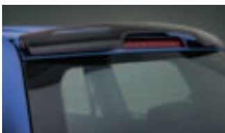
REAR VISOR (Not compatible with Rear Roof Spoiler)