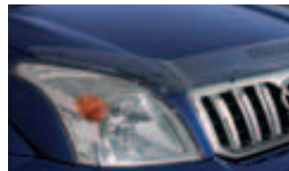
BONNET PROTECTOR & HEADLAMP COVERS (SOLD SEPARATELY)