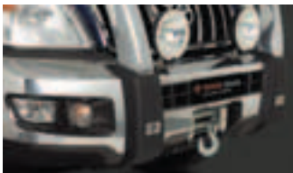
SUPERWINCH AND WINCH CRADLE