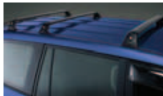
AERO ROOF RACKS (3 BAR SET SHOWN) Available on Standard and GX models only (Non Roof Rail type)