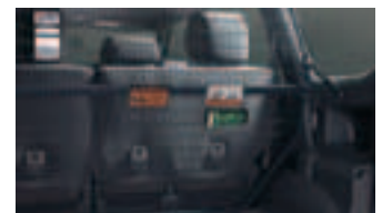
CARGO BARRIER Available on Standard and GX (Not compatible with optional curtain side airbags or optional rear air conditioning)