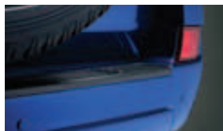
PARKASSIST#-REVERSE PARKING SENSORS (4-HEAD KIT)