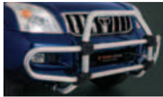
OVERBUMPER BULL BAR (AIRBAG COMPATIBLE)