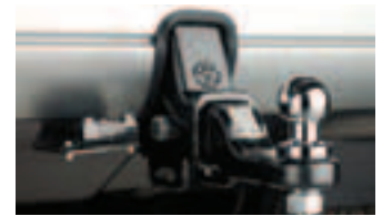
TOWBAR, TOWBALL & TRAILER WIRING HARNESS†