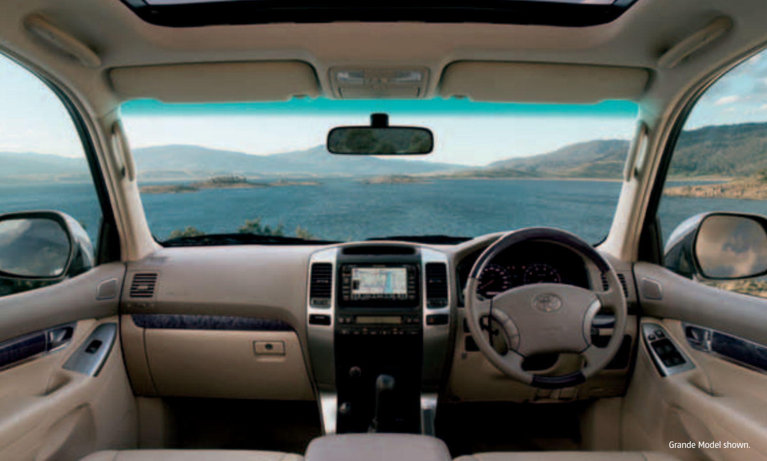
Grande Model shown.