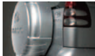
HARD COLOUR CODED SPARE WHEEL COVER Available on GX, GXL, VX, Grande (Wide tyres only)