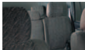
SEAT COVERS Available on Standard, GX and GXL (Not compatible with optional front seat side airbags or leather seats)