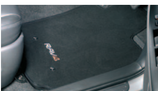
Carpet Floor Mats – Front & Rear Set