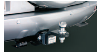
Towbar ## , Towball & Trailer Wiring Harness – RAV4 1500kg (braked), RAV V6 1900kg (braked) – (sold separately)