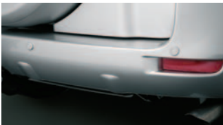
ParkAssist ^^ – Reverse Parking Sensor (4-Head Kit)