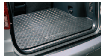
All Weather Rubber Cargo Mat