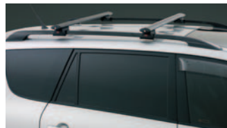
Aero Roof Racks (Roof Rail type) – Cruiser/L, SX6/ZR6 only