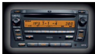
6-In-Dash MP3 Compatible CD Changer and Radio with Bluetooth ††† Handsfree Communications and Auxiliary Audio Input – CV/CV6