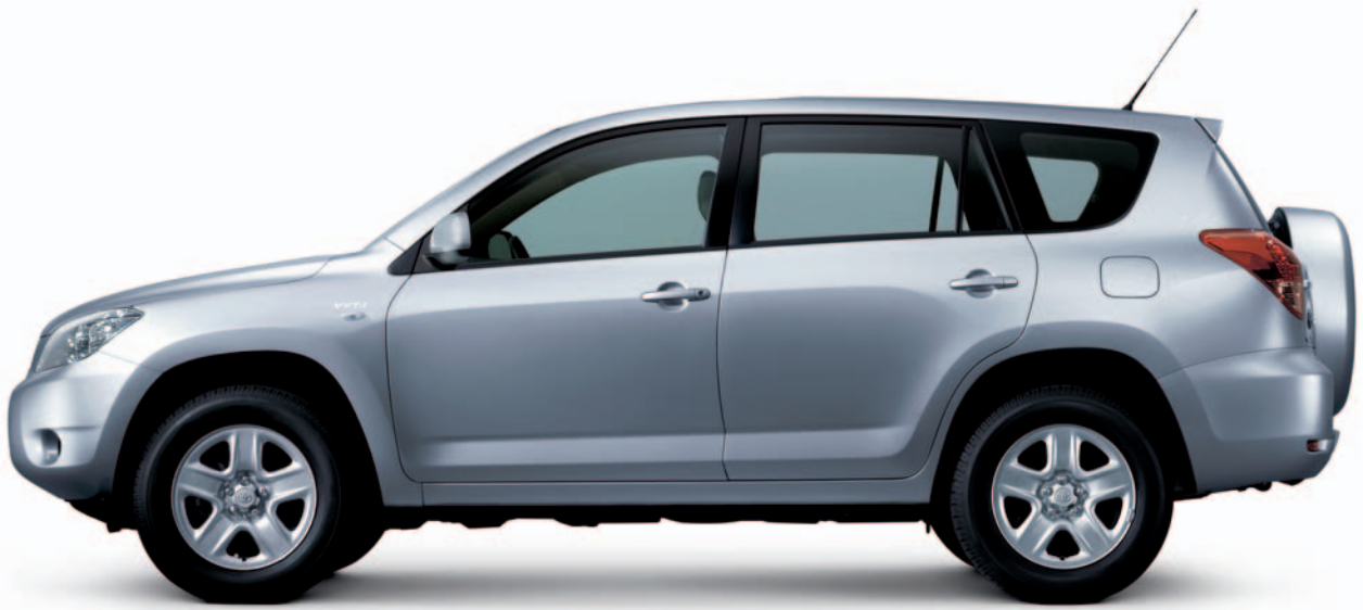
CV model shown.