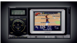
FollowMe Sound and Navigation # System including single in dash MP3 with Bluetooth ††† Handsfree Communications, USB In and optional iPod ® Control ** – All models except ZR6.