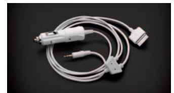
Audio Cable and Car Charger for iPod. ®