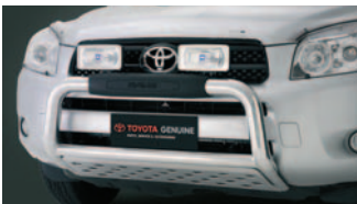
Deluxe Alloy Nudge Bar & Driving Lights (sold separately)

RAV4 Cruiser L shown accessorised with Deluxe Alloy Nudge Bar, Aero Roof Racks, Side Steps, Bonnet Protector, Headlamp Covers, Front Mudguards, Front Weathershields and Vortex-V 17" Alloy Wheels.