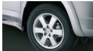
Vortex-V Alloy Wheel (17" x 7")