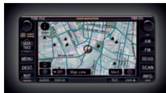
Satellite Navigation # Audio System includes 4-in-dash MP3 CD Changer & Radio with Bluetooth ††† Communications and (optional) Auxiliary Audio Input – All models except ZR6