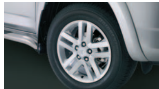
Lava Alloy Wheel (17" x 7")