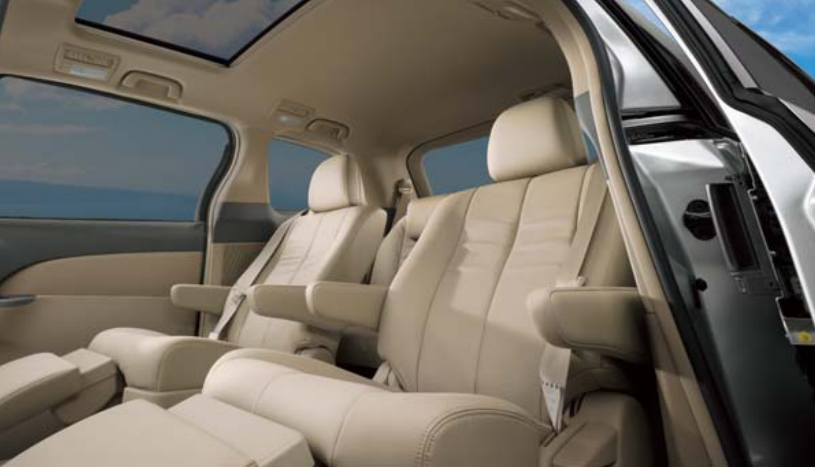
Ultima model shown.