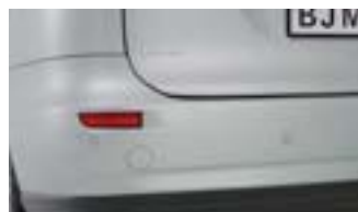
PARKASSIST-REVERSE PARKING SENSOR (4-HEAD KIT) SHOWN ON GLI ** Available on all GLI models