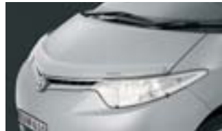
BONNET PROTECTOR & HEADLAMP COVERS Available on all models (sold separately)