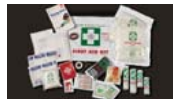
FAMILY FIRST AID KIT Available on all models