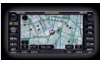
SATELLITE NAVIGATION ### AUDIO SYSTEM INCLUDING 4 DISC IN-DASH MP3 COMPATIBLE CD CHANGER WITH BLUETOOTH ™ COMMUNICATIONS AND (OPTIONAL) AUDIO INPUT Available on GLI and GLX models