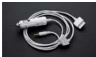
AUDIO CABLE AND CAR CHARGER FOR IPOD ® ^^ Suits all dockable iPods ® Available on selected models where AUX-in option is part of audio unit. Suits iPod ® models that have a dock connector