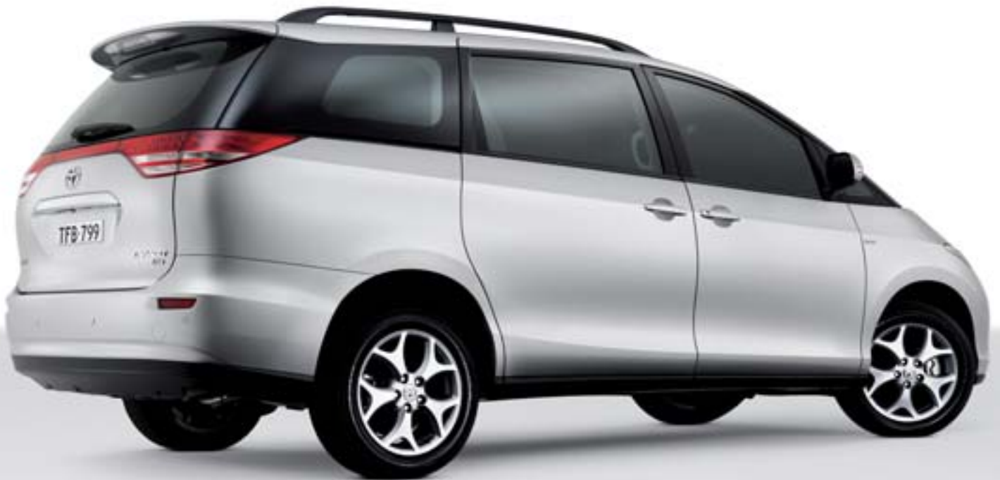
4 cylinder GLX model shown.