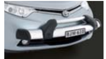
ALLOY NUDGE BAR # Available on all models