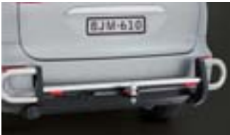
TOWBAR WITH REAR STEP & PROTECTOR, TOWBALL & TRAILER WIRING HARNESS ^ Available on all models (sold separately)

THESE ARE JUST SOME OF THE ACCESSORIES AVAILABLE FOR YOUR TARAGO. FOR A COMPLETE LIST AND FURTHER DETAILS, PLEASE SEE YOUR TOYOTA DEALER OR REFER TO OUR WEBSITE.