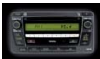
6 DISC IN-DASH MP3 COMPATIBLE CD CHANGER AND RADIO WITH BLUETOOTH ™ COMMUNICATIONS AND AUDIO INPUT Available on GLI

^ Towbar capacity subject to regulatory requirements, towbar design, vehicle design and towing equipment limitations.