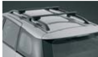
AERO ROOF RACKS (ROOF RAIL TYPE) Available on all GLX models