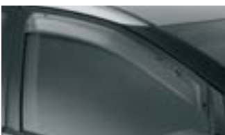
FRONT WEATHERSHIELDS Available on all models