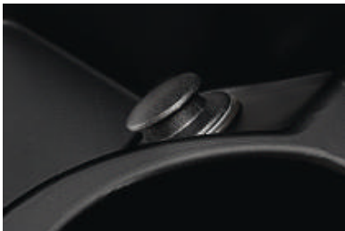
12V sockets (three) are located under the folding centre armrest, in the centre console trim in the rear and on the right of the luggage compartment.