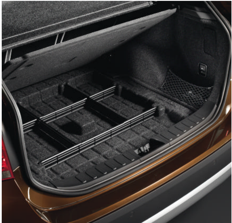
Storage compartment under load compartment floor has four variable partition elements for flexible usage.

■ Storage package includes a host of intelligent and differently sized storage possibilities such as tensioning straps in the door pockets and storage nets on the front seat backrests.