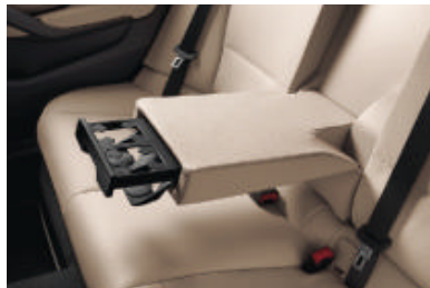
Two cupholders in the rear , integrated into the centre armrest.