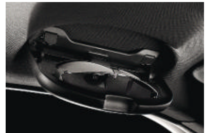
Glasses compartment in the roof liner allows you to reach your glasses or store them safely away in a single movement.