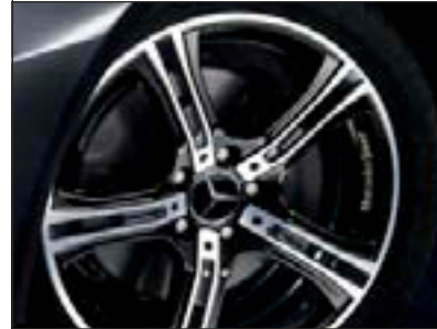
5-spoke wheel, black/two-tone A C 45.7cm (18-inch). Available with or without MercedesSport lettering