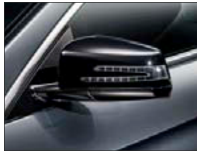
Exterior mirror housings Black. Set of 2