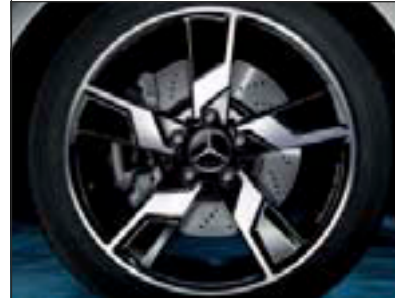
5-spoke wheel, black/two-tone W S 45.7cm (18-inch). Available with or without MercedesSport lettering