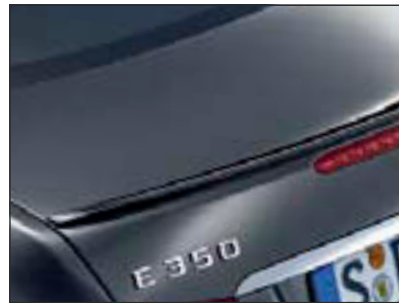
Rear spoiler Primed*