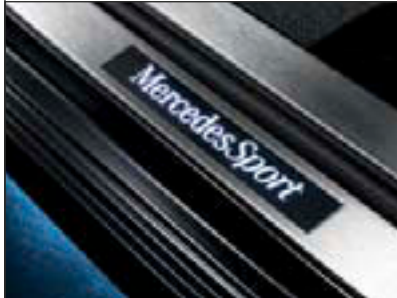
Door sill panels, front panels illuminated W S Ground stainless steel. 6-piece set