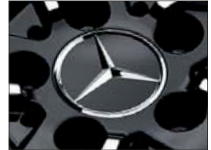
Hub cap A C Black, high-gloss, with chrome star