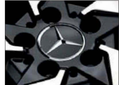
Hub cap W S Black, high-gloss, with chrome star