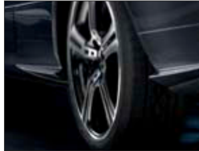
Side sill panels Primed.* Set of 6