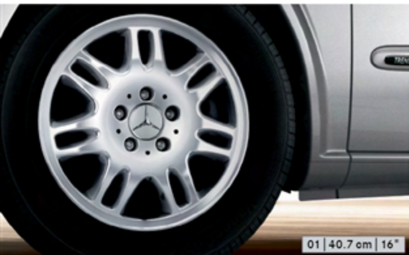
01 | 40.7 cm | 16"