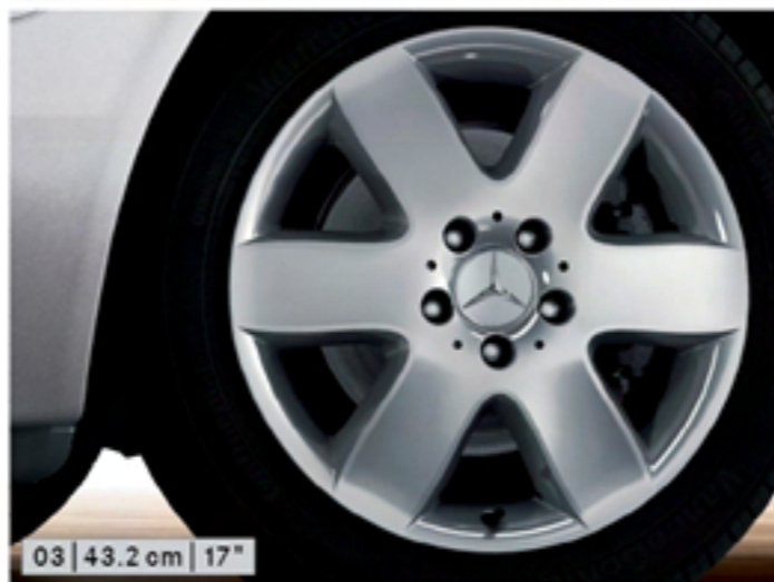
03 | 43.2 cm | 17"

01 7-twin-spoke wheel Finish: sterling silver Wheel: 6.5J x 16 ET 60 Tyre: 205/65 R16 B6 656 0311