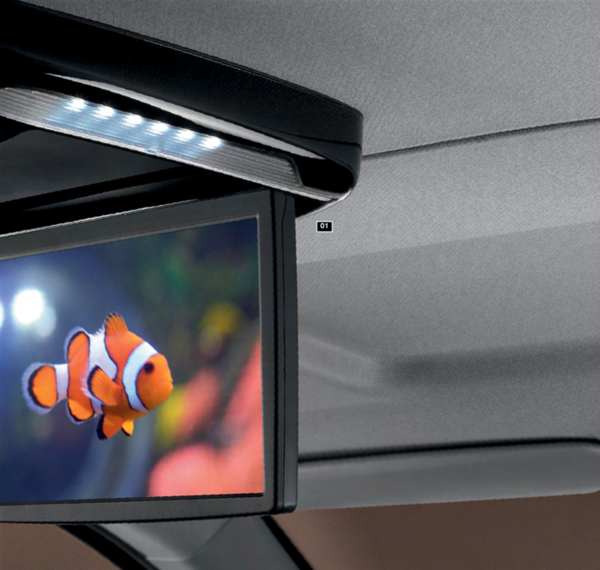
01 Rear Seat Entertainment System