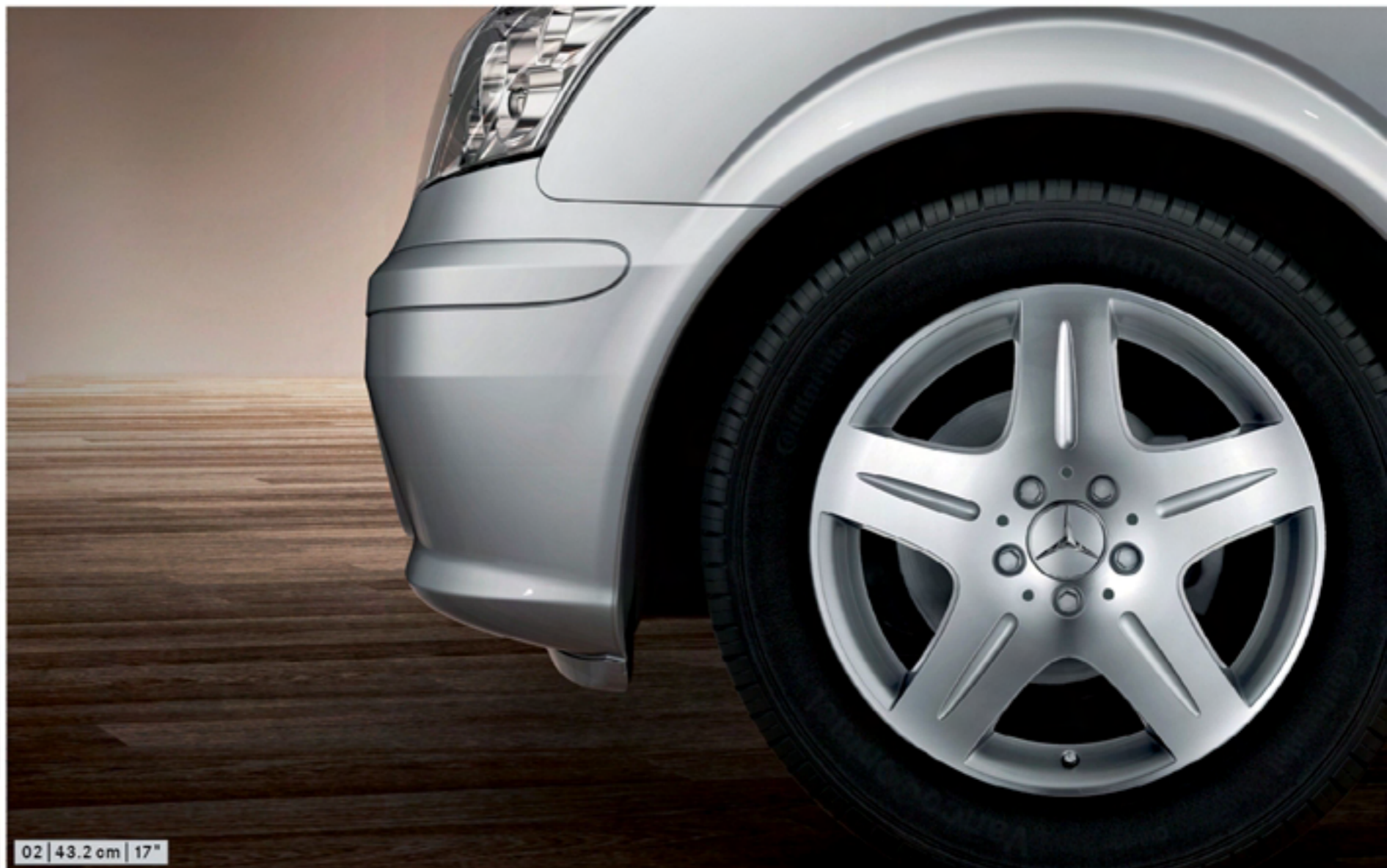
02 | 43.2 cm | 17"