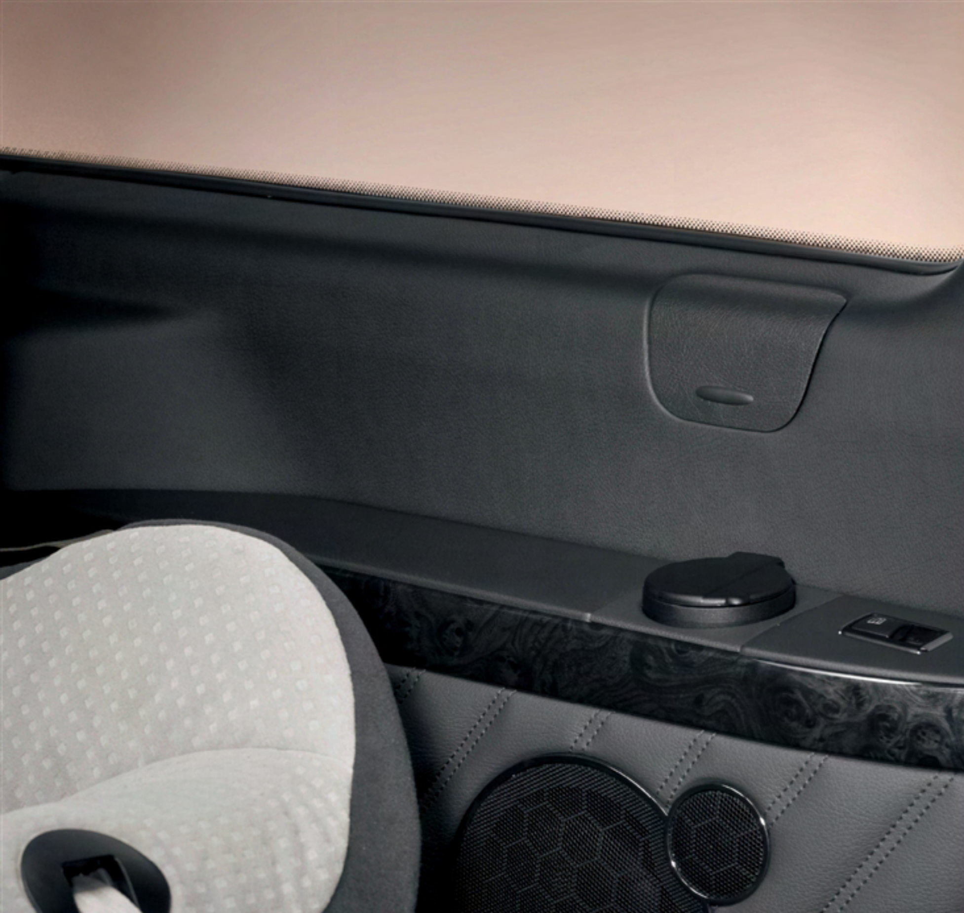
01 "DUO plus" child seat