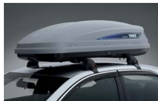
Pacific 200 Roof Pod