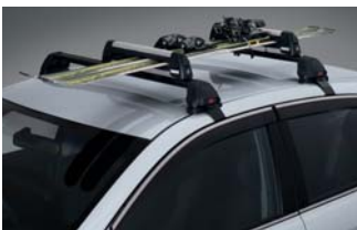
Deluxe Ski & Snowboard Carriers - 4 or 6 (sold separately)