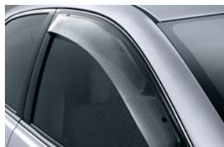
Front Weathershields (sold separately)