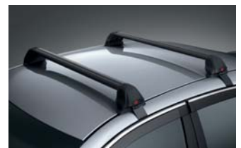
Aero Roof Racks (2 Bar Set) (Flush Type shown)