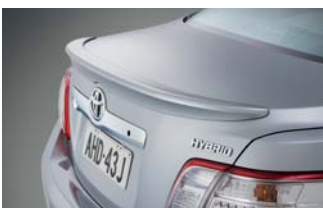
Rear Spoiler (4)