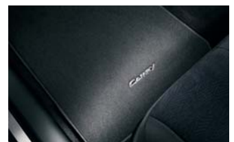
Carpet Floor Mats (4) - Grey or Sandstone (Front & rear set)