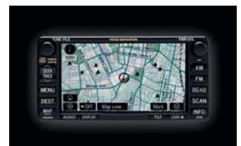
Satellite Navigation (3) Audio System (5)