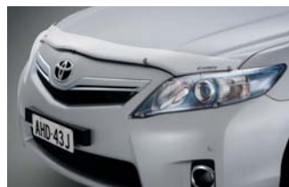
Bonnet Protector & Headlamp Covers (sold separately)