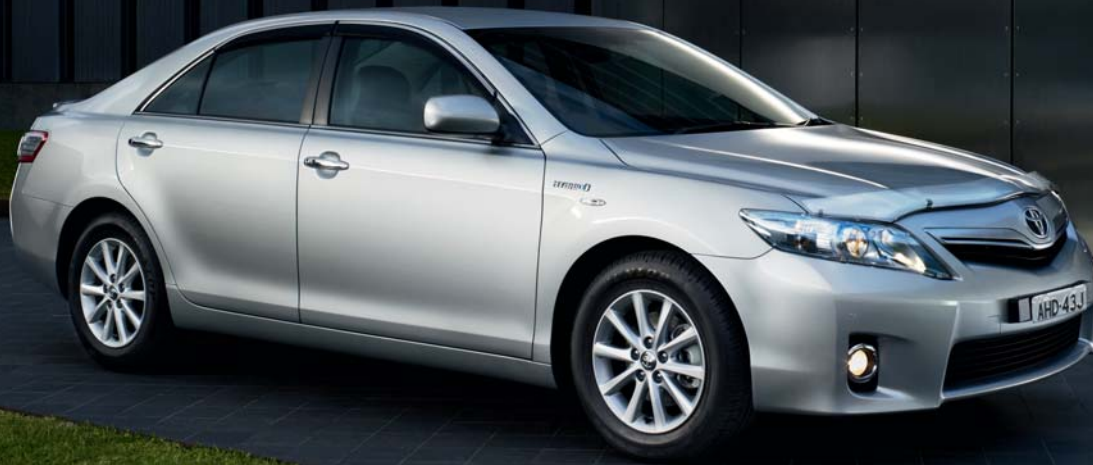
Hybrid Camry model shown in Silver Ash is accessorised with ParkAssist - Front Corner Clearance Parking Sensors (1) , Bonnet Protector, Headlamp Covers, Slimline Weathershields and a Rear Spoiler.