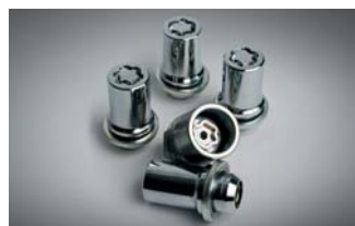
Alloy Wheel Lock Nut Set