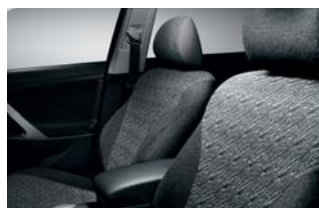
Seat Covers (2,4) - Grey or Sandstone (Front & rear sold separately)