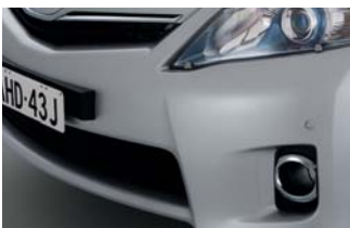
ParkAssist - Front Corner Clearance Parking Sensors (1) (2 Head Kit)

Toyota Genuine Accessories are the perfect complement to your new Hybrid Camry. Only Toyota Genuine Accessories are perfectly tailored to suit the most advanced vehicle Australia has ever built. Our range of accessories meet every need you will have and help keep Everyday Amazing.