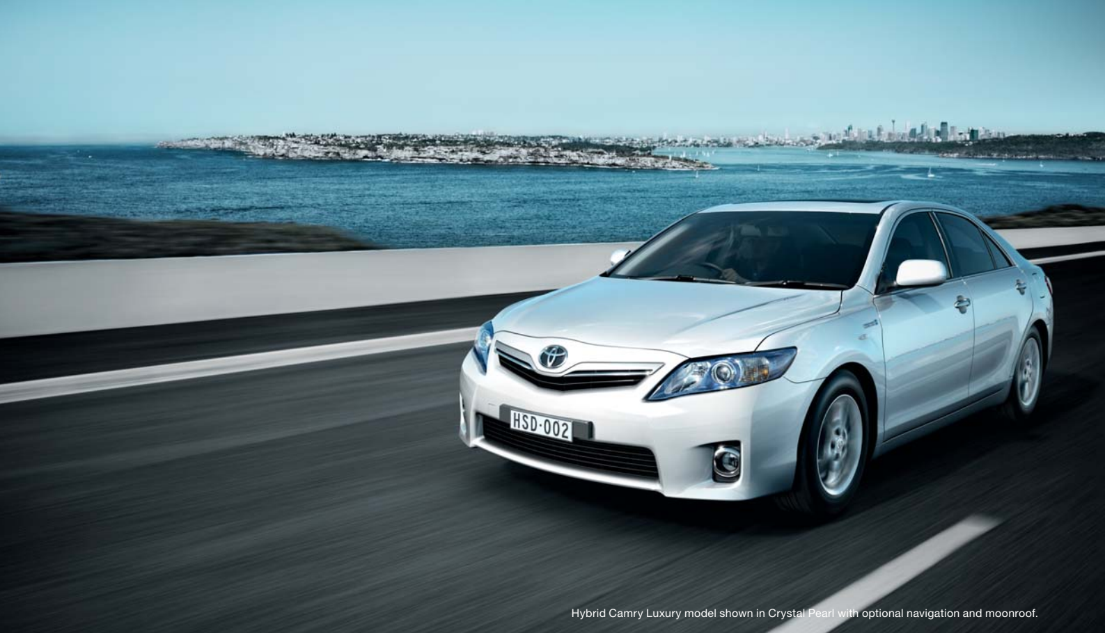
Hybrid Camry Luxury model shown in Crystal Pearl with optional navigation and moonroof.