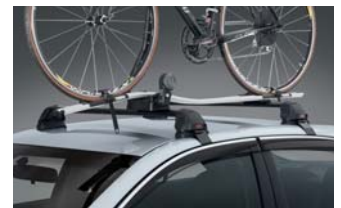
Pro Ride Bicycle Carrier (Kayak Carrier also available)