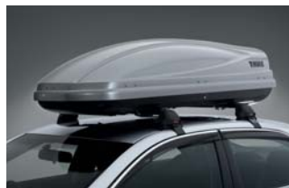
Atlantis 200 & 600 Roof Pods (200 shown)