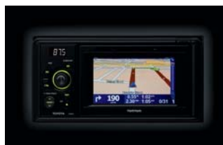
FollowMe ® Sound & Navigation (3) System (5)