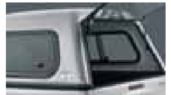
CANOPY RANGE (HIGH ROOF SHOWN) Double Cab only