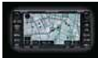
SATELLITE NAVIGATION AUDIO SYSTEM* – INCLUDES 4 IN-DASH MP3/CD CHANGER & RADIO WITH BLUETOOTH™** HANDSFREE COMMUNICATIONS & (OPTIONAL) REAR VIEW CAMERA* COMPATIBILITY