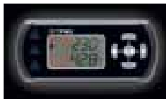
TYRE PRESSURE MONITORING SYSTEM