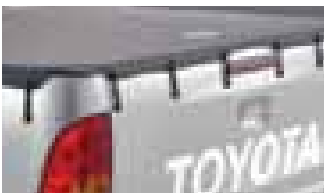
SOFT TONNEAU COVER RANGE (A DECK SHOWN) All Utility models