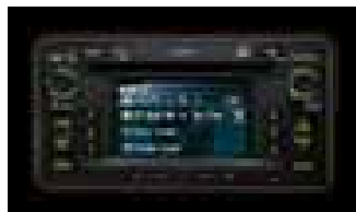
DISPLAY AUDIO SYSTEM – INCLUDES 6 IN-DASH MP3/CD CHANGER & RADIO WITH ADVANCED BLUETOOTH™** FEATURING HANDSFREE COMMUNICATIONS & STEREO AUDIO STREAMING; USB/AUXILIARY AUDIO INPUT/IPOD®* & (OPTIONAL) REAR VIEW CAMERA* COMPATIBILITY Audio upgrade for workmate & SR models only