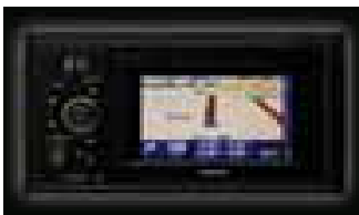
FOLLOWME SOUND & NAVIGATION SYSTEM* – INCLUDES BLUETOOTH™** HANDSFREE COMMUNICATIONS, VIDEO, USB, IPOD®*, MP3 & (OPTIONAL) REAR VIEW CAMERA* COMPATIBILITY