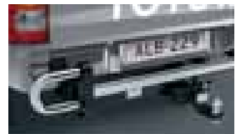
TOWBAR WITH REAR STEP (2250kg Braked)* TOWBALL & TRAILER WIRING HARNESS (SOLD SEPARATELY)