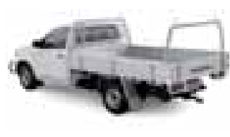
TRAY BODY RANGE (ALLOY TRAY BODY WITH OPTIONAL REAR RACK & ALLOY WINDOW PROTECTOR SHOWN)