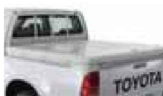
HARD TONNEAU COVER RANGE (J DECK SHOWN) Double Cab Utility only