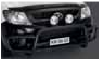
4x2 STEEL BULL BAR – OVERBUMPER STYLE AIRBAG COMPATIBLE (DRIVING LIGHTS SOLD SEPARATELY) Workmate & SR models only

THESE ARE JUST SOME OF THE ACCESSORIES AVAILABLE. FOR A COMPLETE LIST AND FURTHER DETAILS, PLEASE SEE YOUR TOYOTA DEALER OR VISIT ACCESSORIES.TOYOTA.COM.AU