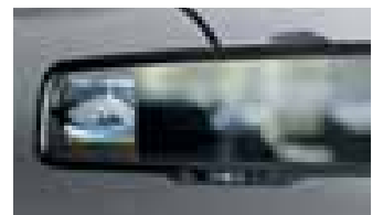
ELECTROCHROMATIC MIRROR & REAR VIEW CAMERA* (SOLD SEPARATELY) All Utility models