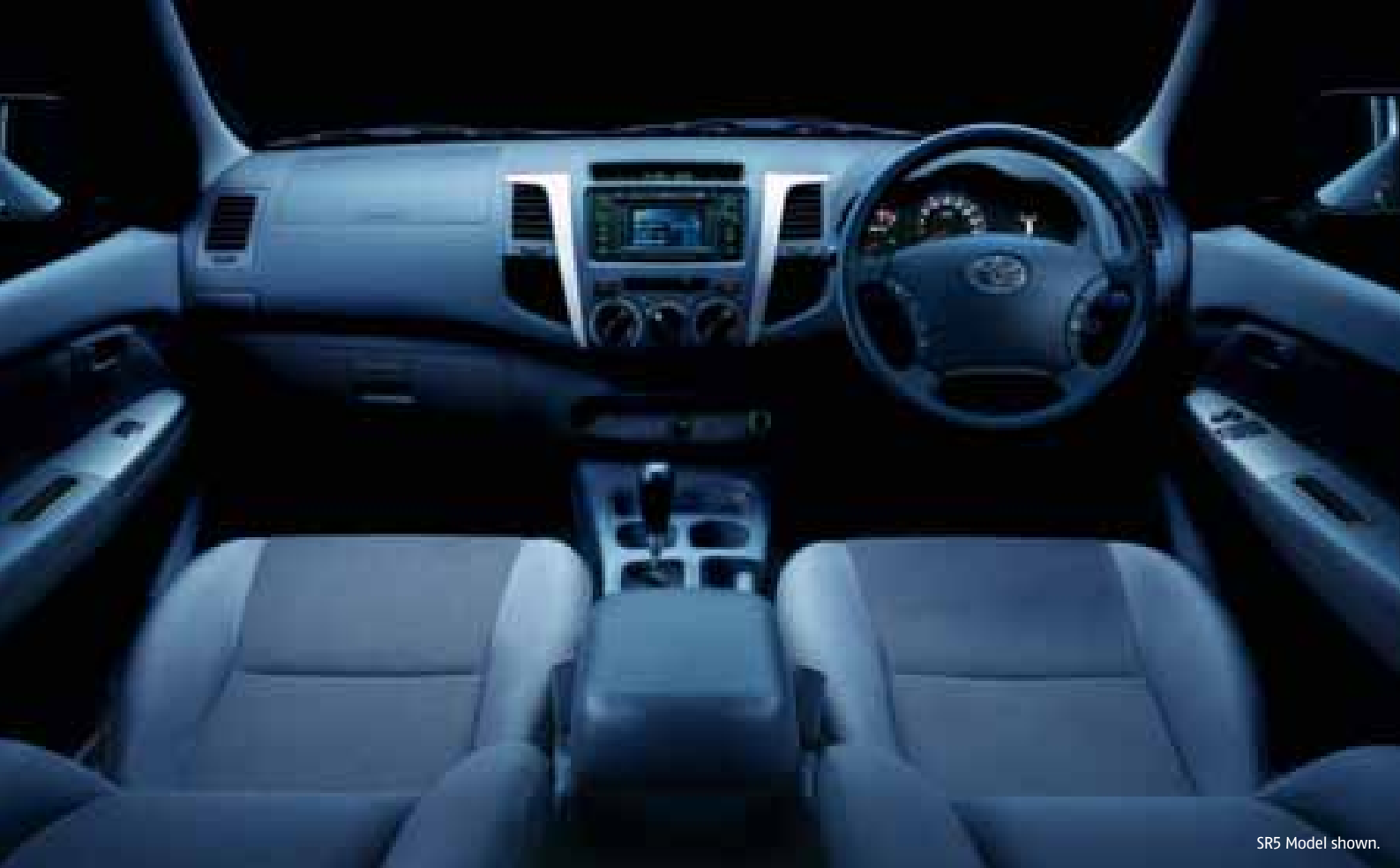
SR5 Model shown.