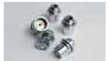
ALLOY WHEEL LOCK NUT SET