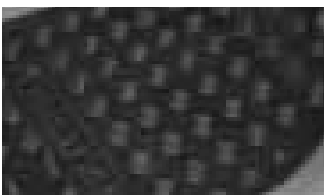
ALL WEATHER RUBBER FLOOR MATS FRONT & REAR AVAILABLE (SOLD SEPARATELY)