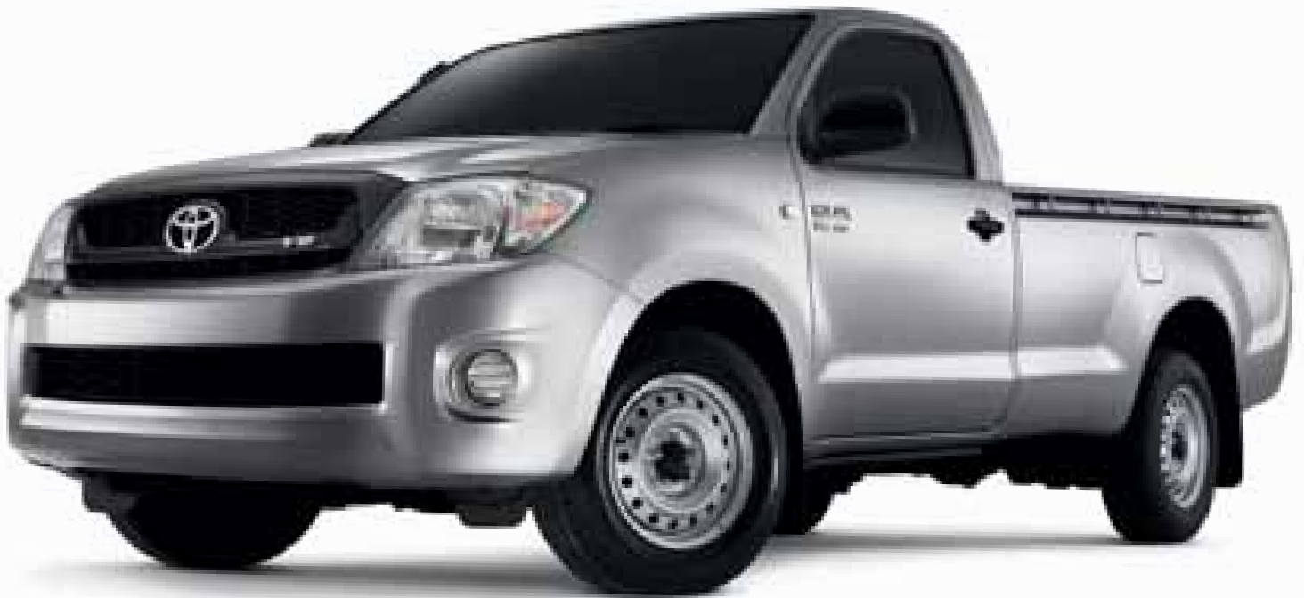
4x2 Single Cab SR model shown.