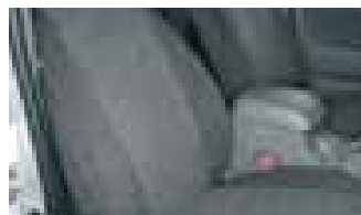
FABRIC SEAT COVERS