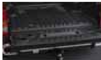
UTE LINER & TAILGATE LINER Double Cab Utility models only