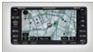
Satellite Navigation audio system ^ , including 4 in-dash MP3 CD changer with Bluetooth ™ and (optional) Reversing Camera Compatibility ^^ .