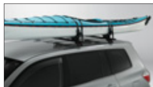
Kayak Carrier. Requires Aero Roof Racks 2 bar set.