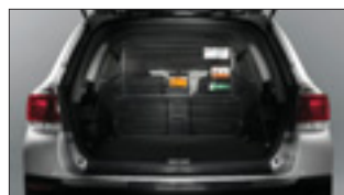
Cargo Barrier - Curtain Shield Airbag compatible.