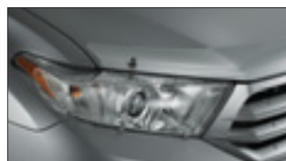
Headlamp Covers and Bonnet Protector. (Sold separately).