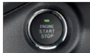
Smart Start. Grande model shown.