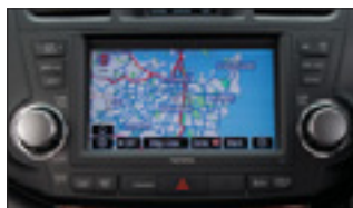
Satellite Navigation Grande model shown.

It's impressive features like this, and many more, that make Kluger the perfect family all-rounder.