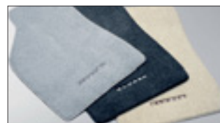
Carpet Floor Mats - Grey, Black, Sand Beige. (Front and rear set).