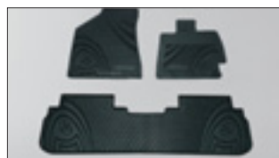
Black Rubber Mats.