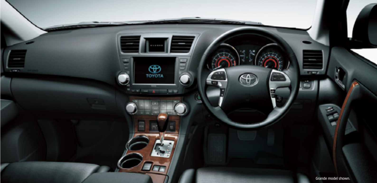
Grande model shown.