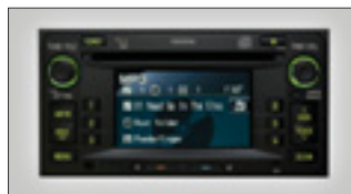
FollowMe ® Sound and Navigation ^ System, includes Bluetooth ™ , video, and is compatible with some iPods ®† , MP3 and USB † thumbdrives.