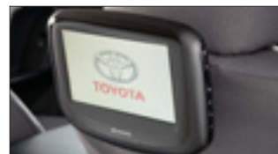
Rear Seat Entertainment. Reads CD, DVD, SD Card and USB † thumbdrive.