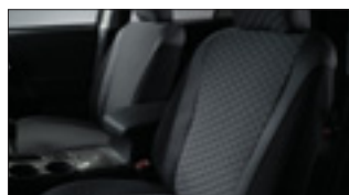
Vest Seat Covers.