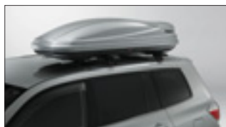
Atlantis Roof Pod. Available in 200 or 600. (600 shown.) Requires Aero Roof Racks 2 bar set.

Customise your Kluger to your own specifications with a range of Toyota Genuine Accessories. Designed especially to integrate into your Kluger, these accessories have the durability you would expect from Toyota.