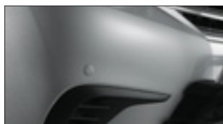
Front Corner Clearance ParkAssist ^^ . (2 head kit).