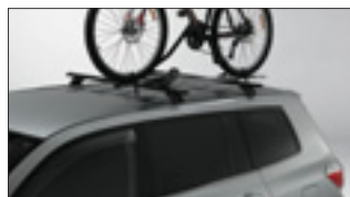
Pro-Ride Bicycle Carrier. Requires Aero Roof Racks 2 bar set.