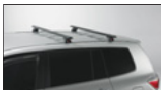
Aero Roof Racks - 2 bar set (Non-roof rail type). Available on KX-R.