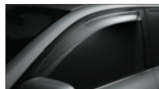
Left and Right Hand Front Weathershields. (Sold separately).