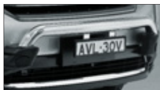
Alloy Nudge Bar - Airbag Compatible.