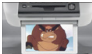
Rear Seat DVD entertainment. Grande model shown.