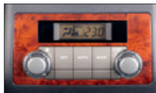
3 Zone climate control air conditioning. Grande model shown.