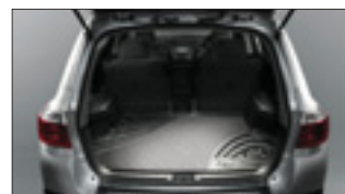
All-weather Rubber Cargo Mat.