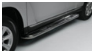
Stainless Steel Side Steps.