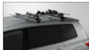
Deluxe Ski & Snowboard Carriers (4 or 6). Requires Aero Roof Racks 2 bar set.