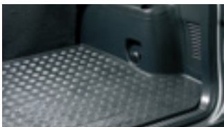
All Weather Rubber Cargo Mat