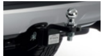
Towbar, # Towball & Trailer Wiring Harness - RAV4 1500kg (braked), RAV4 V6 1900kg (braked) - (Sold Separately)