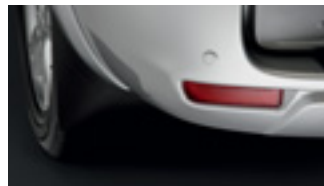
ParkAssist* - Reverse Parking Sensor (2-Head Kit)