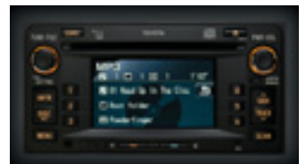
Display Audio System - Includes 6 in-Dash MP3/CD Changer & Radio with Bluetooth ™ > featuring Handsfree capabilities & Audio Streaming, and is compatible with (optional) Rear View Camera and some iPods ® , MP3 and USB sticks ^^ .