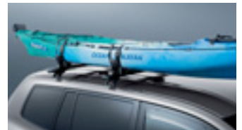
Kayak Carrier (Vehicle shown is Kluger KX-R)