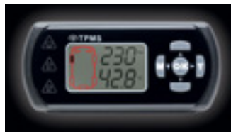
Tyre Pressure Monitoring System