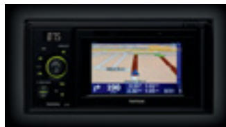
FollowMe Sound & Navigation System - Includes Bluetooth ™ > Handsfree capabilities, Video and is compatible with (optional) Rear View Camera and some iPods ® , MP3 and USB sticks ^^ . All 4cyl. models; V6 CV6 only