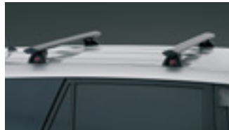
Aero Roof Racks (Non Roof Rail type) CV/CV6 only