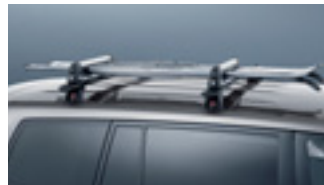
Ski & Snowboard Carriers - 4 or 6 (Vehicle shown is Kluger KX-R)