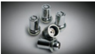
Alloy Wheel Lock Nut Set