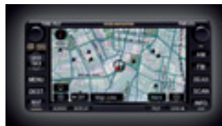
Satellite Navigation Audio System † - Includes 4 in-dash MP3 CD Changer & Radio with Bluetooth ™ > Handsfree Communications & (optional) Auxiliary Audio Input (optional) Rear View Camera Compatibility* All 4 cyl. models; V6: CV6 and SX6 only