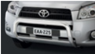
Alloy Nudge Bar - Airbag compatible AWD models only

When you choose Toyota Genuine Accessories you're adding even more personality, protection and practicality to your Toyota - tailoring it to your individual lifestyle needs. Toyota Genuine Accessories are designed, tested and manufactured to strict Toyota Standards. This quality and reliability is supported with our Toyota Warranty**.