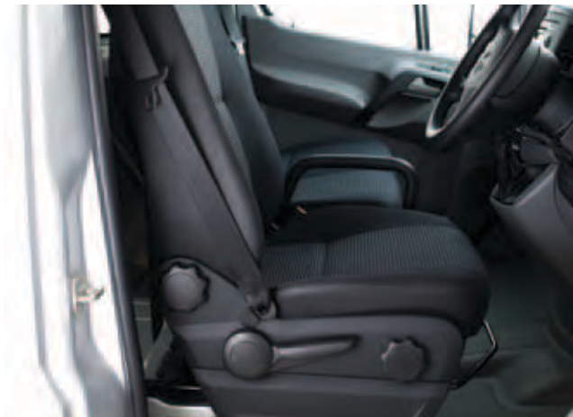
Driver's comfort seat