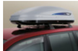
PACIFIC 200 ROOF POD Requires Aero Roof Rack - 2 bar set (sold separately)