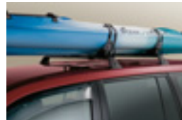
KAYAK CARRIER Requires Aero Roof Rack - 2 bar set (sold separately)