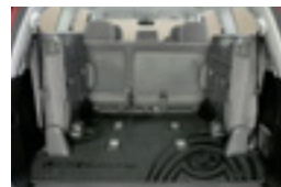
ALL WEATHER RUBBER CARGO MAT