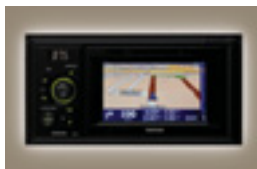
FOLLOWME (5) SOUND & NAVIGATION SYSTEM - INCLUDES BLUETOOTH (4) HANDSFREE CAPABILITIES, VIDEO AND IS COMPATIBLE WITH (OPTIONAL) REAR VIEW CAMERA AND SOME IPODS (6) , MP3 AND USB STICKS (7) . Available on GXL & VX.