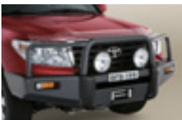
STEEL WINCH BAR WITH SUPERWINCH & RALLYE FF 4000 DRIVING LIGHTS BLACK (sold separately)

Whether you're after an even more rugged look, extra storage options or greater convenience, your LandCruiser 200 deserves accessories with a proven pedigree. Combining innovative style with the strength and durability you expect from Toyota, these additions have been purpose-built for your LandCruiser – and your lifestyle. Integrating seamlessly with the original specifications, they not only look like they were meant to be there, they perform like it too. So whether you're working hard or playing harder, make sure you start on the right track with Toyota Genuine Accessories.