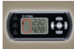
TYRE PRESSURE MONITORING SYSTEM