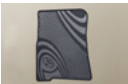
ALL WEATHER RUBBER FLOOR MATS (FRONT PAIR & SECOND ROW) (sold separately)