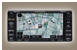
SATELLITE NAVIGATION (3) AUDIO SYSTEM INCLUDING 4-IN-DASH MP3 CD CHANGER WITH BLUETOOTH (4) COMMUNICATIONS & (OPTIONAL) AUXILIARY AUDIO INPUT (sold separately) Available on GXL & VX.