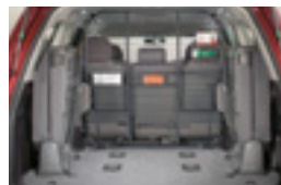
CARGO BARRIER - CURTAIN SIDE AIRBAG COMPATIBLE