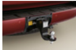
TOWING KIT (ON ROAD) 3500KG (BRAKED CAPACITY) (1) WITH TRAILER WIRING HARNESS (sold separately)