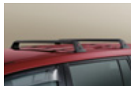
AERO ROOF RACK - 2 bar set