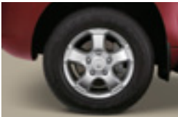
18" x 8" ALLOY WHEELS