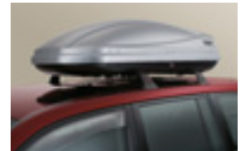
ATLANTIS ROOF POD IN 200 OR 600 (200 SHOWN) Requires Aero Roof Rack - 2 bar set (sold separately)