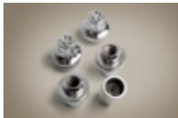
ALLOY WHEEL LOCK NUT SET