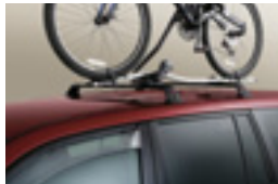
PRO RIDE BICYCLE CARRIER Requires Aero Roof Rack - 2 bar set (sold separately)