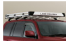
ALLOY ROOF TRAY - Requires Heavy Duty Roof Rack - 3 bar set (sold separately)