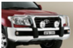
ALLOY BULL BAR & RALLYE FF 4000 DRIVING LIGHTS CHROME (sold separately)