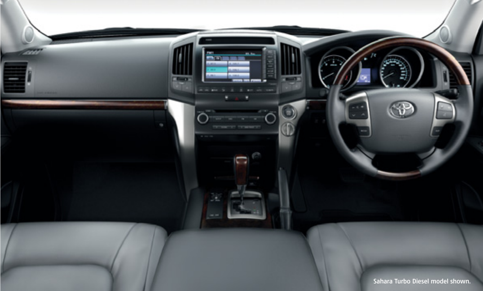
Sahara Turbo Diesel model shown.