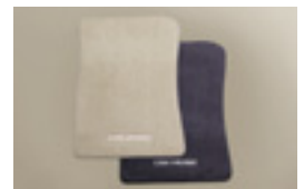
CARPET FLOOR MAT SET - OAK OR GREY (FRONT & SECOND ROW SET)