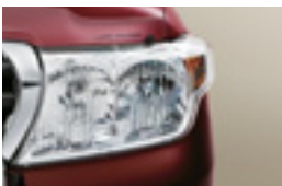
BONNET PROTECTOR & HEADLAMP COVERS (sold separately)