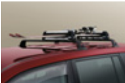
DELUXE SKI & SNOWBOARD CARRIERS (4 OR 6) Requires Aero Roof Rack - 2 bar set (sold separately)