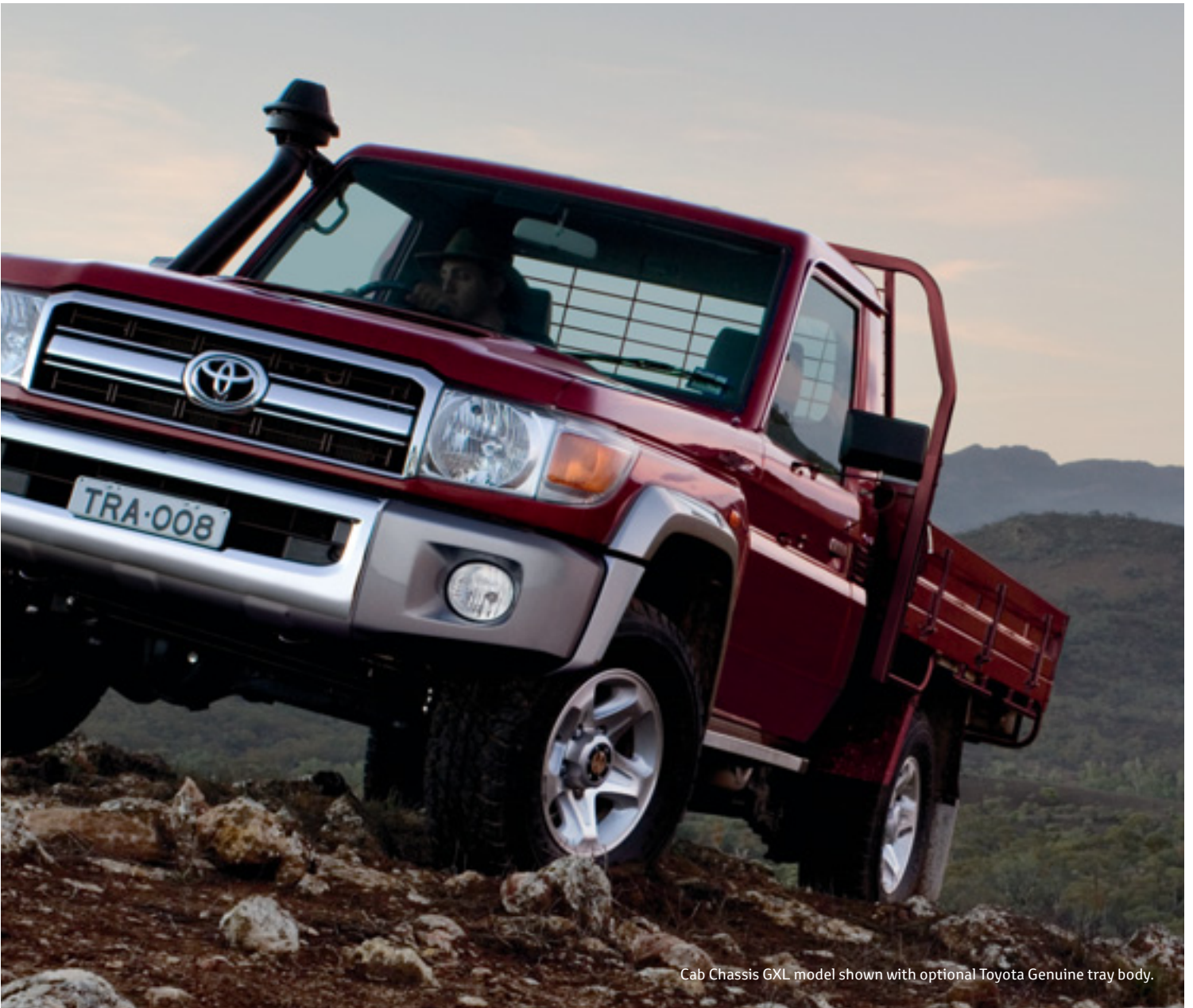
Cab Chassis GXL model shown with optional Toyota Genuine tray body.