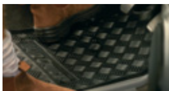
All Weather Rubber Floor Mats - Front