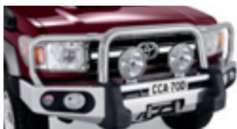
Airbag Compatible Alloy Bull Bar With Driving Lights & Superwinch (sold separately)

LandCruiser 70 Series Cab Chassis GXL model shown in Merlot Red, accessorised with Steel Bull Bar, Side Rails (Front and Side Pair), Superwinch, Driving Lights, Headlamp Covers, Bonnet Protector, Front Weathershields, Canvas Seat Covers and Galvanised Steel Colour-Coded (with Checker Plate Floor) Tray Body. All sold separately.