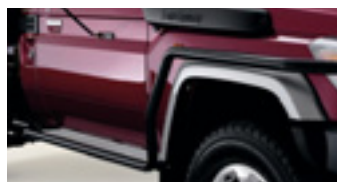
Side Rails - Front & Side Pair (sold separately)