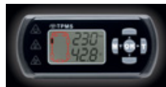
Tyre Pressure Monitoring System

TOYOTA GENUINE ACCESSORIES ARE COVERED BY OUR TOYOTA WARRANTY* Some Toyota Genuine Accessories are not applicable to all models. See your Toyota dealer for advice regarding Toyota Genuine Accessories. Pictured Accessories are all sold separately. For a comprehensive guide on the entire range of Toyota Genuine Accessories, visit our website at accessories.toyota.com.au .