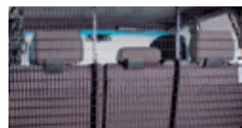
Cargo Barrier Available on Wagon & Troop Carrier models