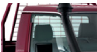
Front Weathershields (sold separately)