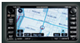
Satellite Navigation 2 Audio System