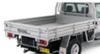
Heavy Duty Galvanised Steel Tray Body (Colour Coded) - Checker Plate Floor Available on Cab Chassis models