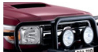
Bonnet Protector & Headlamp Covers (sold separately)