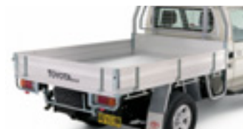
Heavy Duty Alloy Tray Body Available on Cab Chassis models