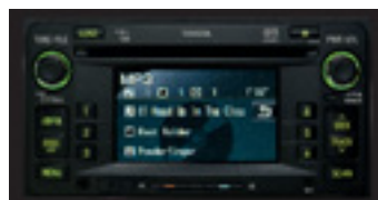
Display Audio System