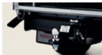
Towbar 3500Kg (Braked), 750Kg (Unbraked) 1 , Towball & Trailer Wiring Harness (sold separately)