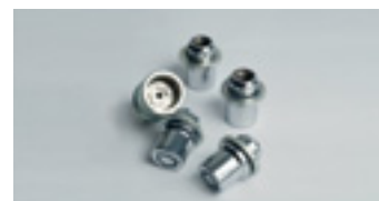
Alloy Wheel Lock Nut Set