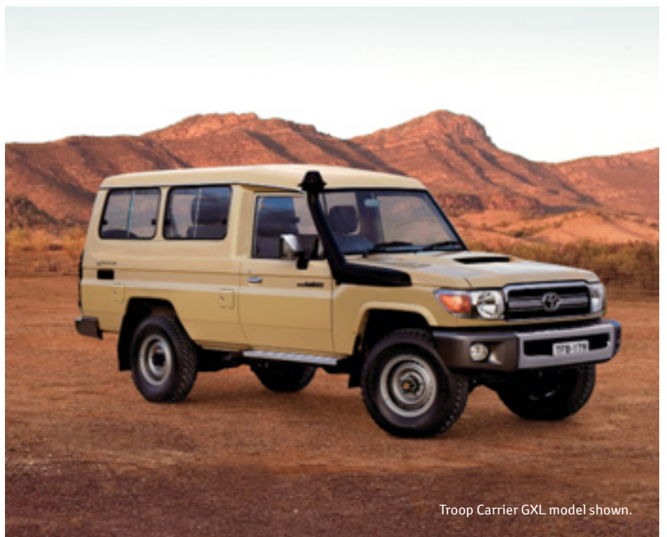
Troop Carrier GXL model shown.