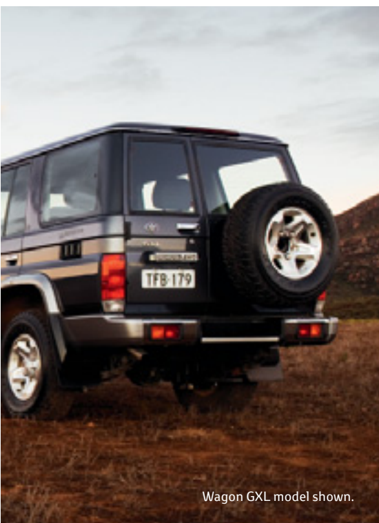
Wagon GXL model shown.