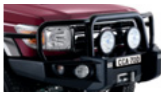
Airbag Compatible Steel Bull Bar With Driving Lights & Superwinch (sold separately)