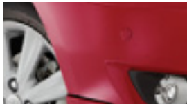
ParkAssist ® – Front Clearance Parking Sensors (2 head kit)