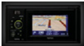
FollowMe ® Sound & Navigation System – Includes Bluetooth ™ Handsfree capabilities, and is compatible with Video and some iPods ® , MP3 and USB sticks ®