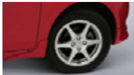
15" Talon Alloy Wheels (Tungsten)