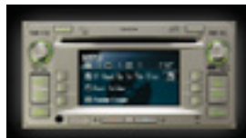
Display Audio System – Includes 6 in-dash MP3/CD Changer & Radio with Bluetooth ™ featuring Handsfree capabilities & Audio Streaming, and is compatible with Video and some iPods ® , MP3 and USB sticks ® (YR & YRS models only)