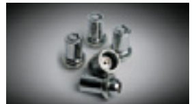
Alloy Wheel Lock Nut Set (YRX model or with Talon or Incisor Alloy Wheels)