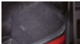
Carpet Floor Mats