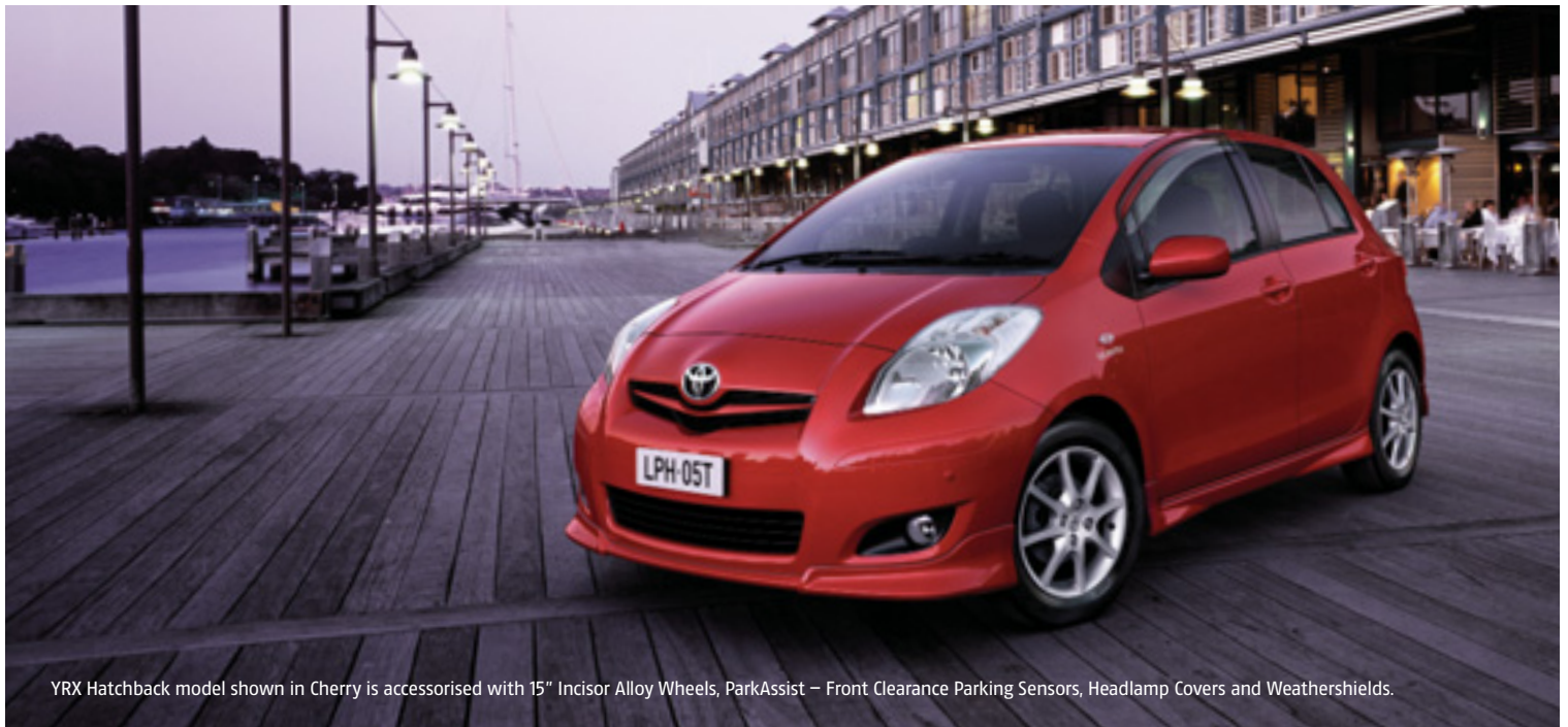
YRX Hatchback model shown in Cherry is accessorised with 15" Incisor Alloy Wheels, ParkAssist – Front Clearance Parking Sensors, Headlamp Covers and Weathershields.