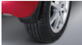
Mudguard (YR & YRS models only)