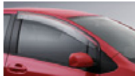
Front Weathershields (sold separately)