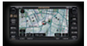
Satellite Navigation Audio System † – Includes 4 in-dash MP3/CD Changer & Radio with Bluetooth ™ Handsfree Communications.