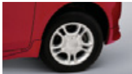
14" Entice Alloy Wheels (YR model only)