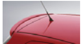
Rear Roof Spoiler (YR & YRS models only)