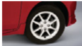
15" Incisor Alloy Wheels