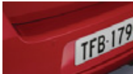
ParkAssist ® – Reverse Parking Sensor (2 head kit)