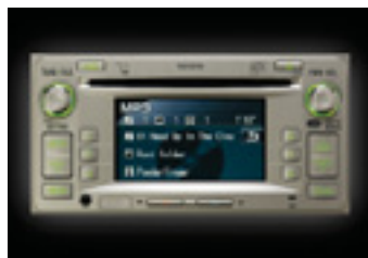
Display Audio System – Includes 6 in-dash MP3/CD Changer & Radio with Bluetooth™ ‡ featuring Handsfree capabilities & Audio Streaming, and is compatible with Video and some iPods® ‡ , MP3 and USB sticks ‡