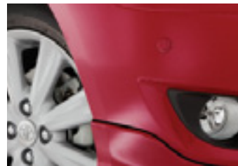
Front ParkAssist™ – Front Clearance Parking Sensors (2 head kit)