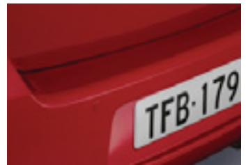
ParkAssist™ – Reverse Parking Sensors (2 head kit)