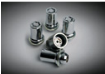
Alloy Wheel Lock Nut Set (YRX model or with Talon or Incisor Alloy Wheels)