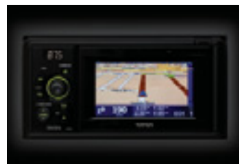
FollowMe® Sound & Navigation System – Includes Bluetooth™ ‡ Handsfree capabilities and is compatible with Video and some iPods® ‡ , MP3 and USB sticks ‡