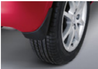
Mudguard (YRS model only)