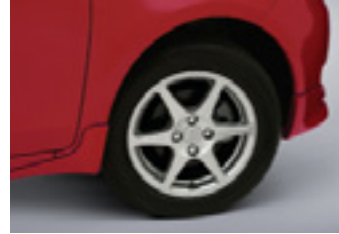
15" Talon Alloy Wheels (Tungsten)