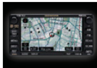
Satellite Navigation Audio System † – Includes 4 in-dash MP3/CD Changer & Radio with Bluetooth™ ‡ Handsfree Communications.