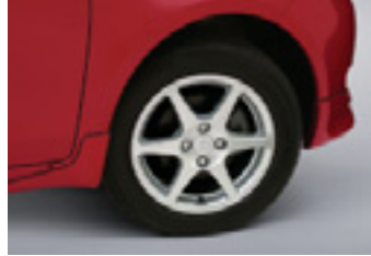
15" Talon Alloy Wheels (Silver)