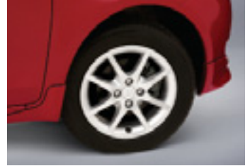
15" Incisor Alloy Wheels