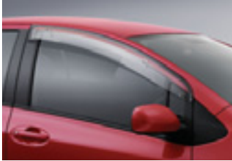
Front Weathershields (Sold Separately)

All images pictured are of the Hatchback model.