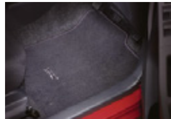
Carpet Floor Mats