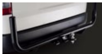
ParkAssist Reverse parking sensors 3 Towbar with Rear Corner Protector sold separately.