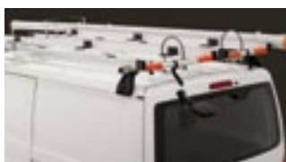
Roof Racks – Full Technician Kit Available on LWB