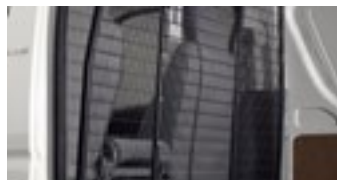
Cargo Barrier Available on LWB & SLWB