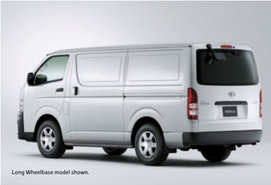
Long Wheelbase model shown.