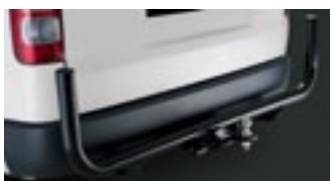
Towbar with Rear Corner Protector 2 Available on LWB. (Requires Towball and Trailer Wiring harness. Sold separately.)