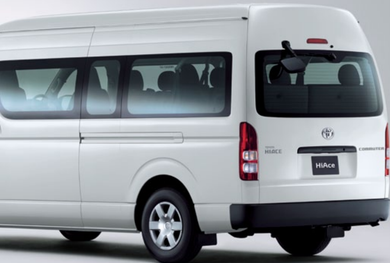
Above: Commuter Bus model shown. Front cover: Super Long Wheelbase model shown.