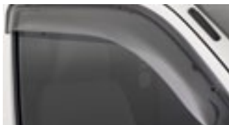
Front Weathershields (Sold separately)