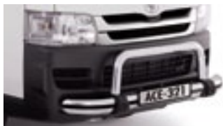
Alloy Nudge Bar & Headlamp Covers (Sold separately)

HiAce featured is accessorised with Full Technician Kit Roof Rack, Alloy Nudge Bar, Cargo Barrier, Front Weathershields and Headlamp Covers. (Sold Separately.)