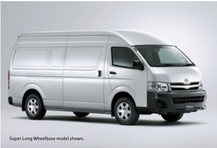
Super Long Wheelbase model shown.