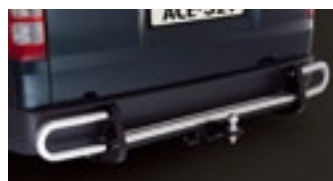
Towbar with Rear Step & Protector 2 Available on LWB. (Requires Towball and Trailer Wiring harness. Sold separately.)