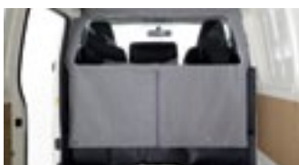
Air Conditioning Curtain Available on LWB