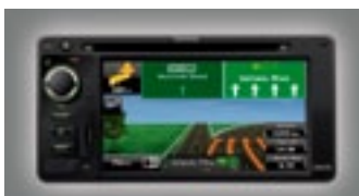
Audio Visual Unit with Satellite Navigation 4

TOYOTA GENUINE ACCESSORIES ARE COVERED BY OUR TOYOTA WARRANTY* Some Toyota Genuine Accessories are not applicable to all HiAce models. See your Toyota dealer for advice regarding Toyota Genuine Accessories. Pictured Accessories are all sold separately. For a comprehensive guide on the entire range of Toyota Genuine Accessories, visit our website at accessories.toyota.com.au .