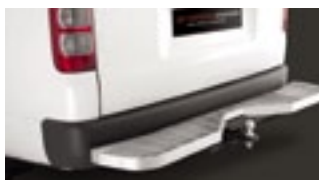
Towbar with Technician Step 2 Available on LWB. (Requires Towball and Trailer Wiring harness. Sold separately.)