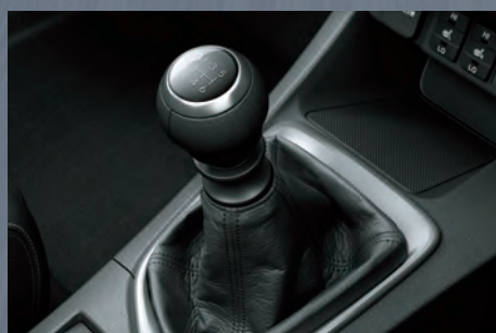
Levin ZR manual premium gear knob.