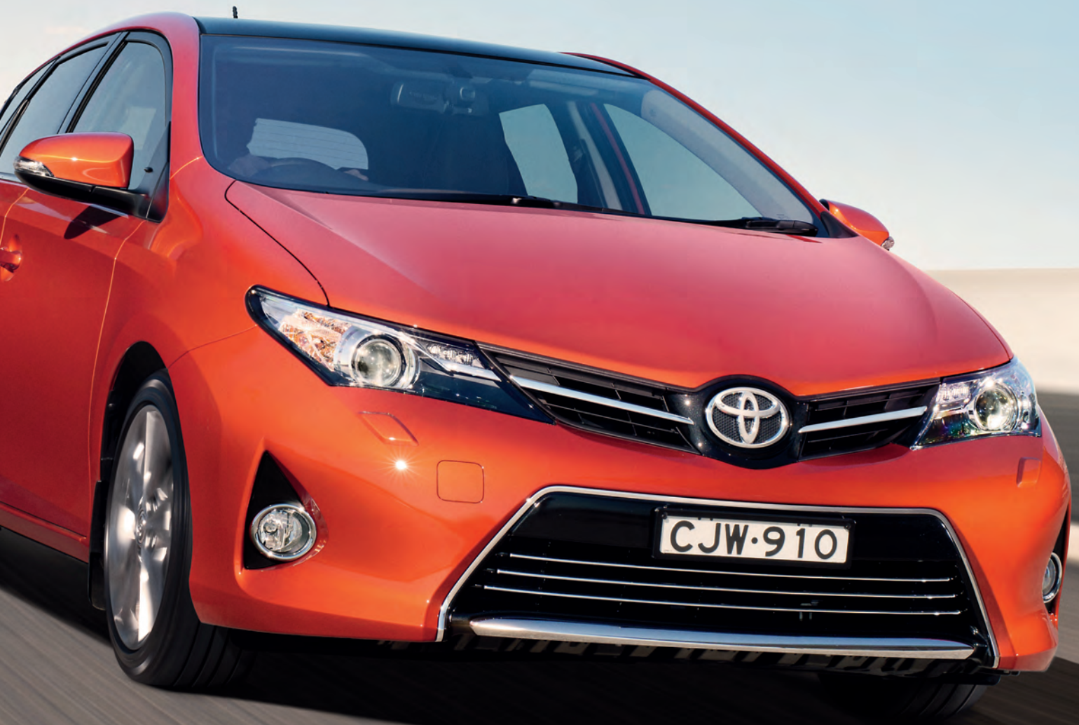
Front cover and above: Levin ZR in Inferno with optional Skyview™ roof shown.