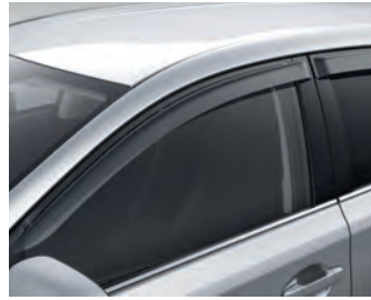
Slimline Weathershields (sold separately)