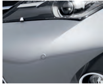
Park Assist 2 Clearance Parking Sensors (4 Head Kit)