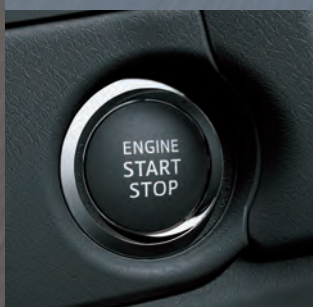
Smart Start button (Levin ZR model only).