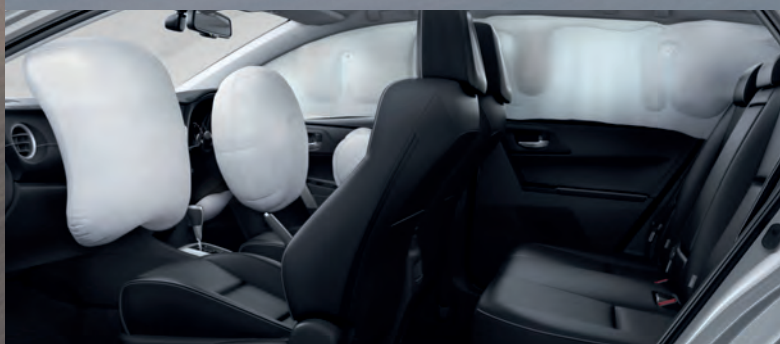
Levin ZR with optional Skyview™ roof shown.