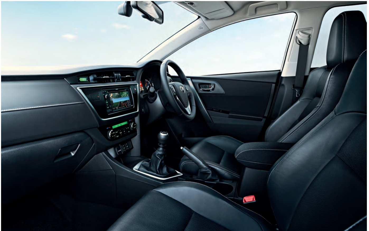
Levin ZR manual with optional Skyview™ roof shown.