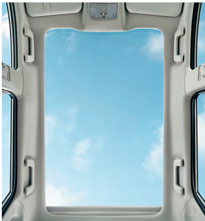
Levin ZR with optional Skyview™ roof shown.

The Corolla Hatch has a spacious interior that's designed with your life in mind. You can take advantage of the increased luggage space and extra legroom for rear seat passengers when you're being social and then simply fold flat all, or just part, of the 60:40 split-fold rear seat back when it's more cargo space you're after.