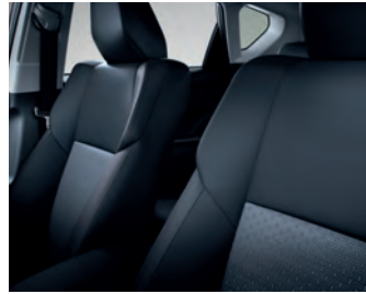
Seat Covers (available for Ascent and Ascent Sport Hatch models only, front and rear set sold separately)