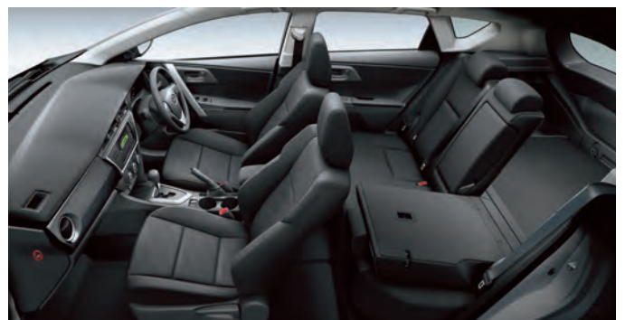
60:40 rear split (Ascent model shown).