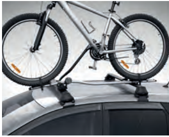
Pro Ride Bicycle Carrier 1

Each model comes with a range of great accessories that allow you to add further style, function and safety to your Corolla.