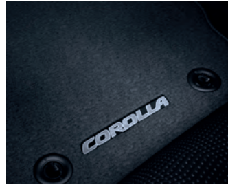
Carpet Floor Mats