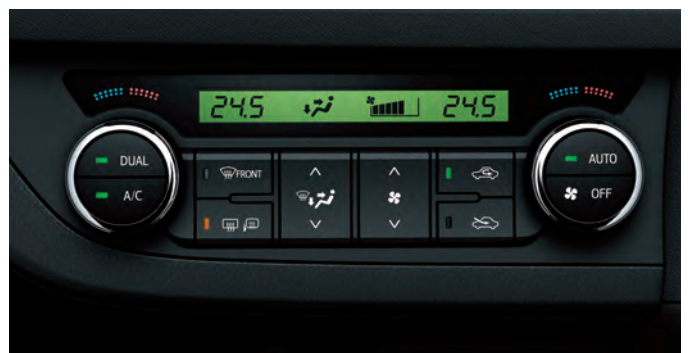
Levin ZR Dual-zone automatic climate control.