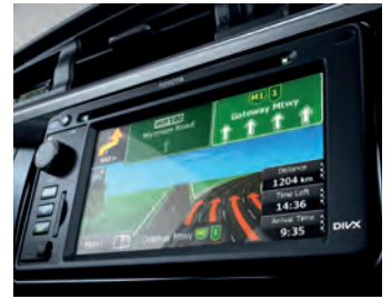
Audio Visual Unit with Satellite Navigation 4