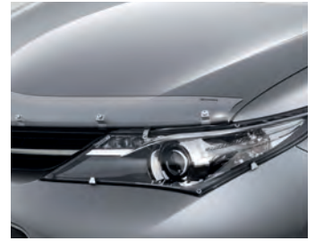
Bonnet Protector and Headlamp Covers 3 (sold separately)