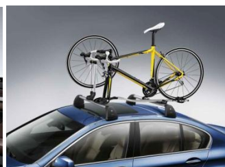
Racing cycle holder