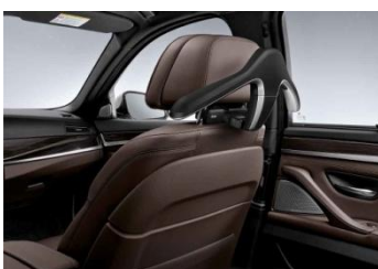
Travel & Comfort System, Hanger