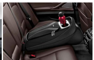
Rear Storage Bag