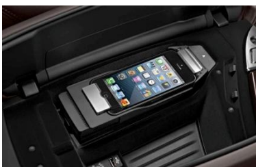
Snap In Adapter

For more information, please contact your preferred BMW Dealer who will be pleased to advise you on the full range of Genuine BMW Accessories, or visit bmw.com.au/accessories .