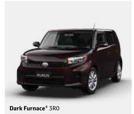
Dark Furnace 4 3R0