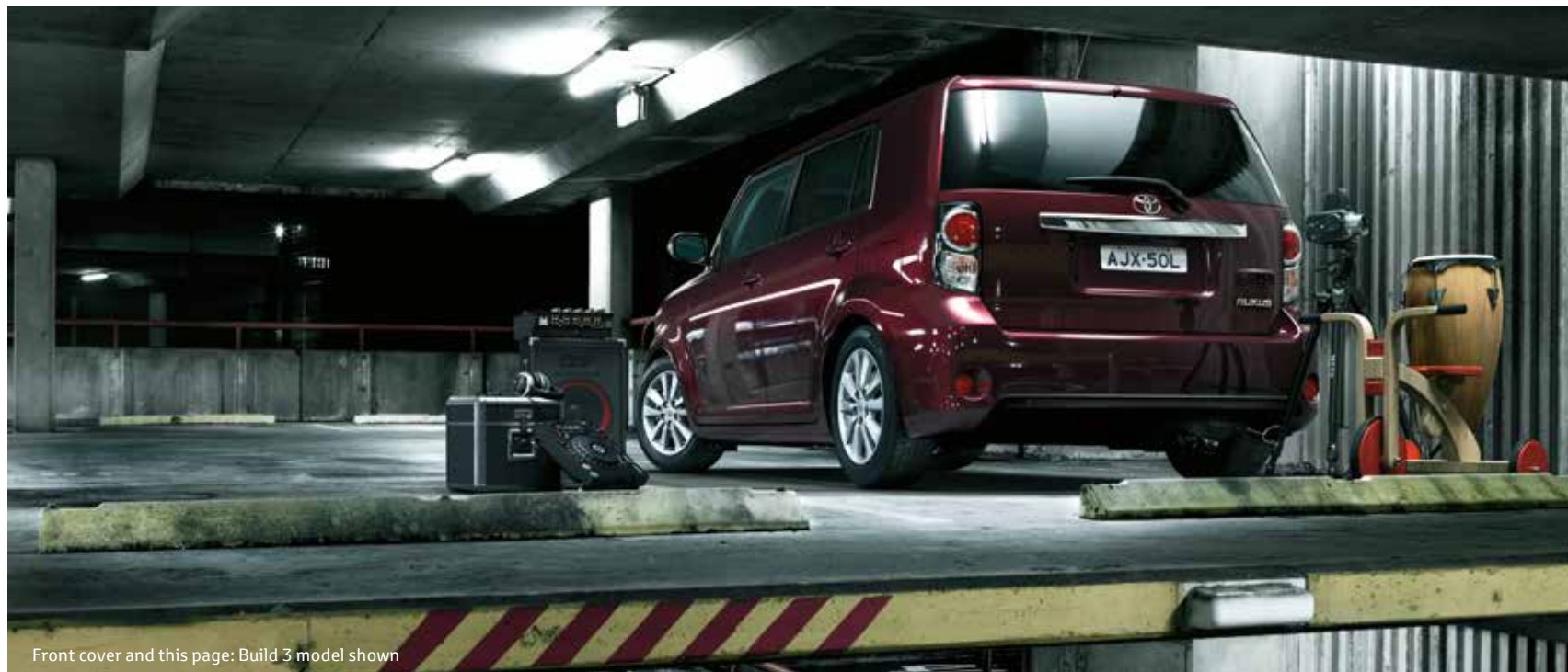
Front cover and this page: Build 3 model shown

On Build 3, you'll also be reaching for the stars through the one-touch tilt and slide moonroof.