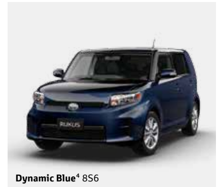
Dynamic Blue 4 8S6