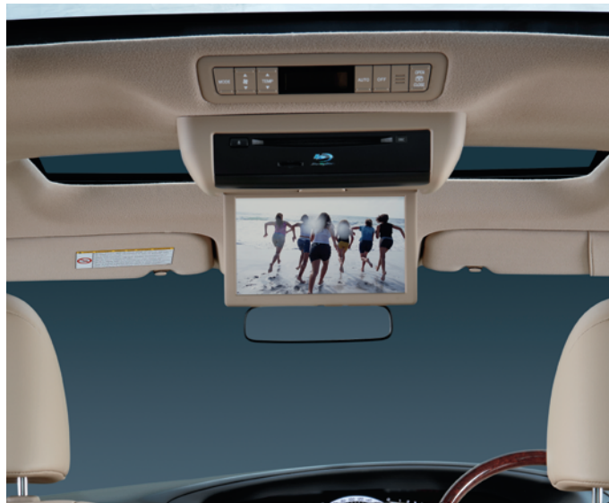
Ultima model shown with Blu-Ray™ and DVD compatible Rear Seat Entertainment system