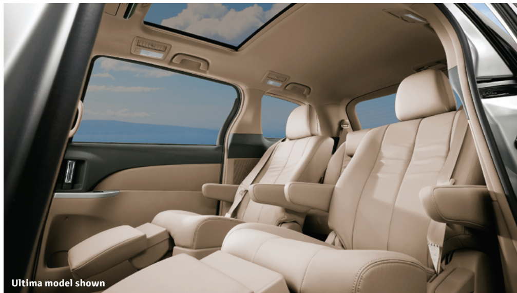
Ultima model shown