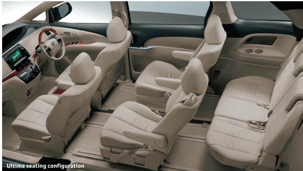
Ultima seating configuration