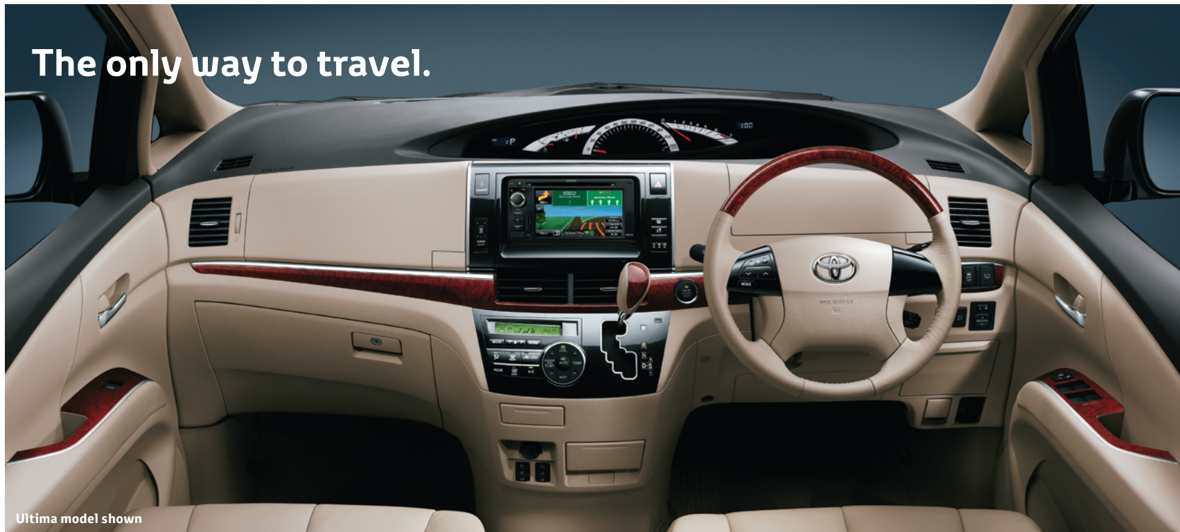
Ultima model shown

Step inside, and the Tarago only gets more intelligent and comfortable. From the adjustable seating (easily accommodating eight adults) and storage space, to the captain chairs up front on the V6 GLX and Ultima, to the front climate control air conditioning, sit back in comfort for every ride. And for the driver, Tarago's cruise control and the option of parking sensors 1 make every drive that much easier.