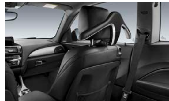
INTERIOR Pages 12–17