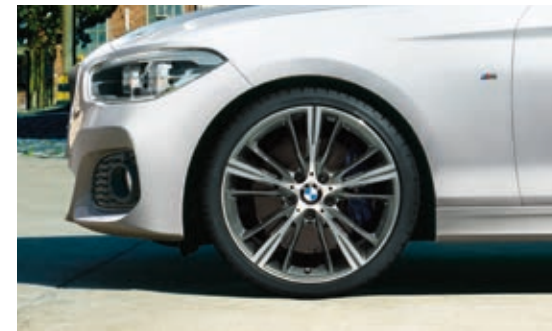
EXTERIOR Pages 04–09