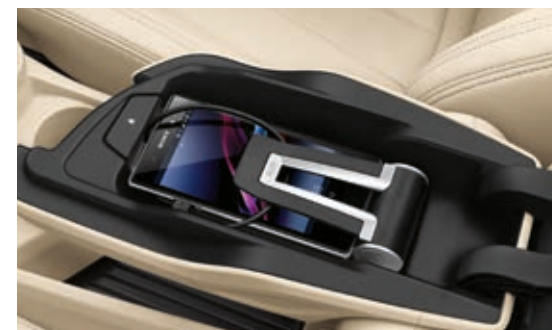
COMMUNICATION & INFORMATION Pages 18–21