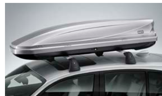
TRANSPORT & LUGGAGE SOLUTIONS Pages 22–27