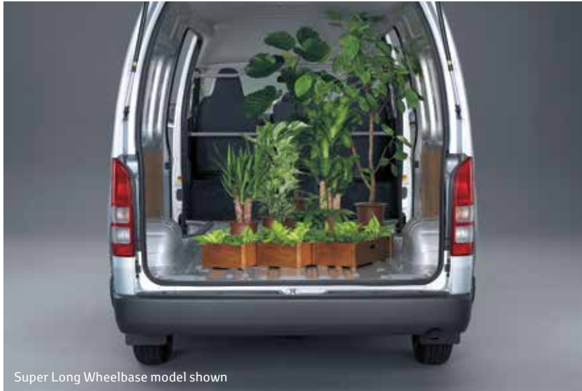
Super Long Wheelbase model shown