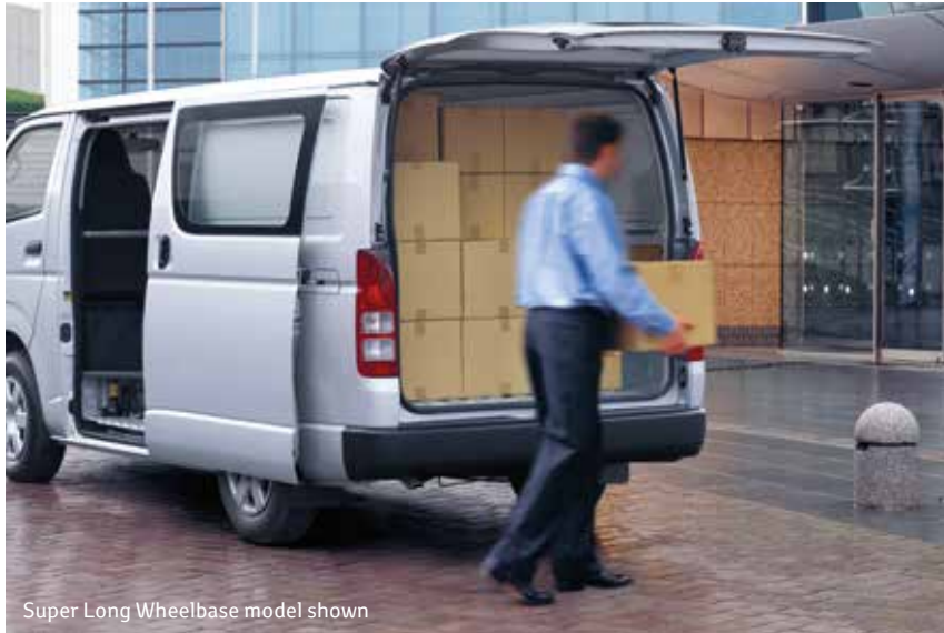
Super Long Wheelbase model shown