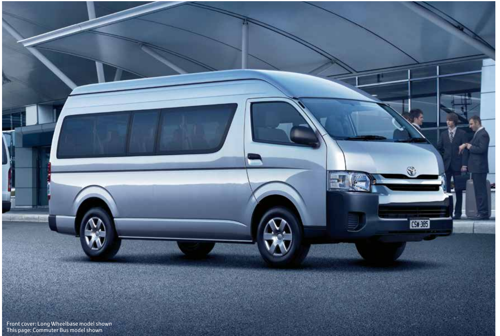
Front cover: Long Wheelbase model shown This page: Commuter Bus model shown