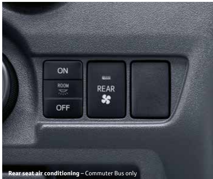
Rear seat air conditioning – Commuter Bus only

When backing up, the reversing camera 3 helps with the image shown on a 3.3" integrated display within the electro-chromatic rear view mirror. Plus there are plenty of storage spaces including moulded pockets and retractable cup holders.