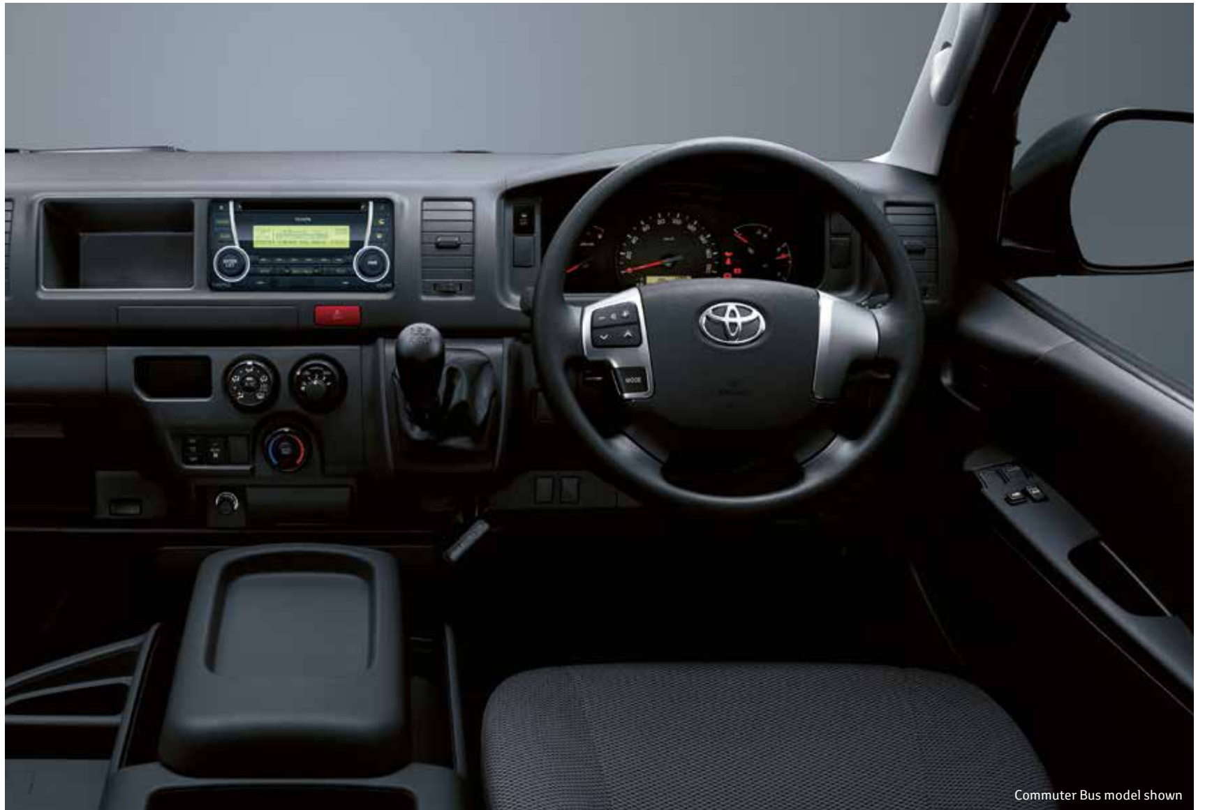
Commuter Bus model shown