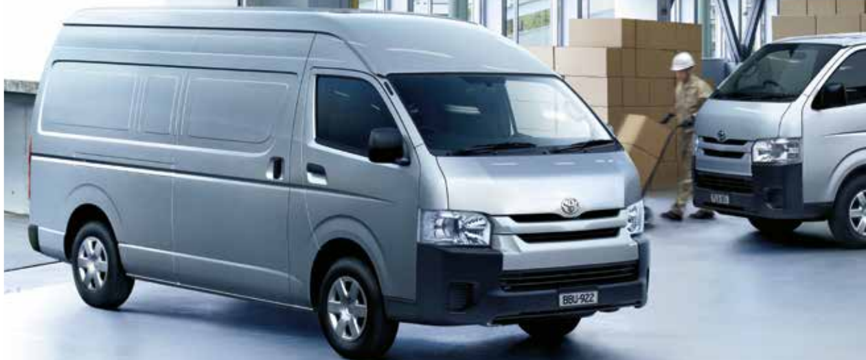
Super Long Wheelbase model shown