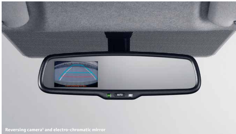
Reversing camera 3 and electro-chromatic mirror