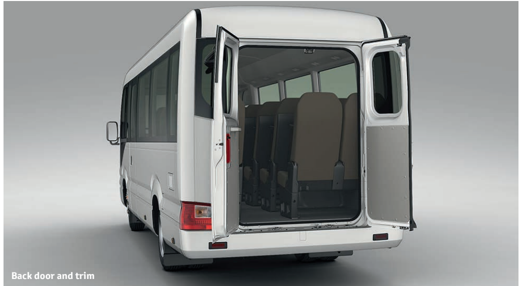
Back door and trim