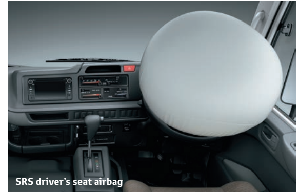
SRS driver's seat airbag

The 6.1" colour touchscreen display delivers crisp, clear sound throughout the cabin. It also features