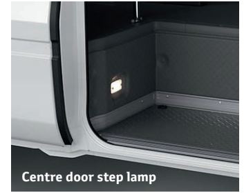
Centre door step lamp