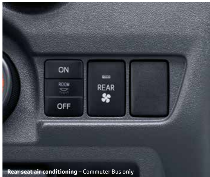
Rear seat air conditioning – Commuter Bus only

When backing up, the reversing camera 4 helps with the image shown on a 3.3" integrated display within the electro-chromatic rear view mirror. Plus there are plenty of storage spaces including moulded pockets and retractable cup holders.