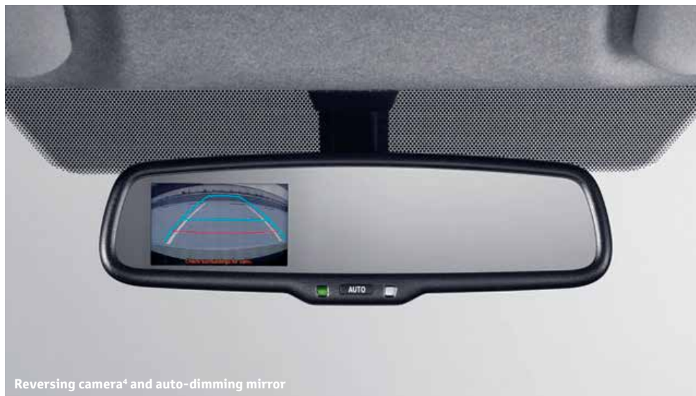
Reversing camera 4 and auto-dimming mirror