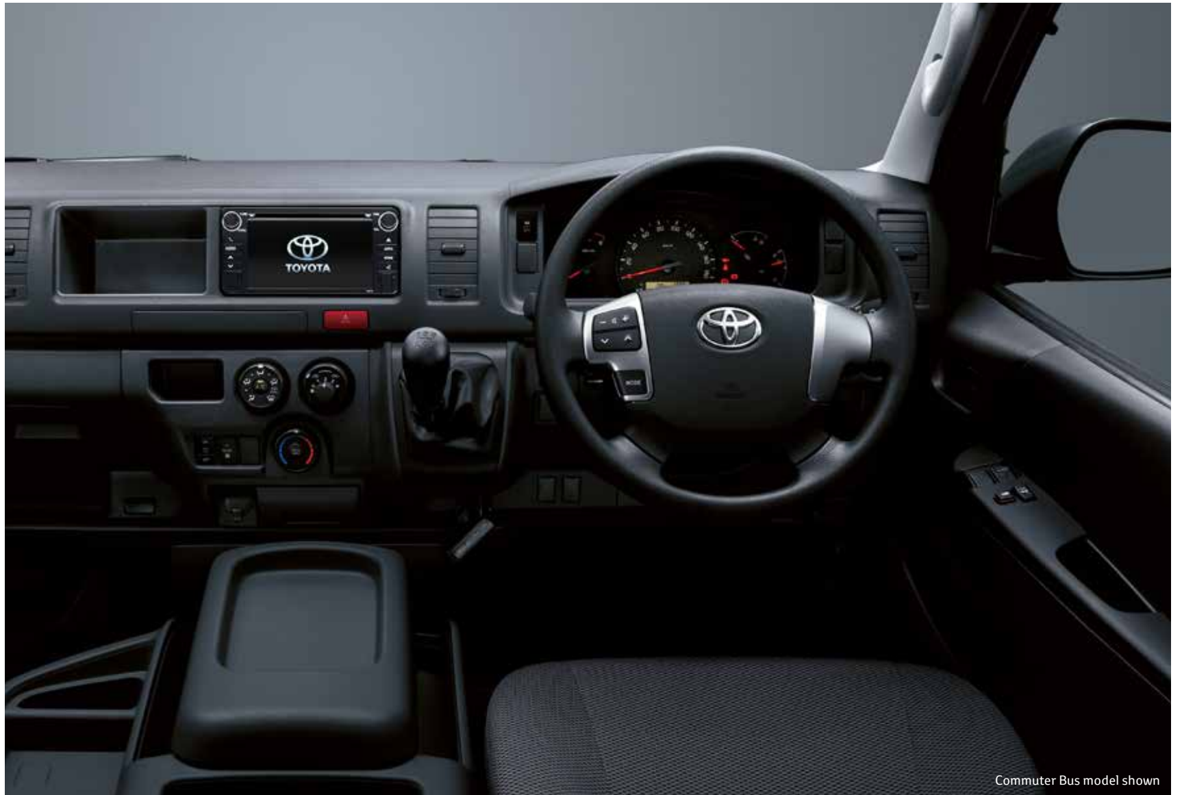
Commuter Bus model shown