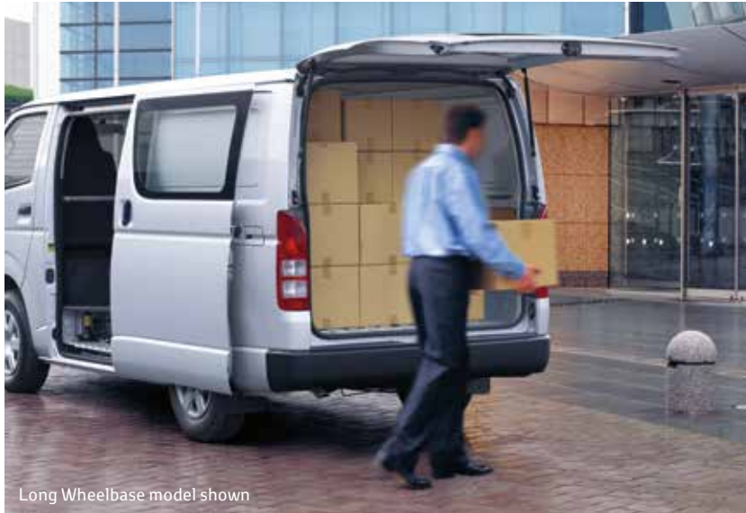
Long Wheelbase model shown