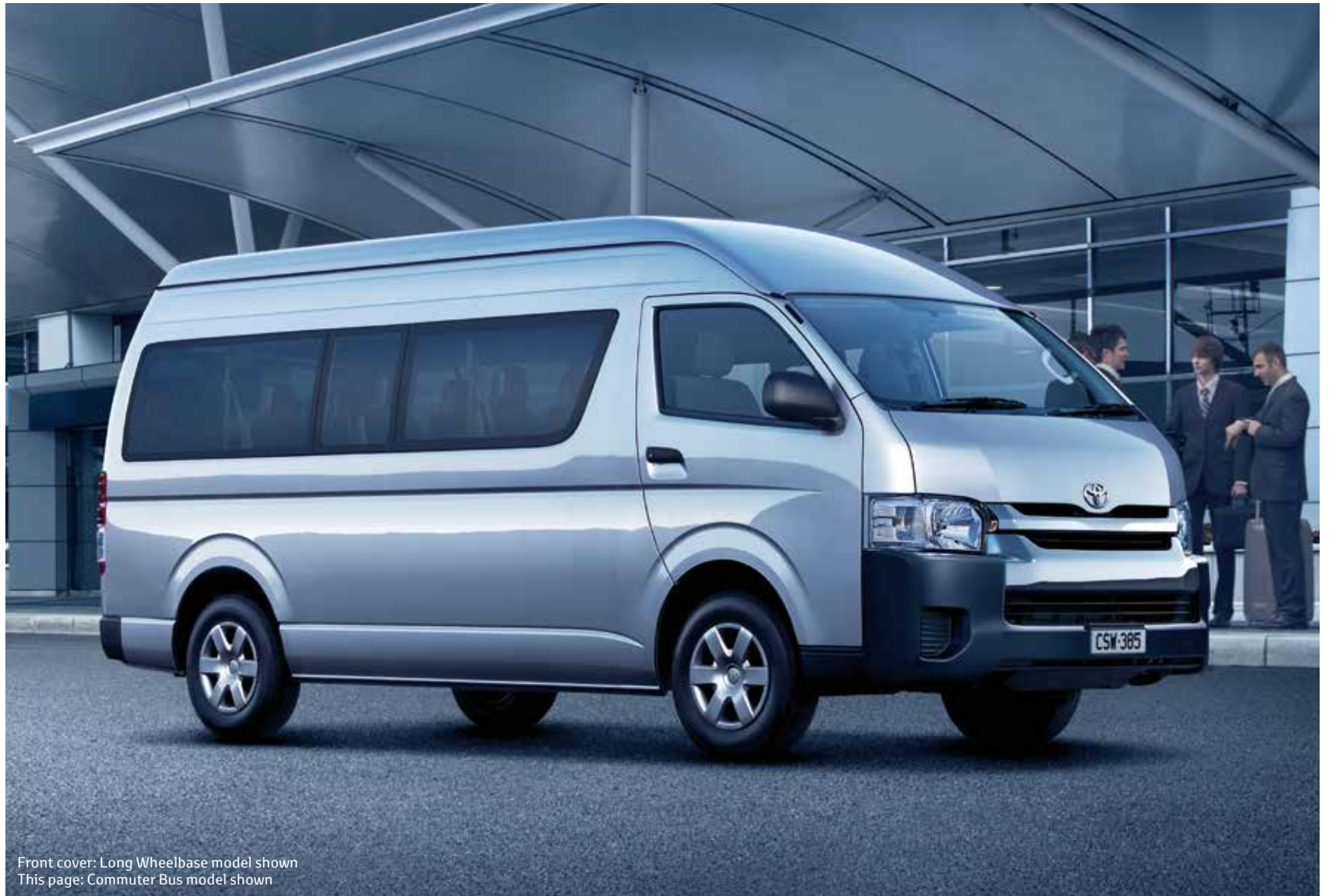
Front cover: Long Wheelbase model shown This page: Commuter Bus model shown