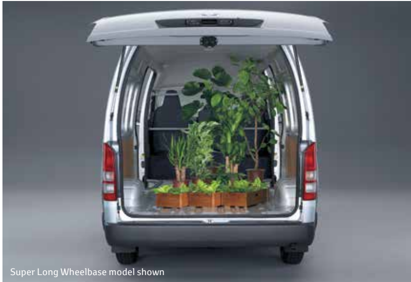
Super Long Wheelbase model shown