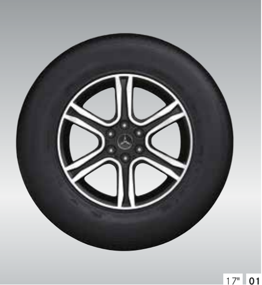
17" 01 02 18"