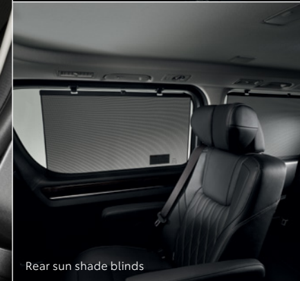
Rear sun shade blinds