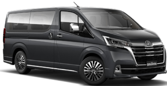
● Graphite 14 1G3