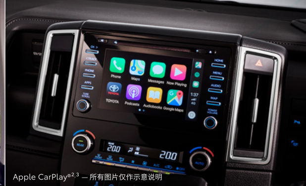
Apple CarPlay *2,3 — 所有图片仅作参考说明