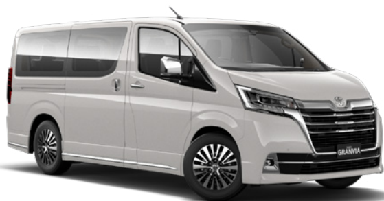
○ Crystal Pearl 14 070