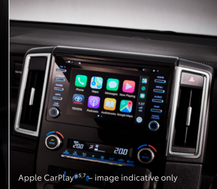
Apple CarPlay ®5,7 – image indicative only