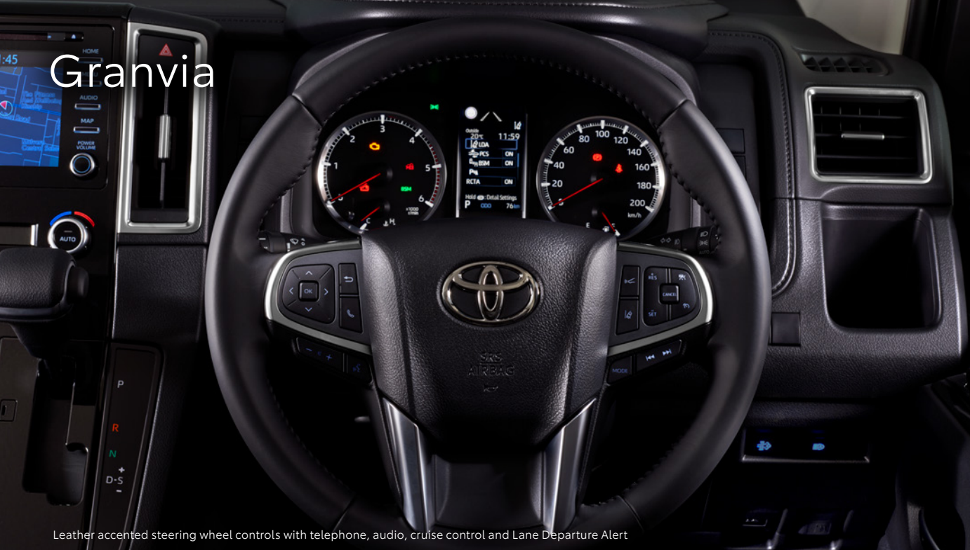
Leather accented steering wheel controls with telephone, audio, cruise control and Lane Departure Alert