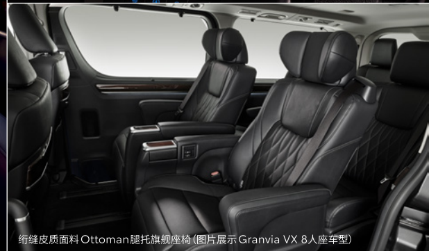
绗缝皮革面料Ottoman腿托旗舰座椅 (图片展示 Granvia VX 8人座车型)