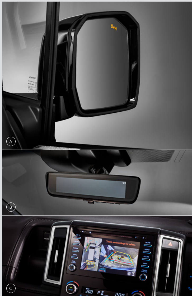
A Blind Spot Monitor 8

The 2.8L turbo diesel engine produces 130kW of power to provide dynamic performance for a vehicle of such generous proportions. The 6-speed automatic transmission delivers smooth control while the Stop and Start system enhances fuel efficiency by stopping the engine at lights or in congestion. The 70L fuel tanks provide impressive range and up to 8.0L/100km 9 fuel economy.