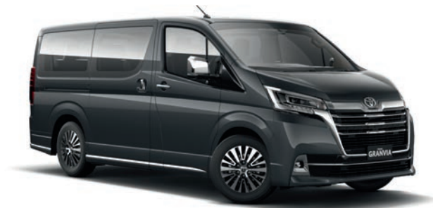
● Graphite 11 1G3