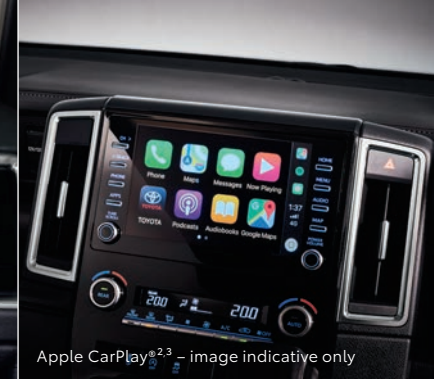
Apple CarPlay ®2,3 – image indicative only