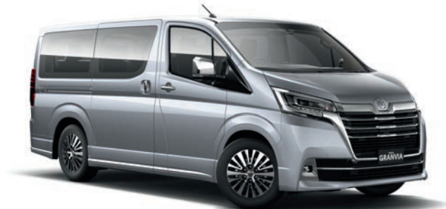
○ Silver Pearl 11 1F7