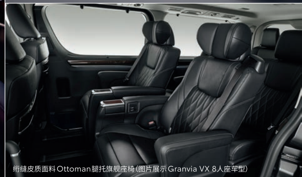
绗缝皮革面料Ottoman腿托旗舰座椅 (图片展示 Granvia VX 8人座车型)