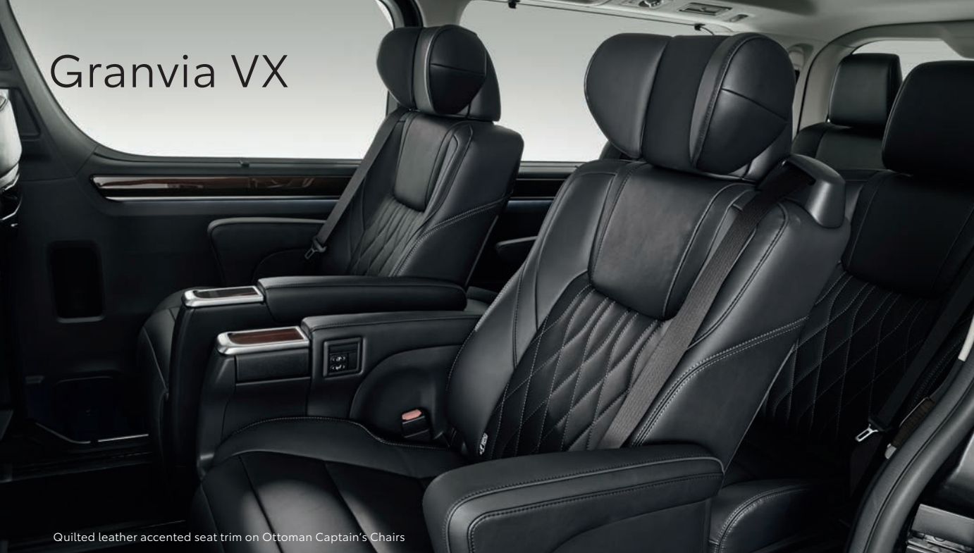
Quilted leather accented seat trim on Ottoman Captain's Chairs