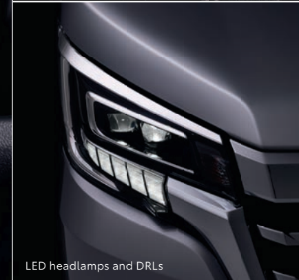
LED headlamps and DRLs