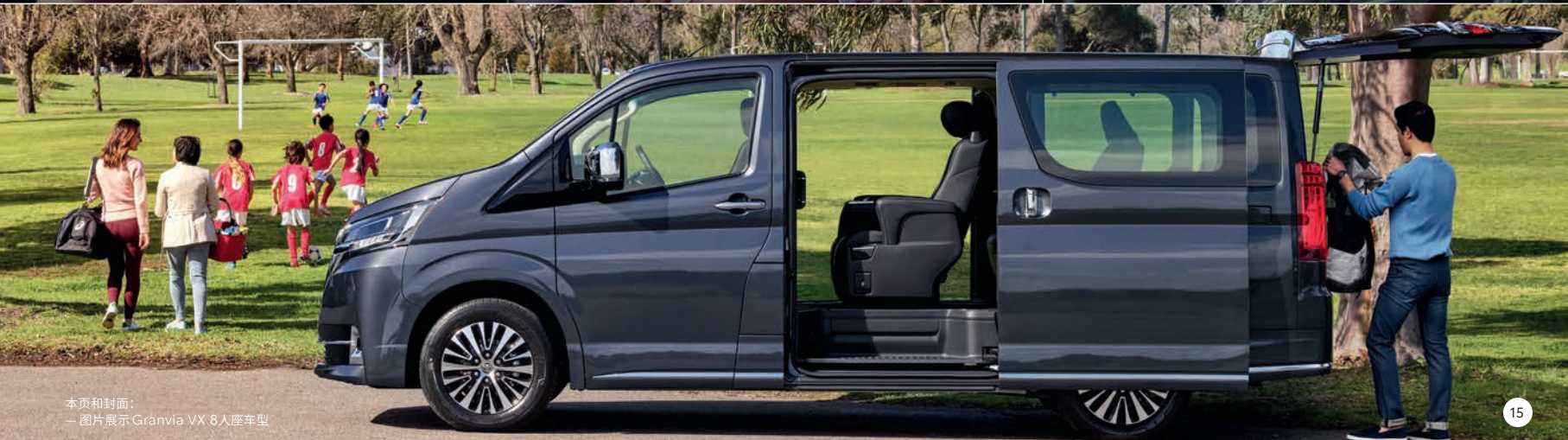
本页和封面： — 图片展示 Granvia VX 8人座车型