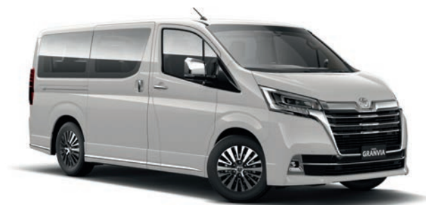
○ Crystal Pearl 11 070