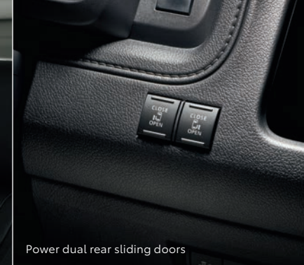
Power dual rear sliding doors