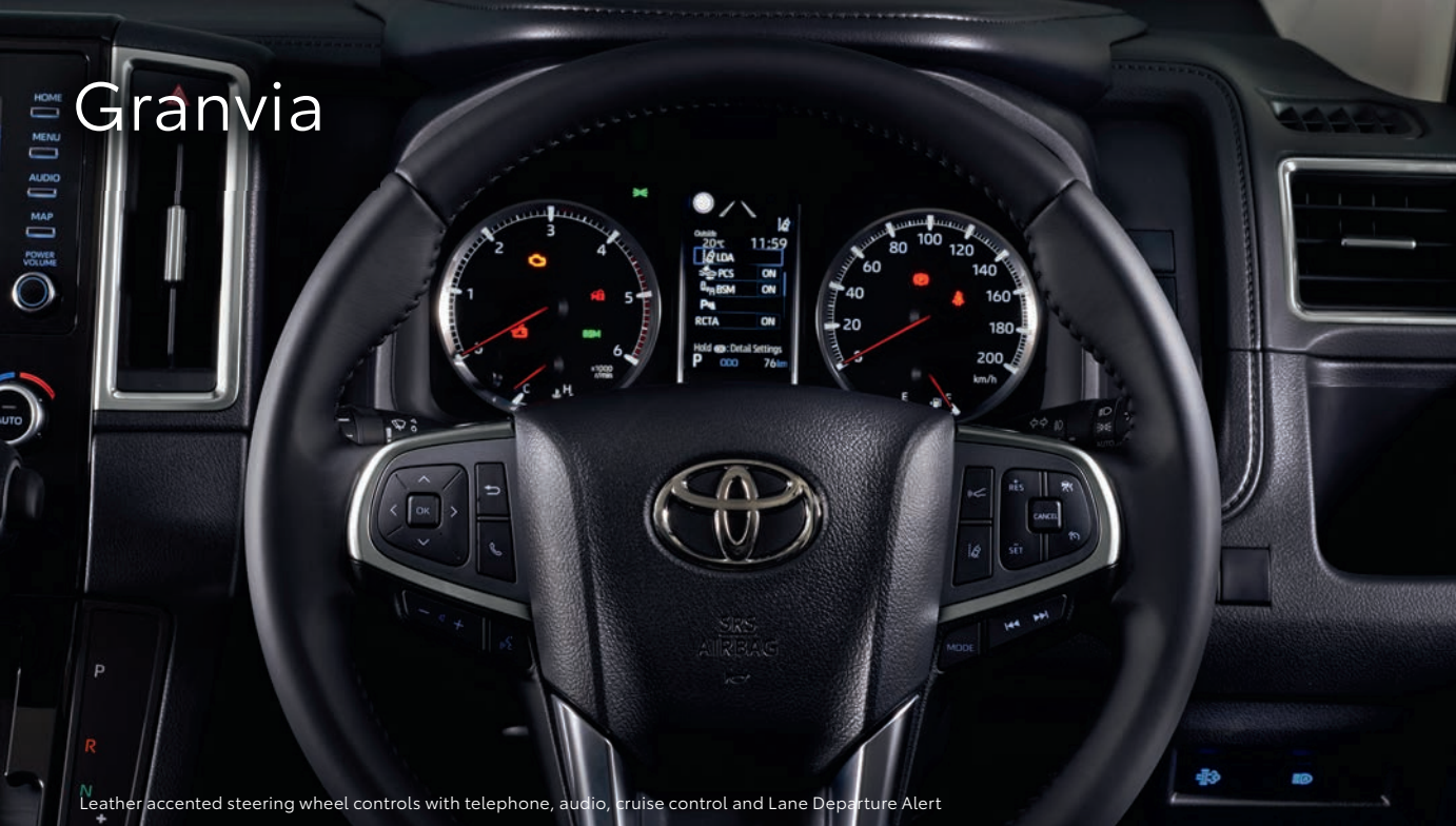
Leather accented steering wheel controls with telephone, audio, cruise control and Lane Departure Alert