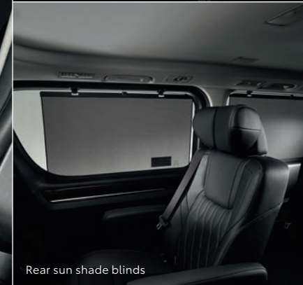
Rear sun shade blinds