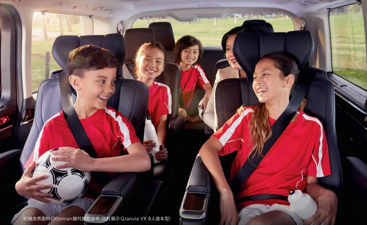
绗缝皮革面料Ottoman腿托旗舰座椅 (图片展示 Granvia VX 8人座车型)