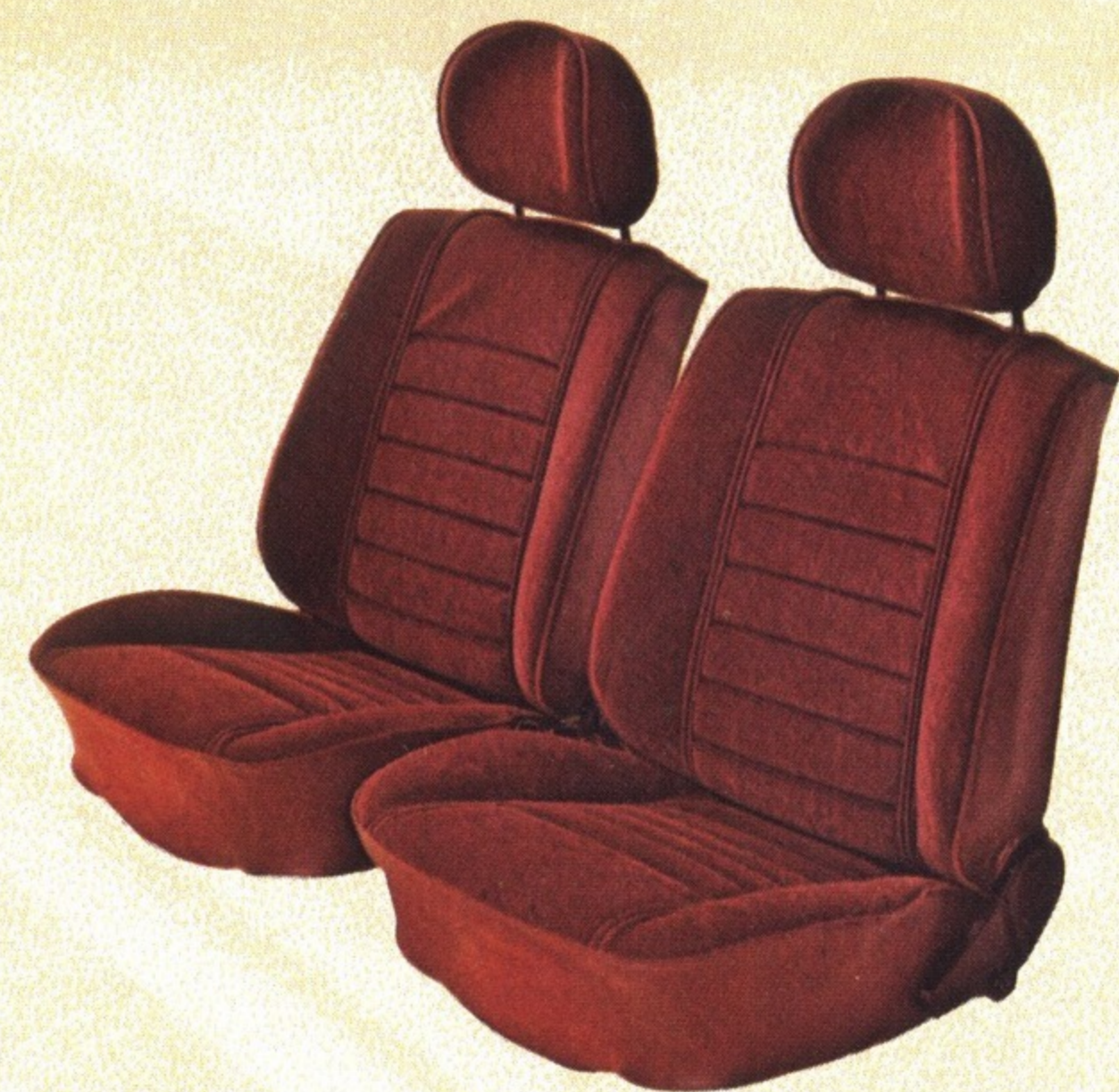
Aubergine (Burgundy) interior, with Pearl Metallic exterior.