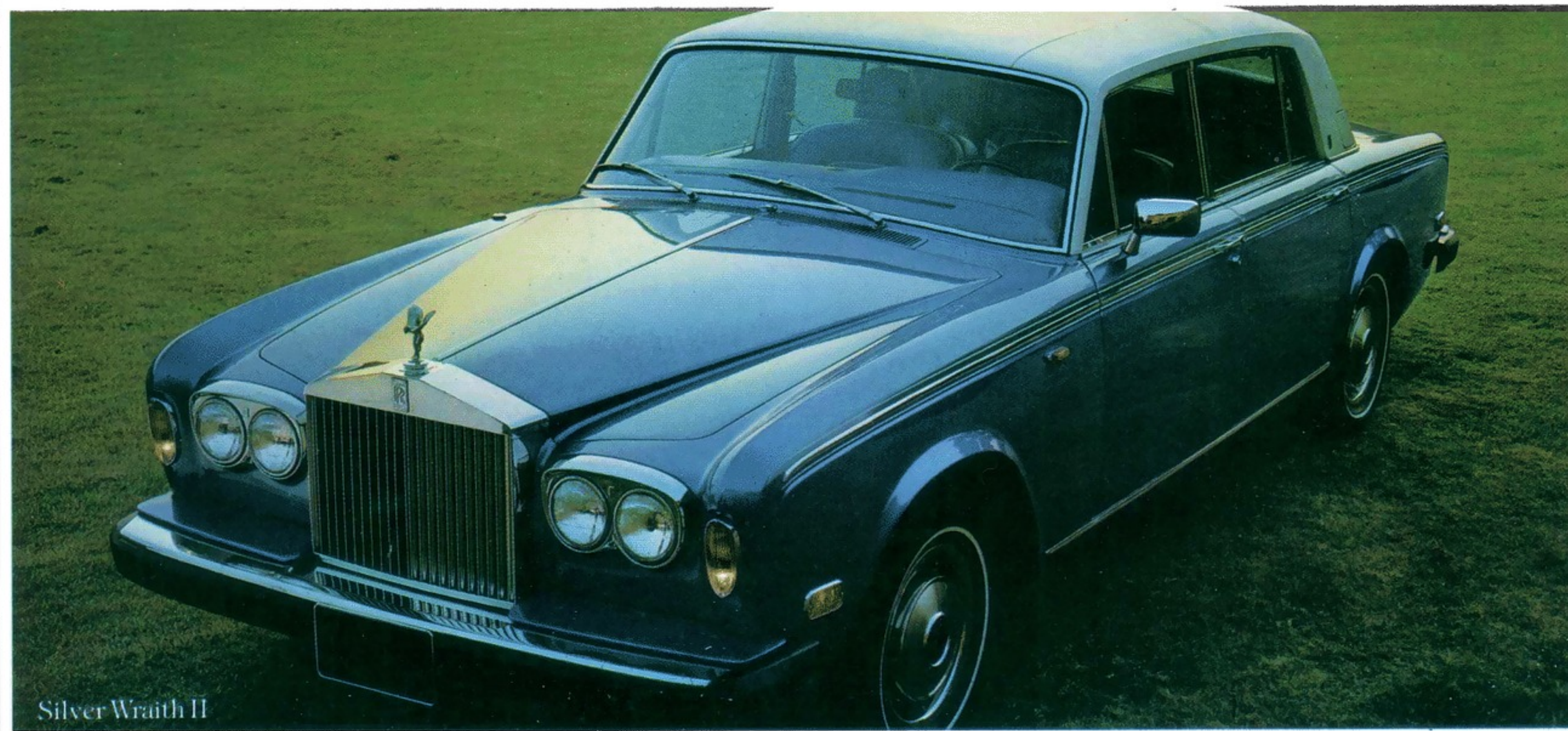
Silver Wraith II