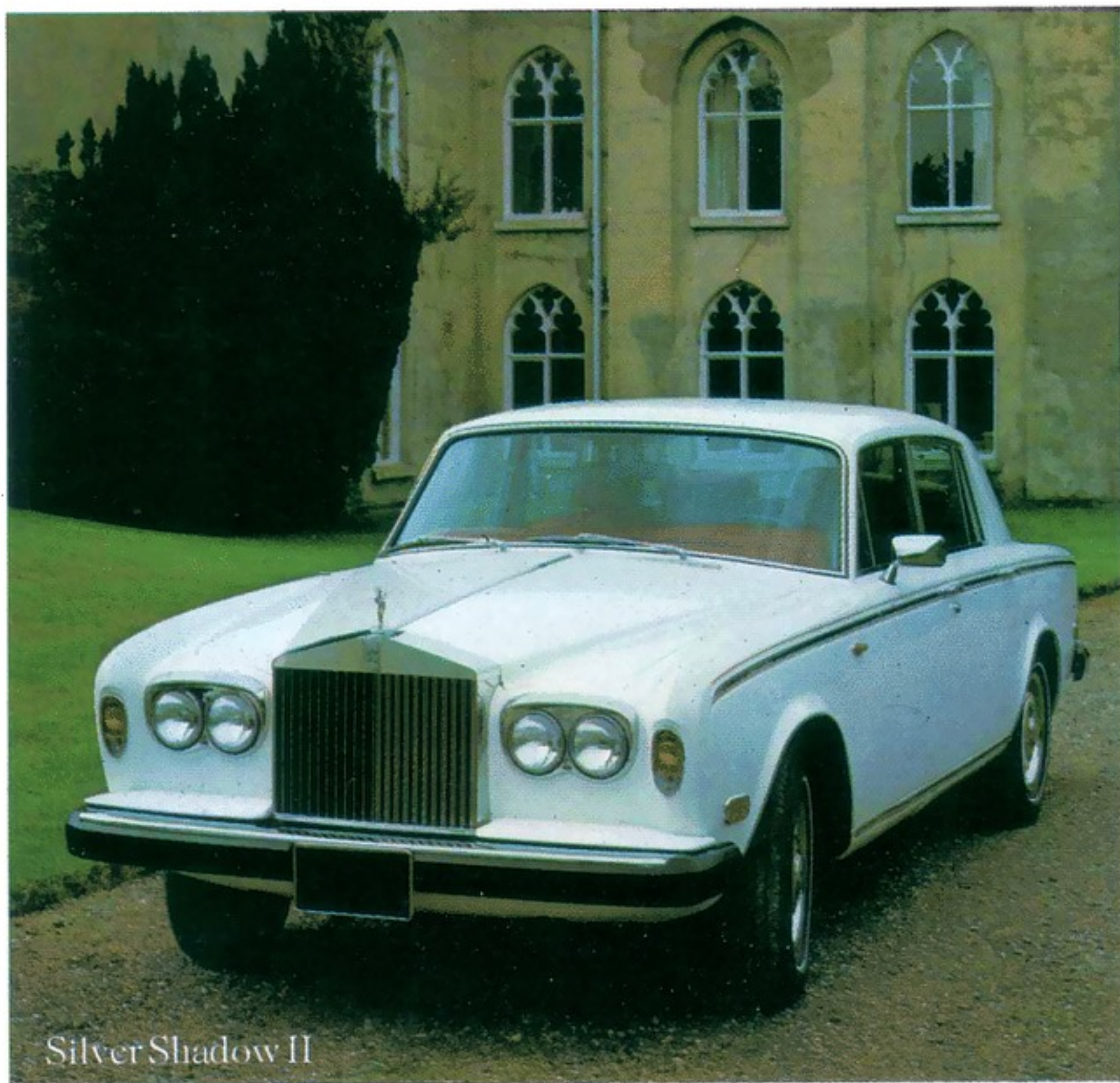
Silver Shadow II