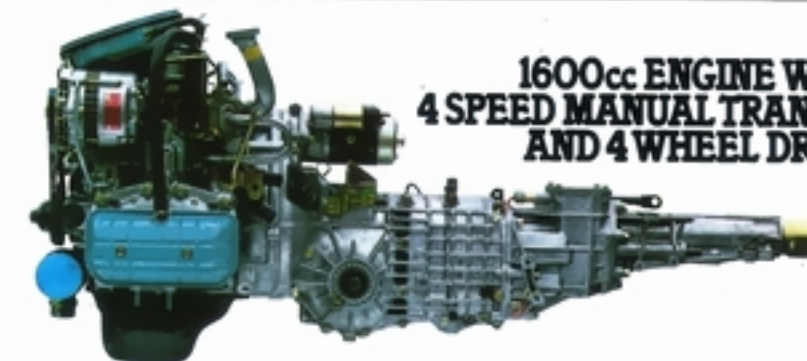
1600cc ENGINE WITH 4 SPEED MANUAL TRANSMISSION AND 4 WHEEL DRIVE