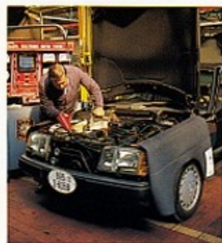
Your confirmation portfolio includes useful information about driving—and traveling—in Europe. Once your car is returned to the U.S., it is checked out at a Vehicle Preparation Center before delivery to your dealer.

Our current European Delivery Price Guide reflects the estimated customs duty for each Mercedes-Benz model. The dutiable value of all cars is based on transactional value; that is, the price you actually paid or the invoice price.