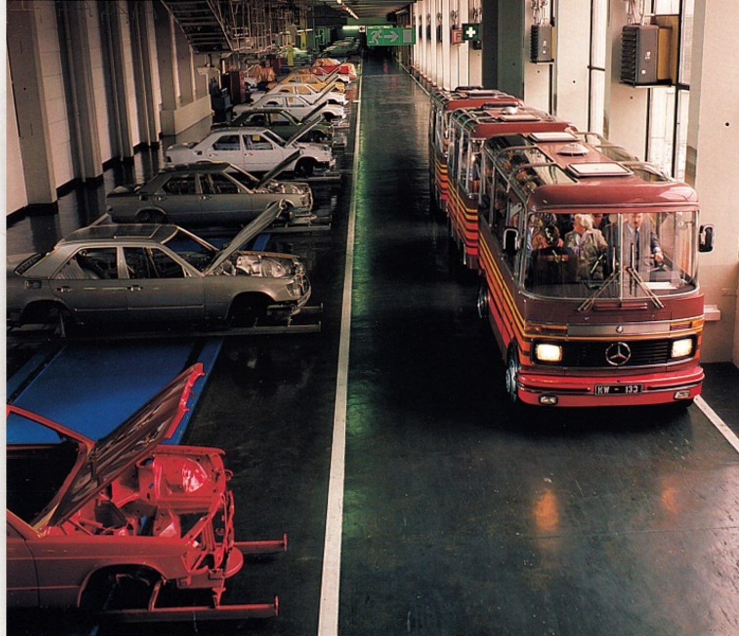
Along much of the 1169 miles of assembly line is something to fascinate—and reassure.