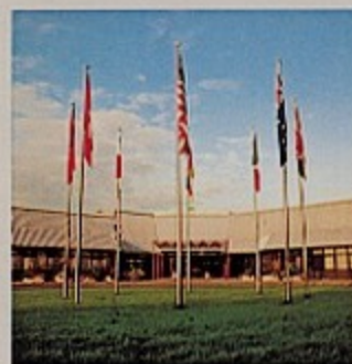
The European Delivery Center, on the grounds of the Mercedes-Benz factory in Sindelfingen, is your first stop on an unforgettable European vacation.

Over 100,000 Americans have experienced firsthand the remarkable ease of picking up a new Mercedes-Benz at the Mercedes-Benz factory in Stuttgart-Sindelfingen, West Germany.