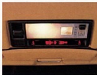
The all-new 300 Class, in six-cylinder gasoline and turbodiesel variants: advanced technology in the service of advanced performance.

The 260E, 300E, the 300D Turbo, and the 300TD Turbo. Four engineering legends from Mercedes-Benz.