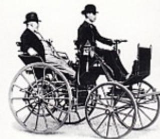
Souvenirs are available in the Delivery Center Gift Shop. The famous Mercedes-Benz museum is located at Mercedes-Benz headquarters in Stuttgart-Untertuerkheim.