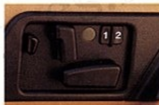
The senior automobiles of Mercedes-Benz—the remarkable S-Class—boast sybaritic comfort and stunning performance across the board.

The Mercedes-Benz S-Class for 1987: no more extraordinary automobiles have ever come from Mercedes-Benz.