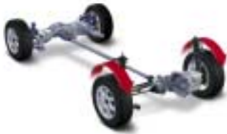
Normally, the front wheels get nearly all of the engine's power.

The advantages of Volvo's AWD system are particularly noticeable on slippery roads. Since the pair of wheels with the best traction always receives most power, the vehicle is outstandingly stable. And making your way on slippery road surfaces is no problem. The AWD system's short reaction time provides immediate power to the wheels that need to help get started and maintain control even under difficult conditions. At low speeds, Volvo's anti-spin system, TRACS, ensures that the wheel with the best traction gets the most power.