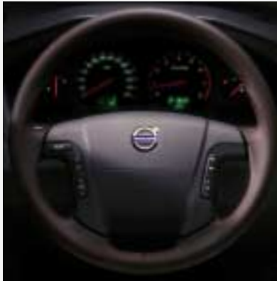
Leather trimmed steering wheel, Brown