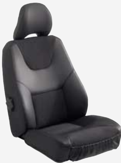
Cloth/vinyl (std.) Graphite (B070)

Leather Graphite upholstery, simulated wood trim inlays, Graphite leather trimmed steering wheel and gear-lever knob.