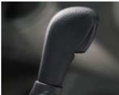
Leather trimmed gear-lever knob, Graphite