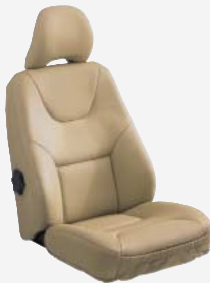
Leather (opt.) Sand (B951)

Leather Sand upholstery, simulated wood trim inlays, Sand leather trimmed steering wheel and Graphite leather trimmed gear-lever knob.