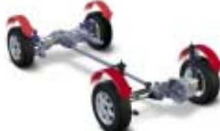
If the front wheels show any tendency to spin, the AWD system responds instantly by redistributing power for maximum stability.