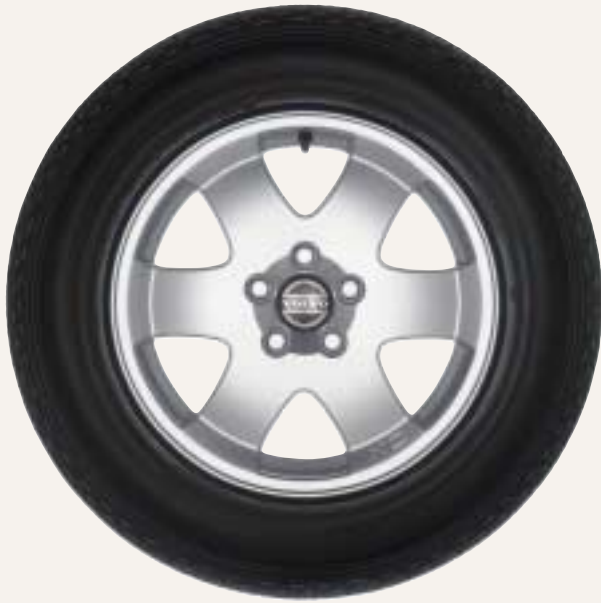
7" x 16" alloy TELLUS (std.) 215/65/16 Pirelli Scorpion All-Season tires