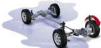
When starting off, only one wheel needs to have traction.