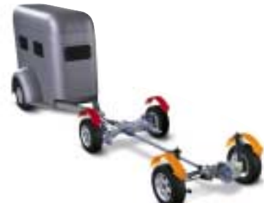
If you carry heavy loads, the rear wheels receive more power to maximize driving stability.