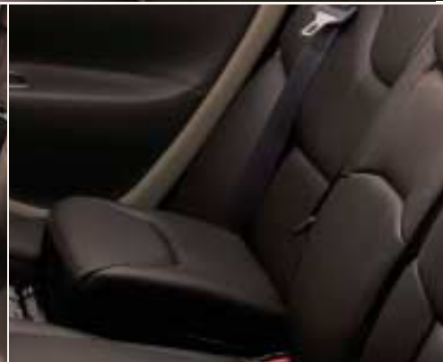
The outboard rear seats can be equipped with integrated booster cushions so that children always sit at the right height and enjoy a perfect view. And when not in use, the booster cushions can be easily folded down in the rear seat.