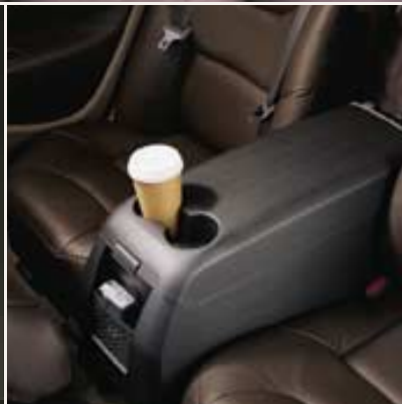
With the center section of the three-split rear seat removed, the optional thermal cooler box can be added. It keeps food and beverages cold for those long road trips.