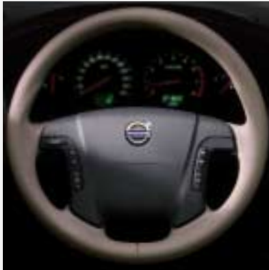
Leather trimmed steering wheel, Taupe