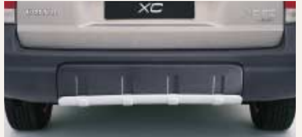
Rear skid plate (opt.)