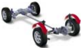
When braking, the car disengages drive to the rear wheels the instant you touch the brake pedal, thereby maximizing control and roadholding.