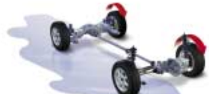
If one or both wheels spin on one side, more power goes instantly to the ones with the best traction.