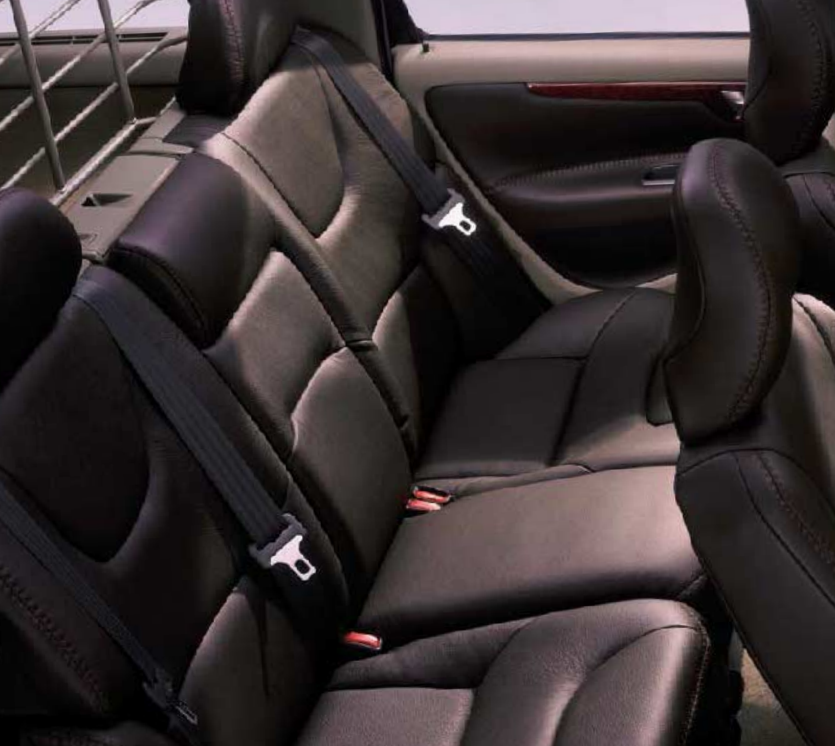
Shown with optional Premium Package and cargo guard