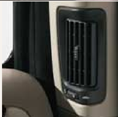
Adjustable air vents for the rear-seat passengers enhance comfort and help keep mist and ice off the side windows.