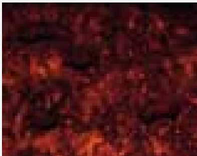
Simulated wood trim inlays