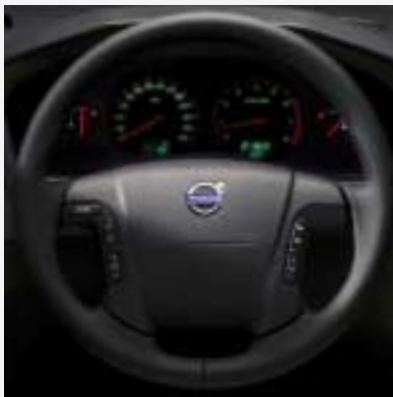
Leather trimmed gear-lever knob, Graphite