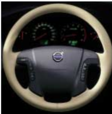
Leather trimmed steering wheel, Sand