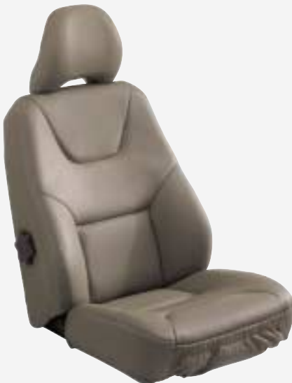
Leather (opt.) Taupe (B980)