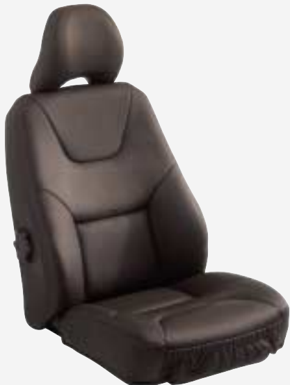
Leather (opt.) Brown (B984)