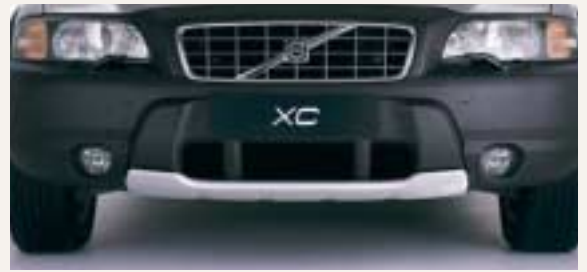
Front skid plate (std.)