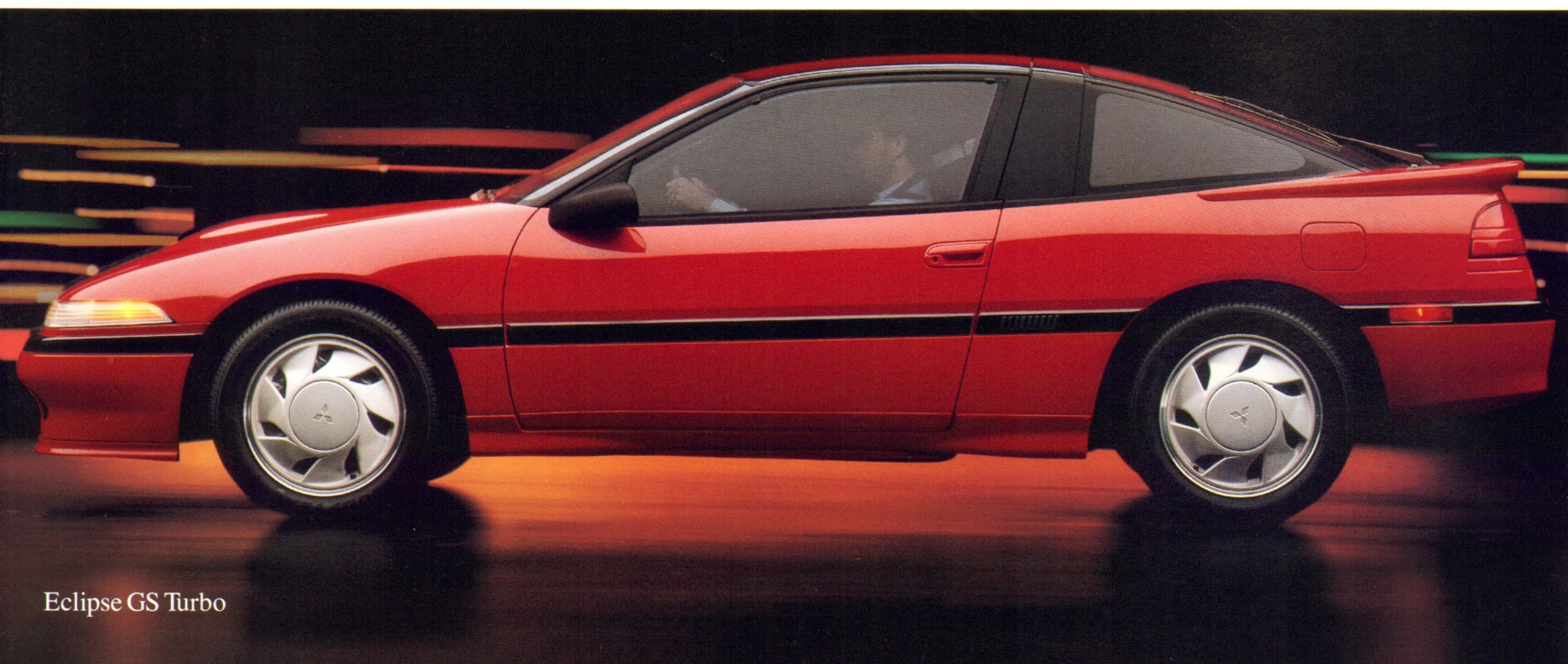
Eclipse GS Turbo

NOTE: Passive restraint system has been disconnected to more clearly depict interior. Seatbelt use is recommended while driving.