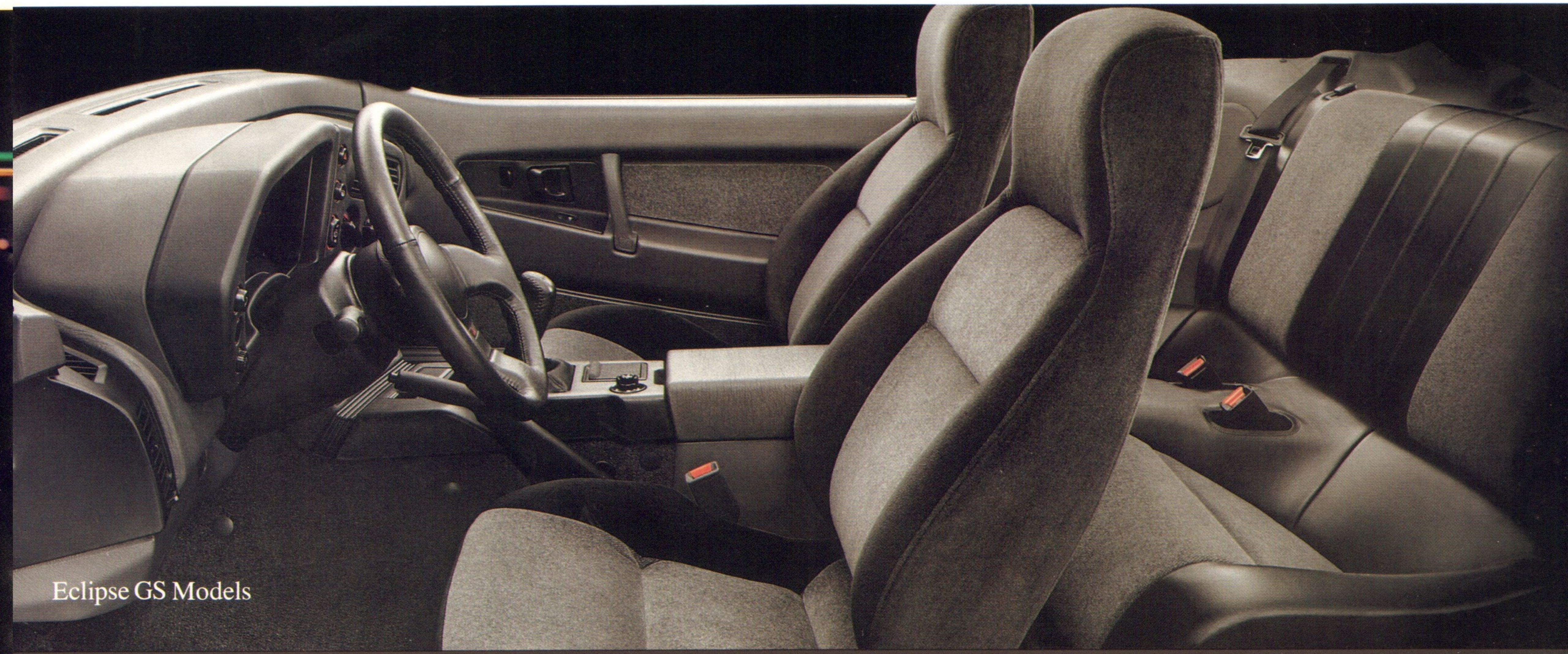
Eclipse GS Models