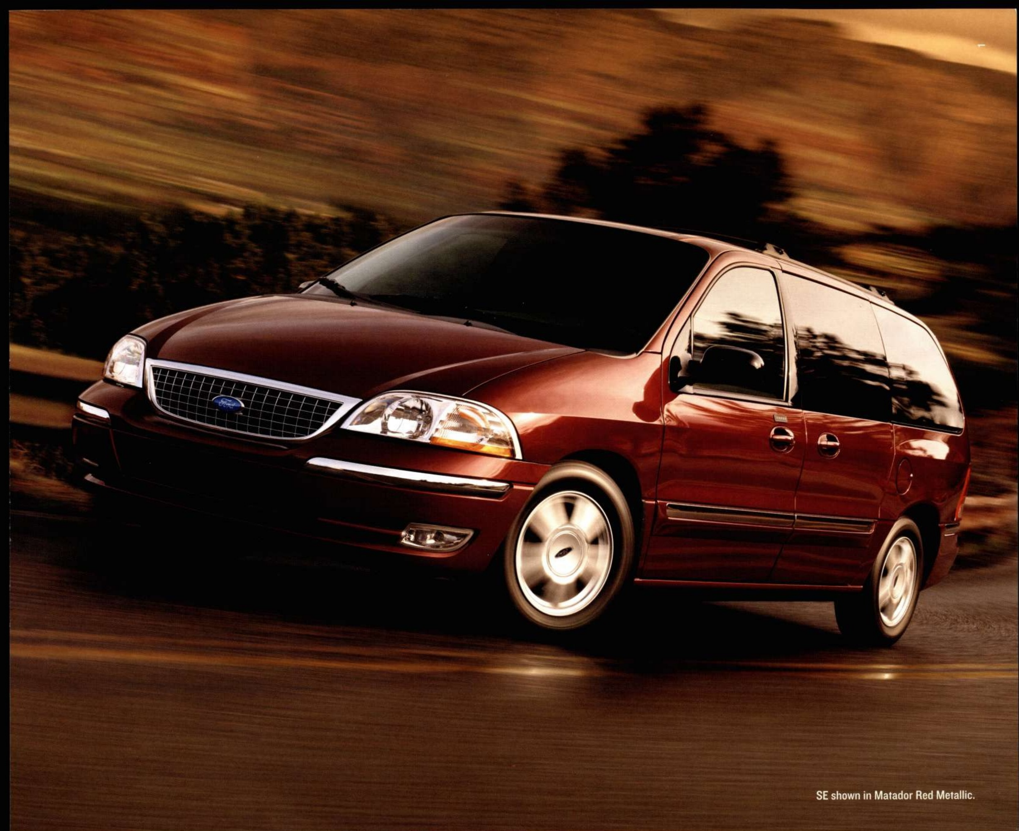
SE shown in Matador Red Metallic.