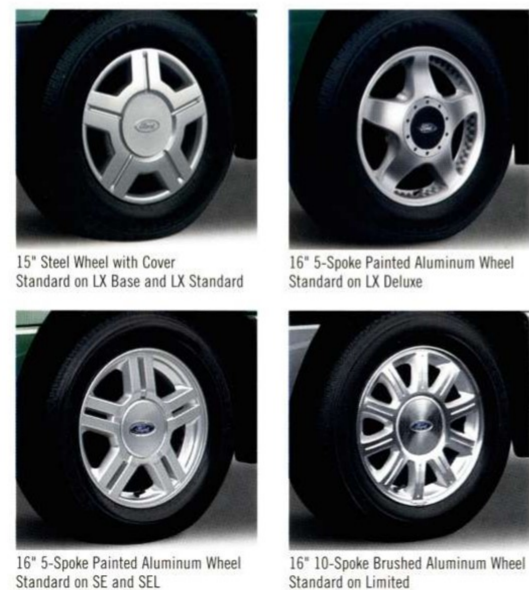
15" Steel Wheel with Cover Standard on LX Base and LX Standard