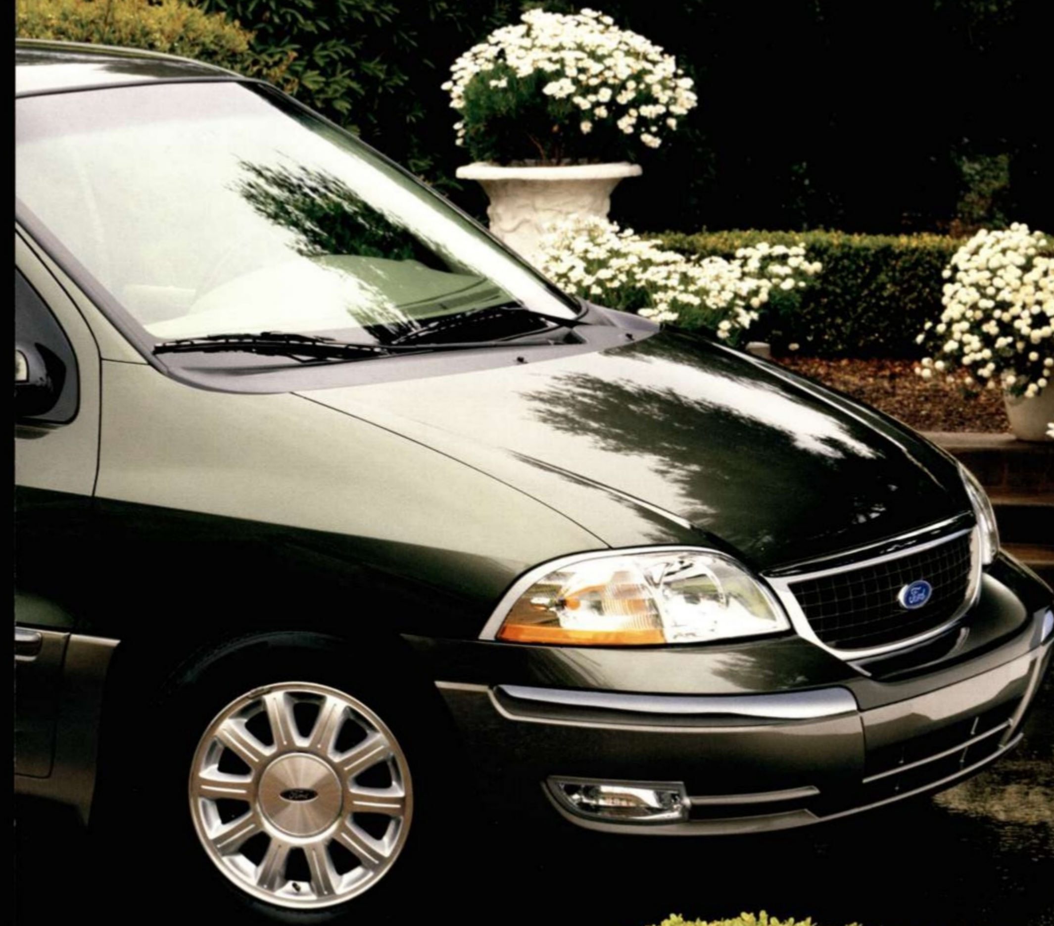
Limited shown in Estate Green Metallic and Mineral Grey Metallic.

In style. In luxury. In comfort. To say that Windstar Limited is just a minivan is a definite understatement. Why, just opening the doors to its supple, two-tone leather quad seating surfaces should be proof enough of that. But then add the fact that they're 6-way power adjustable driver and front passenger heated seats with driver-side memory setting and lumbar support, and are reclinable to boot, and it's pretty much clinched. Still, with Windstar, the pampering doesn't stop there. Further refined touches say as much. Such as a classically designed wood and leather-wrapped steering wheel. Distinctive instrument cluster accents. Plush carpeting underfoot. There's even the convenience and safety of heated power mirrors with integrated safety signals and the confidence that comes with power adjustable pedals. Add the exceptional sound of an AM/FM stereo with a 6-disc in-dash CD player and digital clock and you can't help but conclude that Windstar Limited is anything but limited.