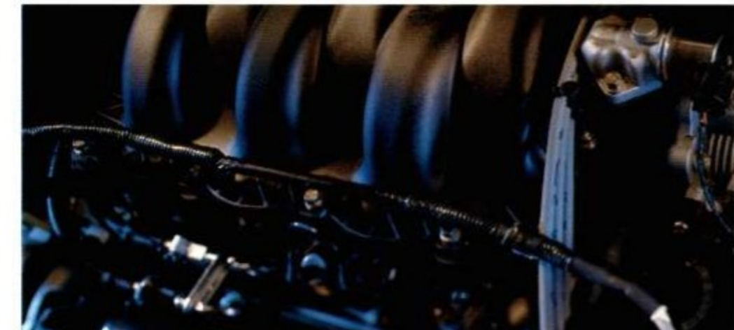
3.8L OHV V6 Horsepower: 200 hp @ 4900 rpm Torque: 240 lb.-ft. @ 3600 rpm Final drive ratio: 3.56:1