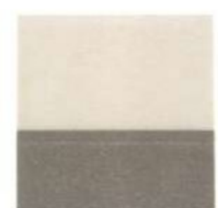
White Pearlescent ■ 2,3 Light Parchment Gold ■