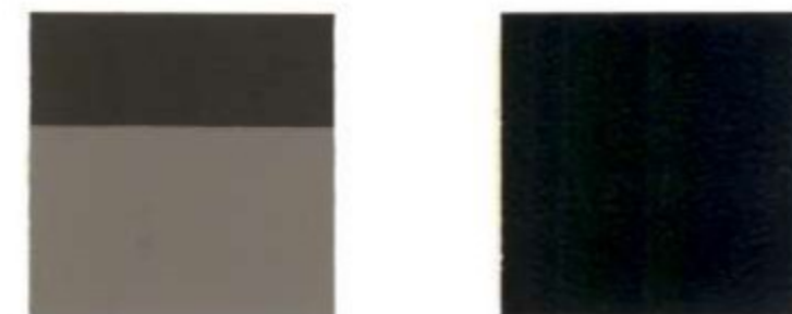
Dark Stone 4 Medium Light Stone Black