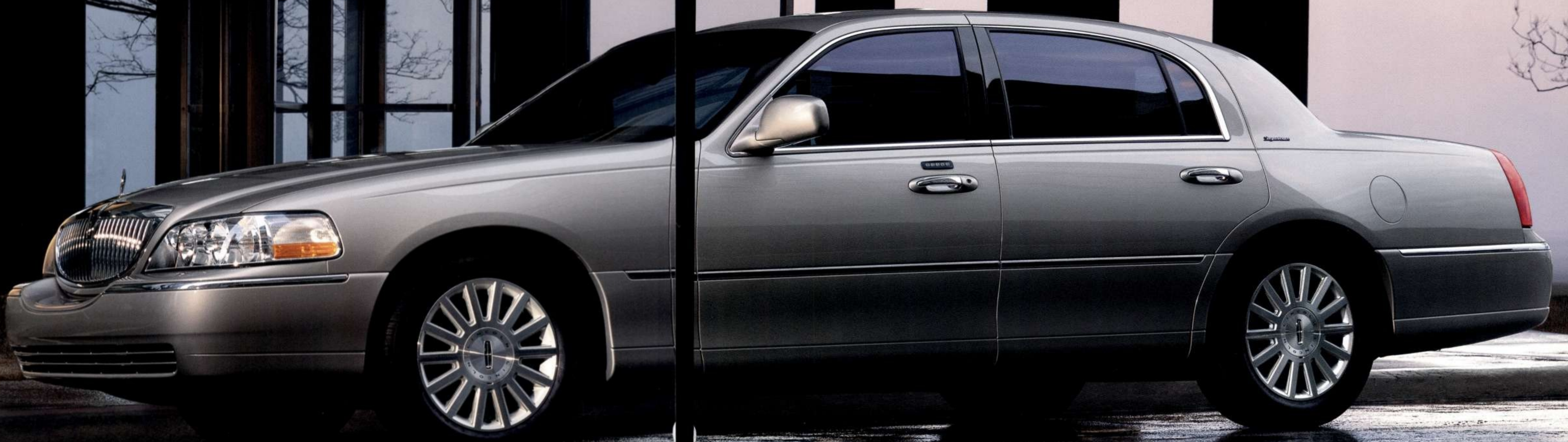
Lincoln Town Car Signature Series in Silver Birch Clearcoat Metallic. Shown with available equipment.