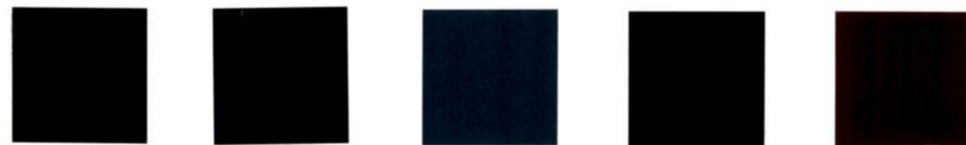
Black ▲ True Blue ■ Medium Pacific Blue ■ Aspen Green ■ Autumn Red ■