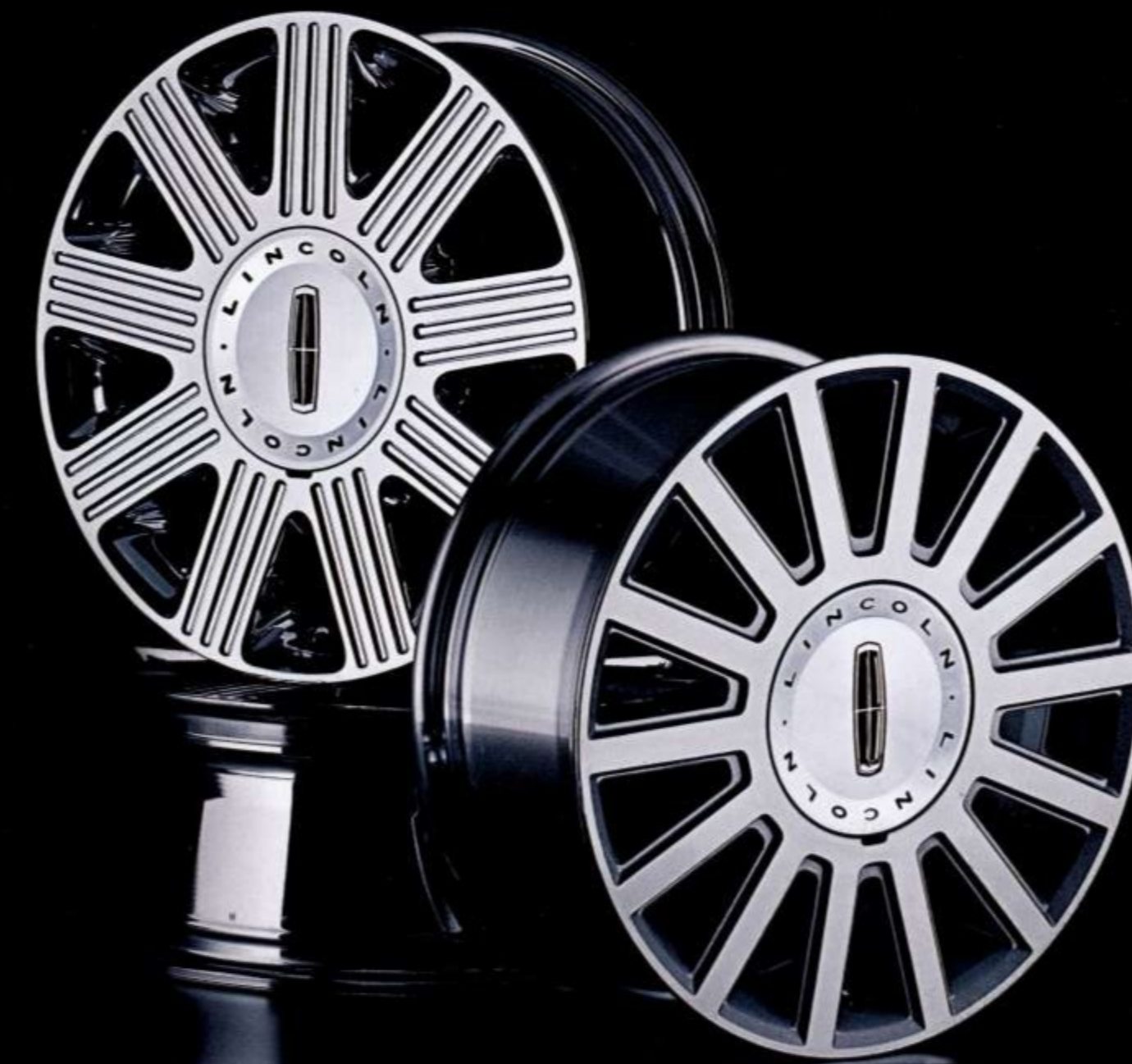
Wheels shown from left to right: 17-inch 9-spoke chrome finish, 17-inch 14-spoke machined aluminum finish.