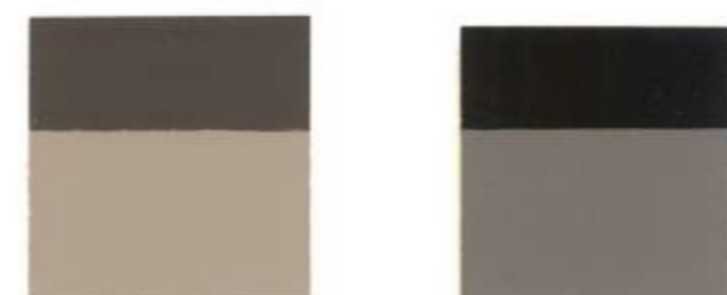
Medium Dark Parchment 4 Light Parchment Espresso 4 Medium Light Stone