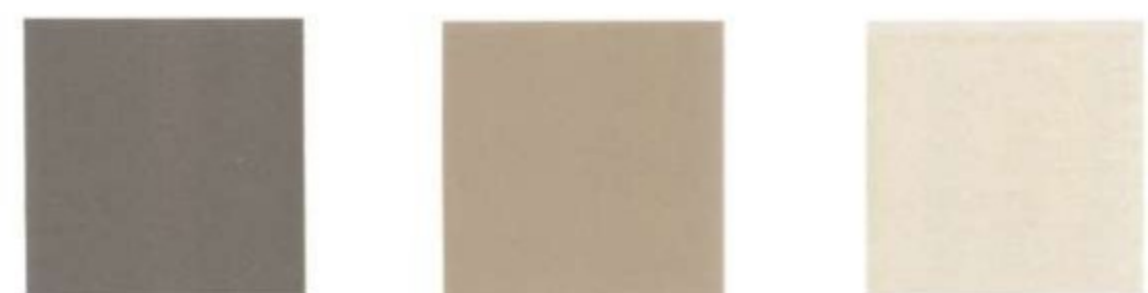
Light Parchment Gold ▲ Ivory Parchment ▲ 2 White Pearlescent ■ 2,3