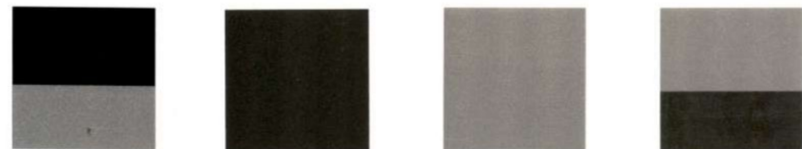
Black ▲ Silver Birch ■ 1 Charcoal Grey ■ Silver Birch ■ Silver Birch ■ Charcoal Grey ■ 1