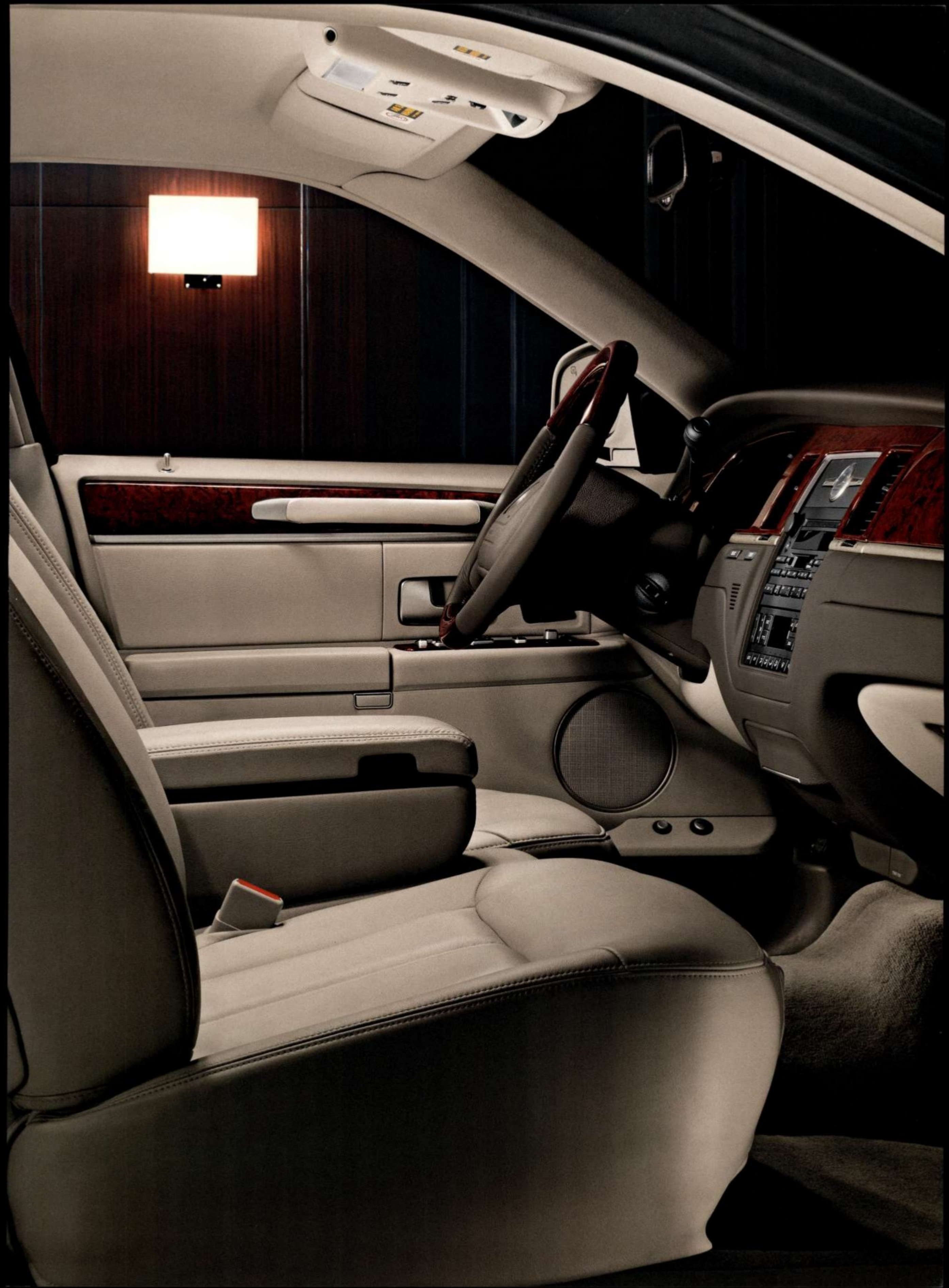
Lincoln Town Car Cartier with Light Parchment interior. Shown with available equipment.