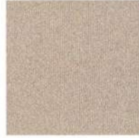
Arizona Beige Clearcoat Metallic