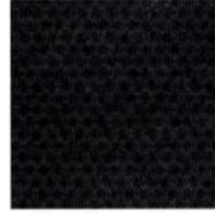
Dark Charcoal cloth