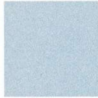
Light Ice Blue Clearcoat Metallic