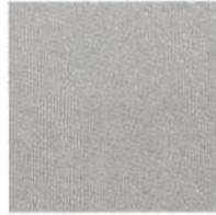
Light Flint leather trimmed