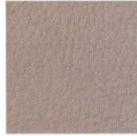
Medium Parchment leather trimmed