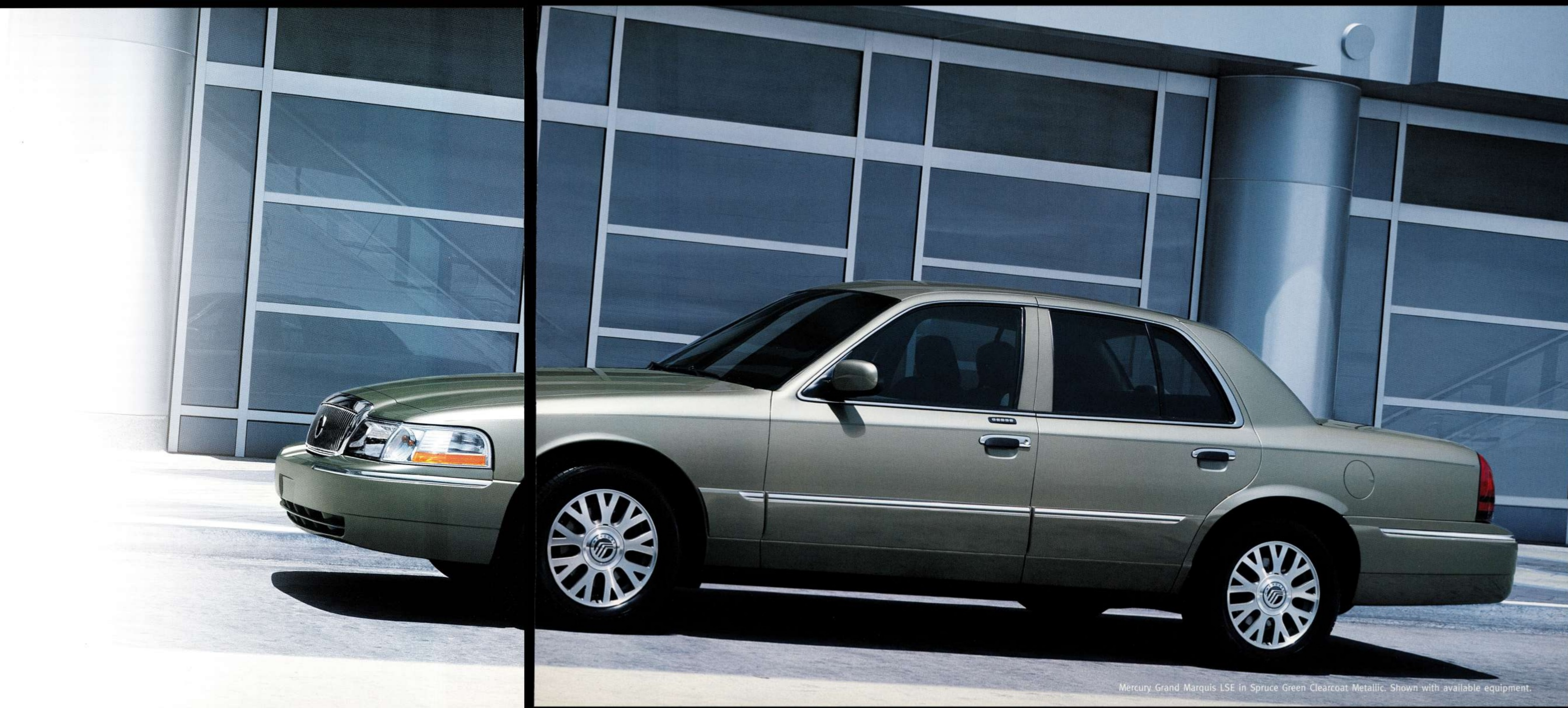
Mercury Grand Marquis LSE in Spruce Green Clearcoat Metallic. Shown with available equipment.

tunnel to produce an aerodynamically refined body that cuts wind noise and remains stable in cross winds. And beneath its beautiful surface lies a rear-wheel-drive chassis, engineered to carry you in safety. Its Electronic Brakeforce Distribution with dual-rate brake booster along with ABS assists you in panic braking situations. And its PrecisionTrac® rear suspension helps preserve handling stability.