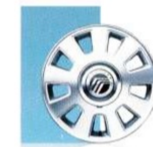
16-inch 9-spoke aluminum