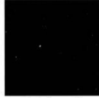
Black Clearcoat 5