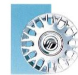
16-inch painted wheel covers

To ensure we're offering our customers the best service possible, we proudly offer the Mercury Personal Consultant . Just visit our Web site at www.mercuryvehicles.com/pc and one of our manufacturer's representatives will help with anything from price quotes to product features to arranging a test drive at your local dealer—at no cost or obligation. Following publication of this brochure, certain changes in standard equipment, options, prices and the like, or product delays may have occurred which would not be included in these pages. Your Mercury dealer is your best source for up-to-date information. Lincoln Mercury reserves the right to