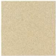
Gold Ash Clearcoat Metallic