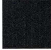
Dark Charcoal 5 leather trimmed