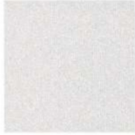
Silver Frost Clearcoat Metallic