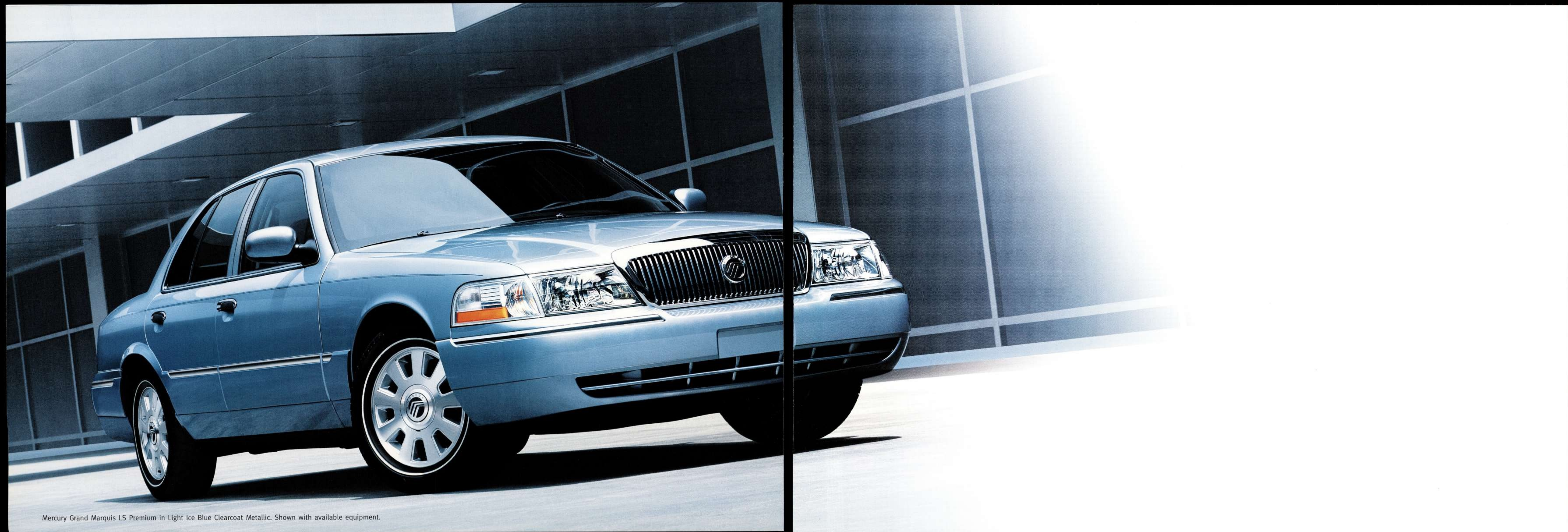
Mercury Grand Marquis LS Premium in Light Ice Blue Clearcoat Metallic. Shown with available equipment.