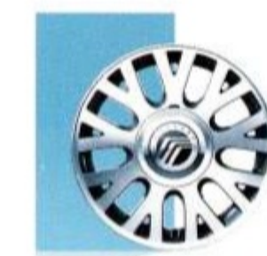
16-inch 9-spoke LSE aluminum

change product specifications at any time without incurring obligations. Options shown or described in this brochure are available at extra cost and may be offered only in combination with other options or subject to additional ordering requirements or limitations.