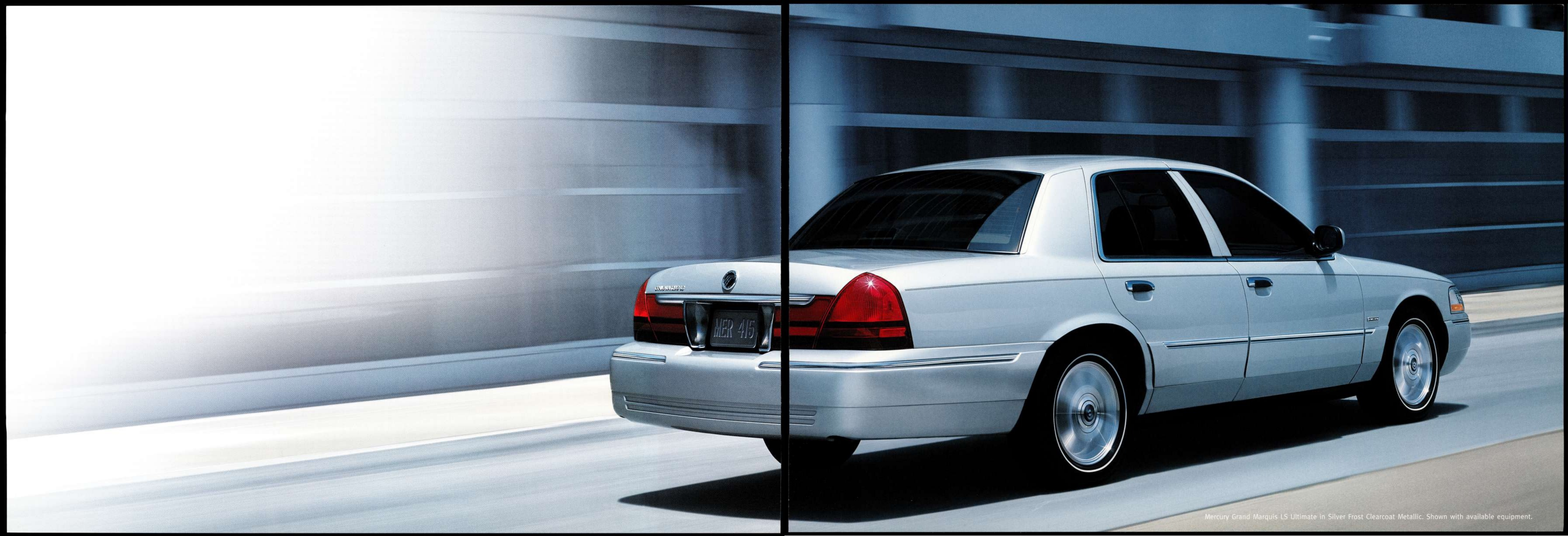
Mercury Grand Marquis LS Ultimate in Silver Frost Clearcoat Metallic. Shown with available equipment.