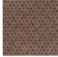
Medium Parchment cloth