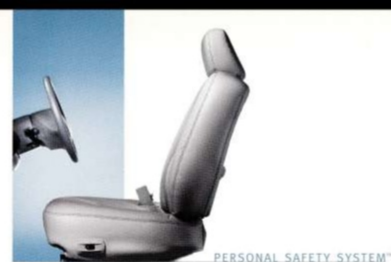
PERSONAL SAFETY SYSTEM™

The Personal Safety System, with its dual-stage driver and right front passenger airbags 1 , crash severity sensor, front outboard safety belt usage sensors, driver's seat position sensor, passenger seat sensor, front outboard safety belt pretensioners and front outboard energy-management safety belt retractors, is a comprehensive restraint strategy designed to help protect you in the event of frontal collisions.