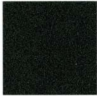
Aspen Green Clearcoat Metallic