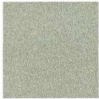
Spruce Green Clearcoat Metallic