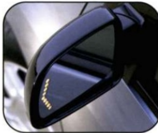
Available side mirrors with integrated turn signals help alert traffic around you.

● Standard ● Select Availability ○ Optional — Not Available