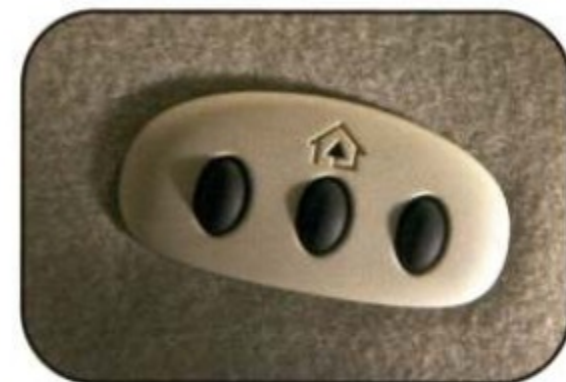
HomeLink® universal transmitter available on Taurus SEL Sedan and Wagon.

*Under normal driving conditions with regular fluid and filter changes.