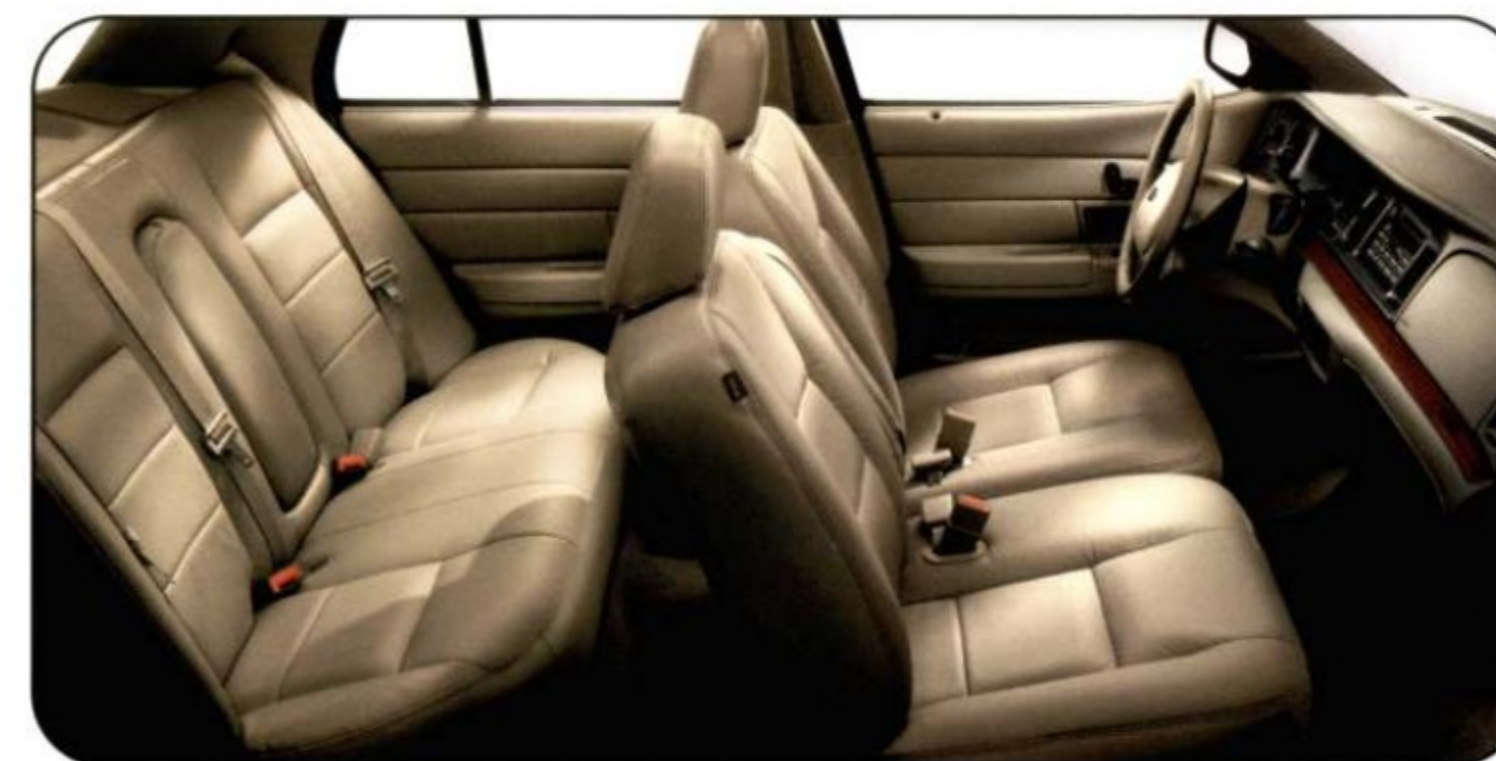
The LX Premier Group in available Medium Parchment leather trim welcomes you and 5 guests.

Available power adjustable pedals contribute to comfort. They help find the optimal driving position for almost any driver.