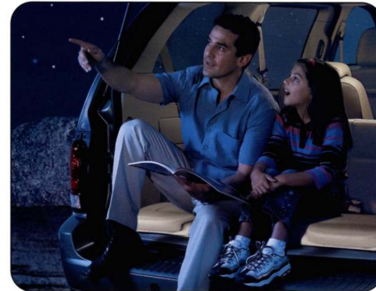
Freestar's versatile 3rd-row Tailgate Bench Seat™ folds to create a comfortable tailgate seat.