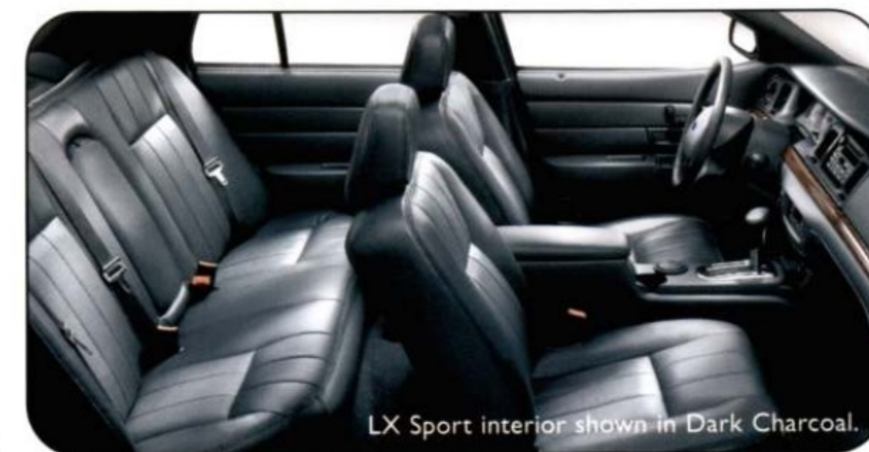
LX Sport interior shown in Dark Charcoal.