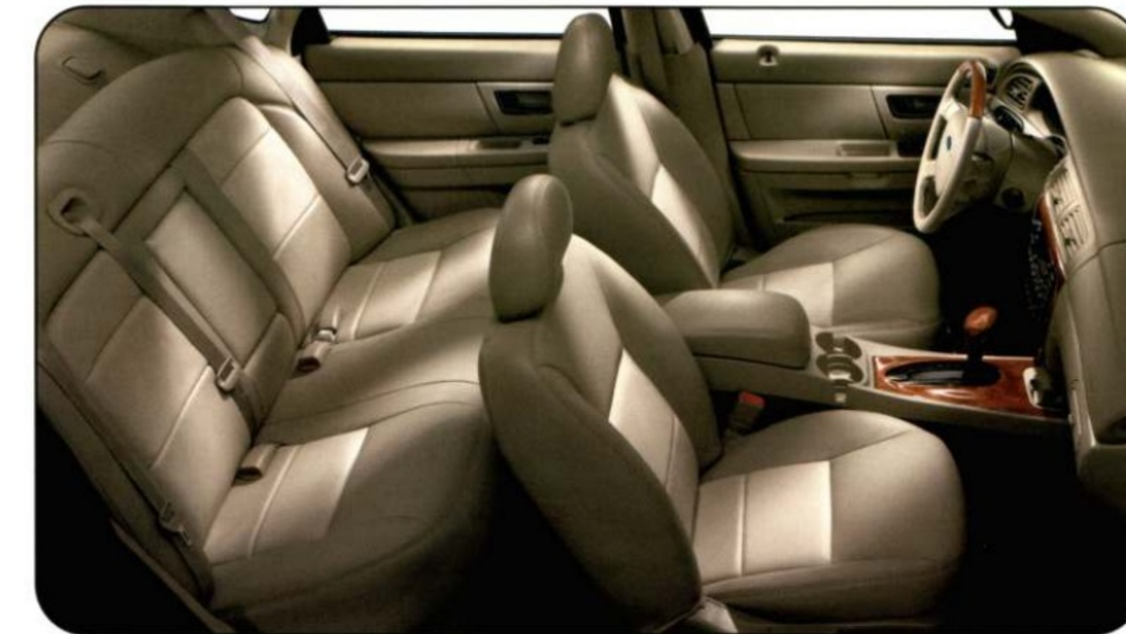
Sink into the luxury of two-tone premium leather-trimmed seats, available only in Taurus SEL Sedan.