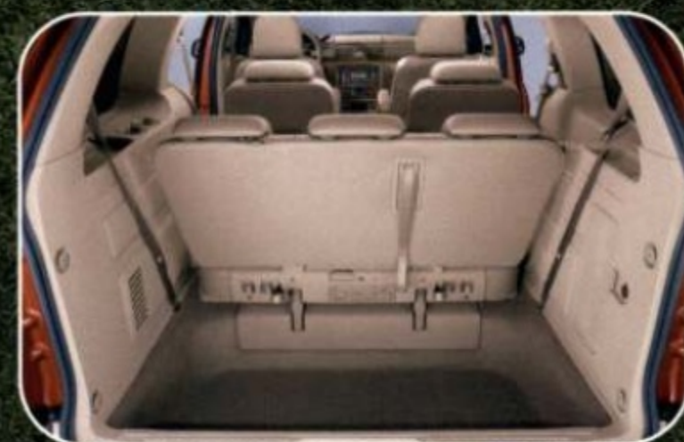
Standard configuration with deep cargo well and room for 7 people.