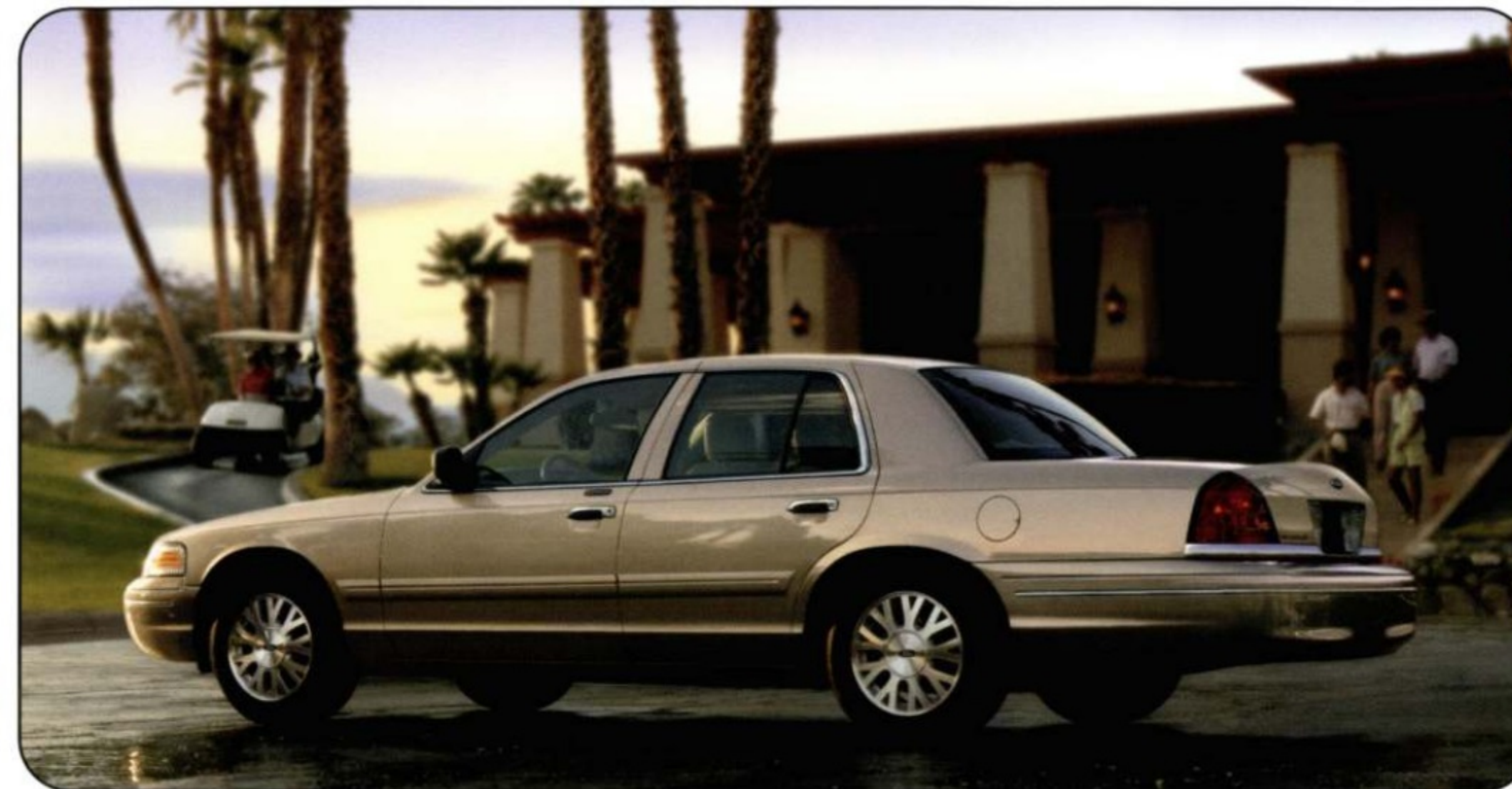
Crown Victoria LX shown in Arizona Beige Metallic.

The Electronic Automatic Temperature Control system lets you set the temperature and forget it.