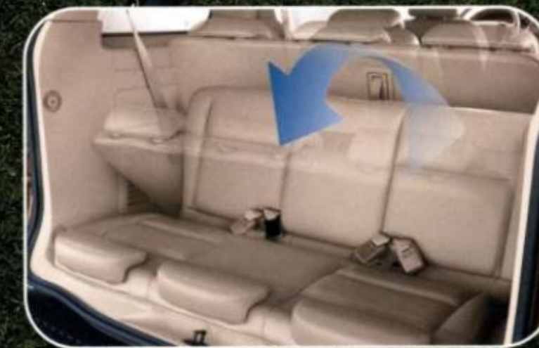
3rd-row Tailgate Bench Seat™ – ready for fun.