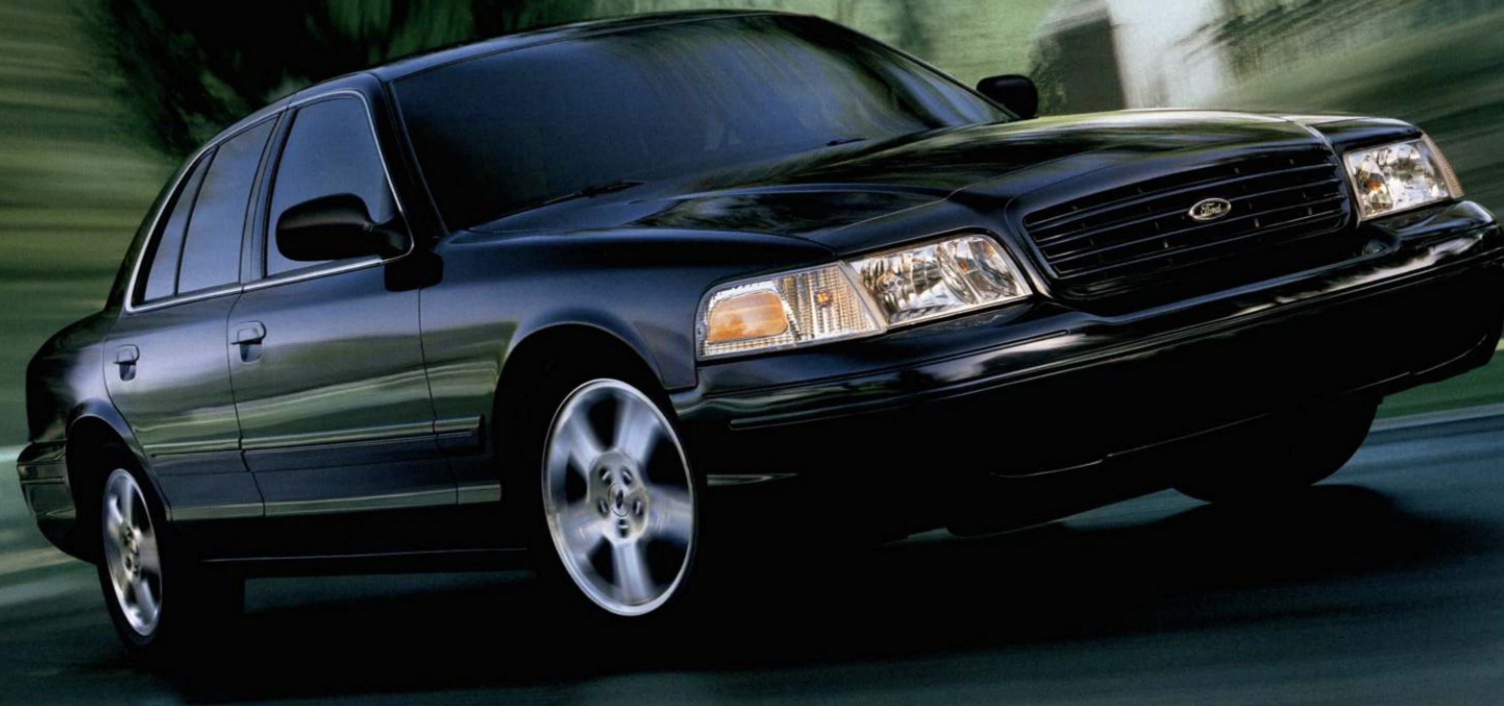
Crown Victoria LX Sport in Black with standard 17" 5-spoke aluminum wheels.