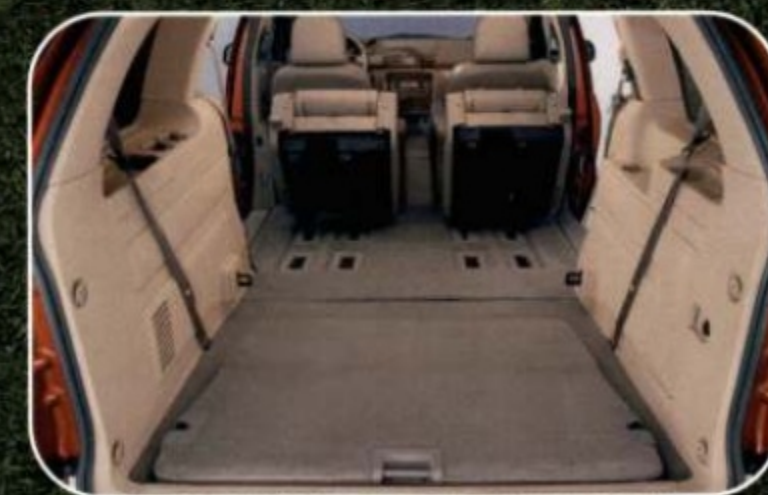
3rd-row seat folds flat into the floor to create a large cargo area.