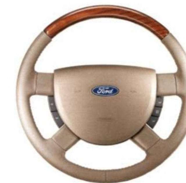
Enjoy the feel of the available wood- and leather-wrapped steering wheel.