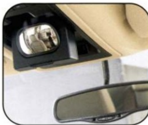
Conversation mirror for SEL and Limited's standard overhead console.