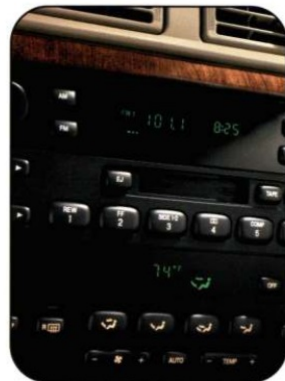
Standard on Taurus SEL Sedan and Wagon, an Electronic Automatic Temperature Control System operates the heater and air conditioner to keep the temp to your liking.