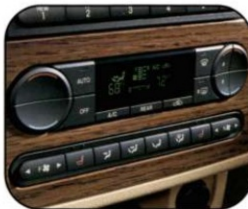
Available tri-zone climate controls allow occupants to adjust the air temperature to their own comfort levels.