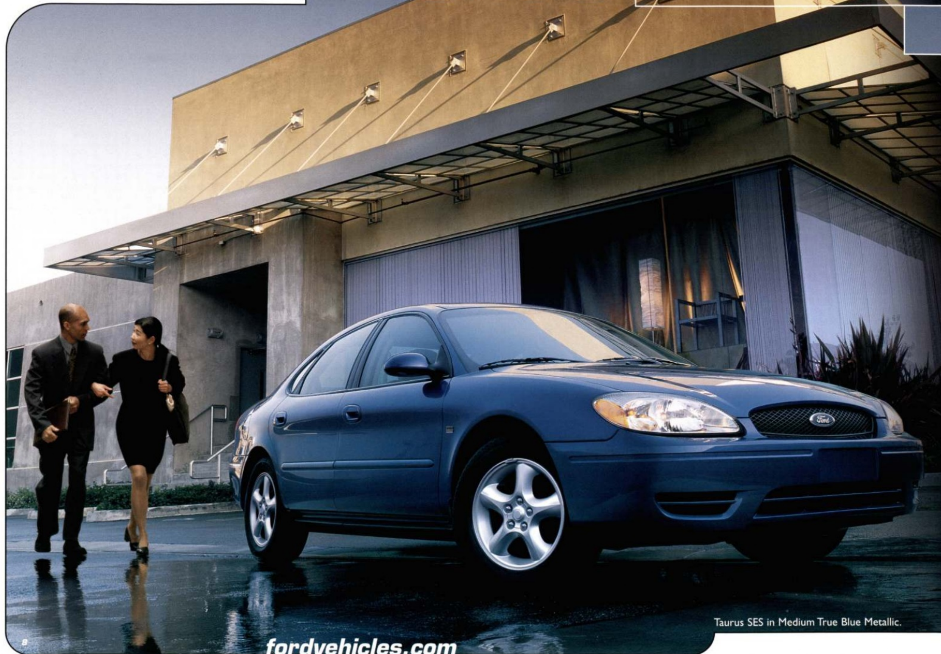
Taurus SES in Medium True Blue Metallic.