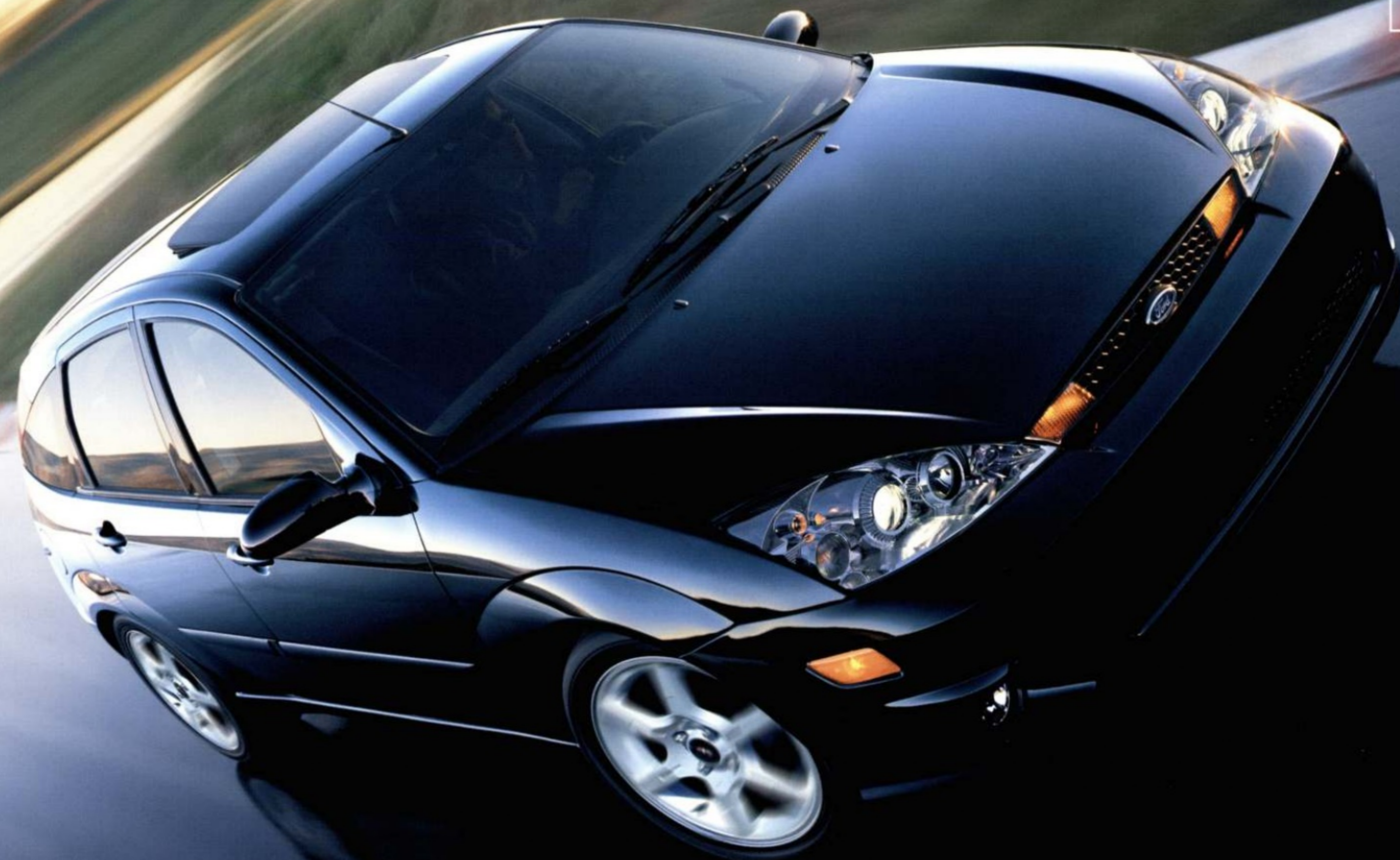
ZX5 SVT in Pitch Black, shown with optional High-Intensity Discharge (HID) headlamps and moonroof.