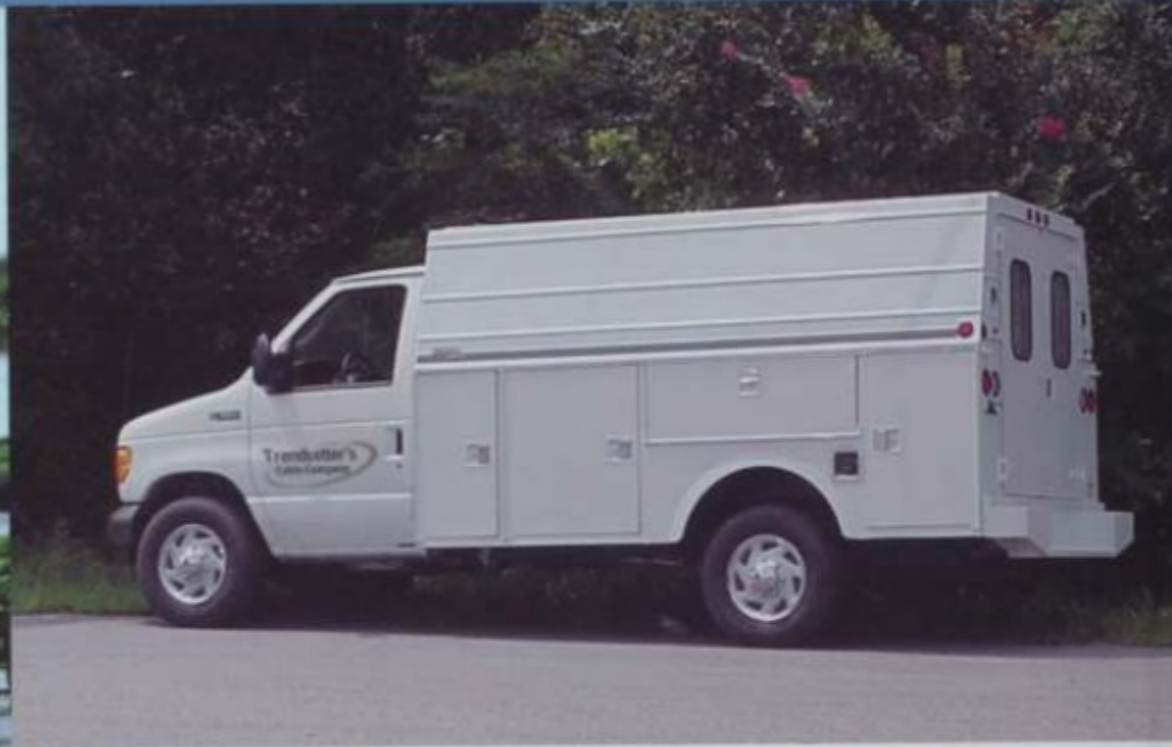
FORD E-SERIES SUPER DUTY CUTAWAYS, CHASSIS CABS & STRIPPED CHASSIS