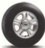
16" Aluminum Wheel