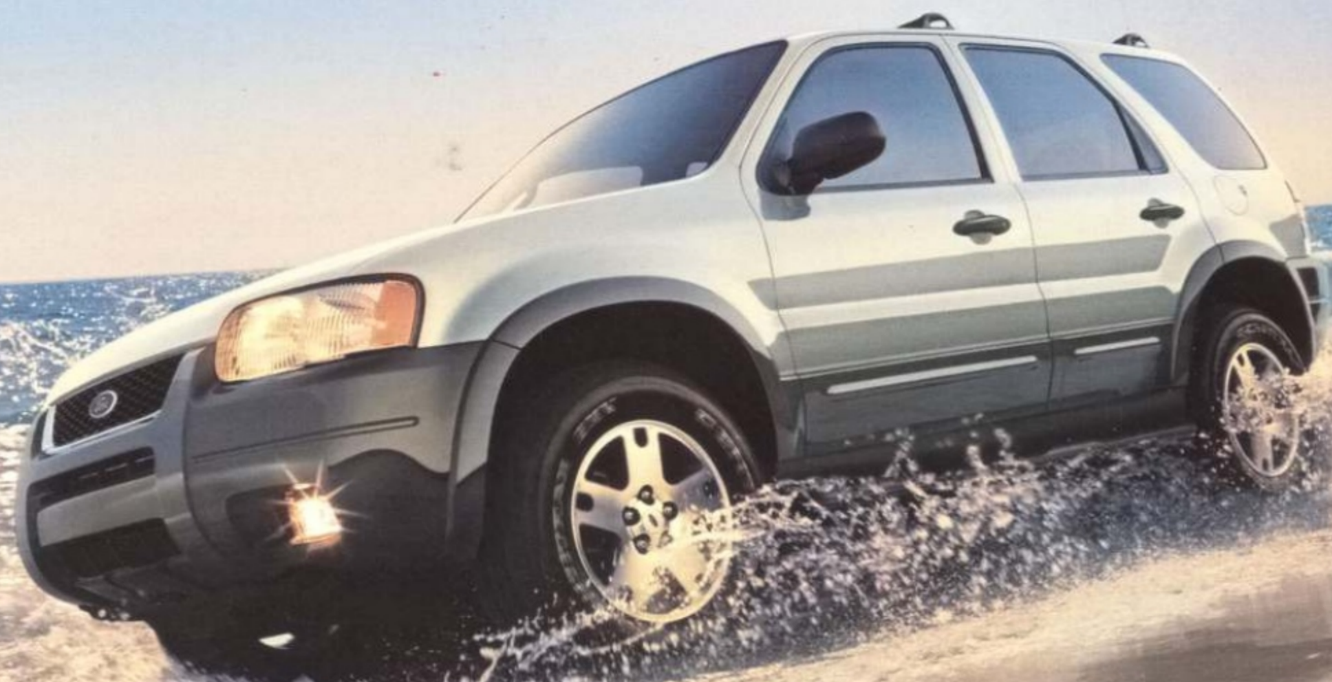
XLT Appearance Package

You have been pre-approved by Ford Credit and your local Ford Dealer for $30,001.* Offer expires 1/16/04.