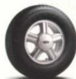
15" Aluminum Wheel