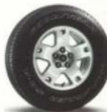
16" Painted Aluminum Wheel