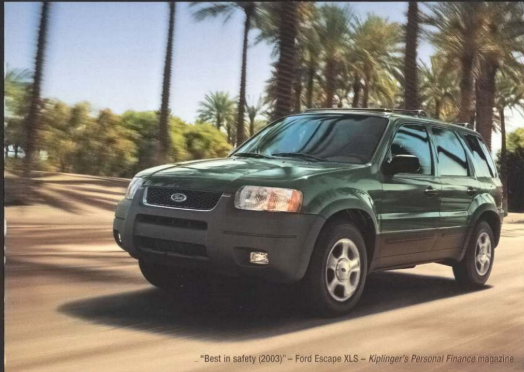
"Best in safety (2003)" - Ford Escape XLS - Kiplinger's Personal Finance magazine

space. 4 You'll find a standard 6-disc in-dash CD player with four speakers in Escape XLT, as well as Limited. 5 A 6-way power driver's seat, Privacy Glass and an anti-lock braking system (ABS) are standard features in Escape XLT. For extra amenities, opt for the Leather Comfort Group (bucket seats and 60/40 split bench seat shown here in Medium/Dark Flint).