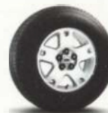
16" Bright Machined Aluminum Wheel