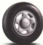
15" Styled Steel Wheel

*Always wear your safety belt and secure children in the rear seat.