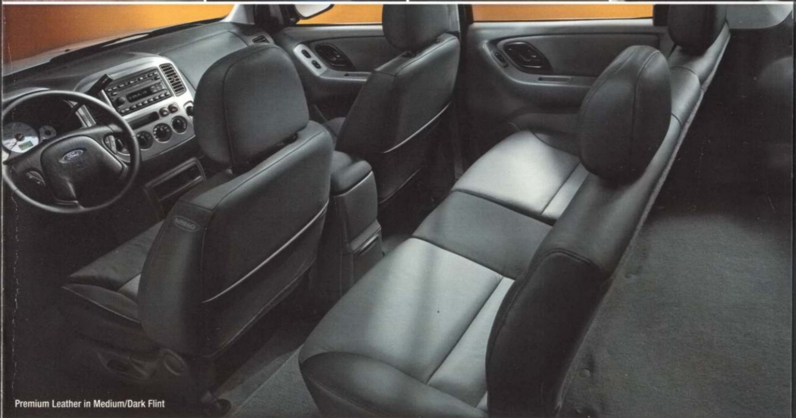
Premium Leather in Medium/Dark Flint

1 Escape's fully independent suspension allows each wheel to respond individually to dips and bumps for a smooth ride and responsive handling. 2 You can haul up to 3,500 lbs. (FWD and 4x4) when the available 3.0L DOHC Duratec V6 engine is paired with a Class II Trailer Towing Package. 3 Fold down the 2nd row and Escape offers a generous 64.8 cubic feet of cargo