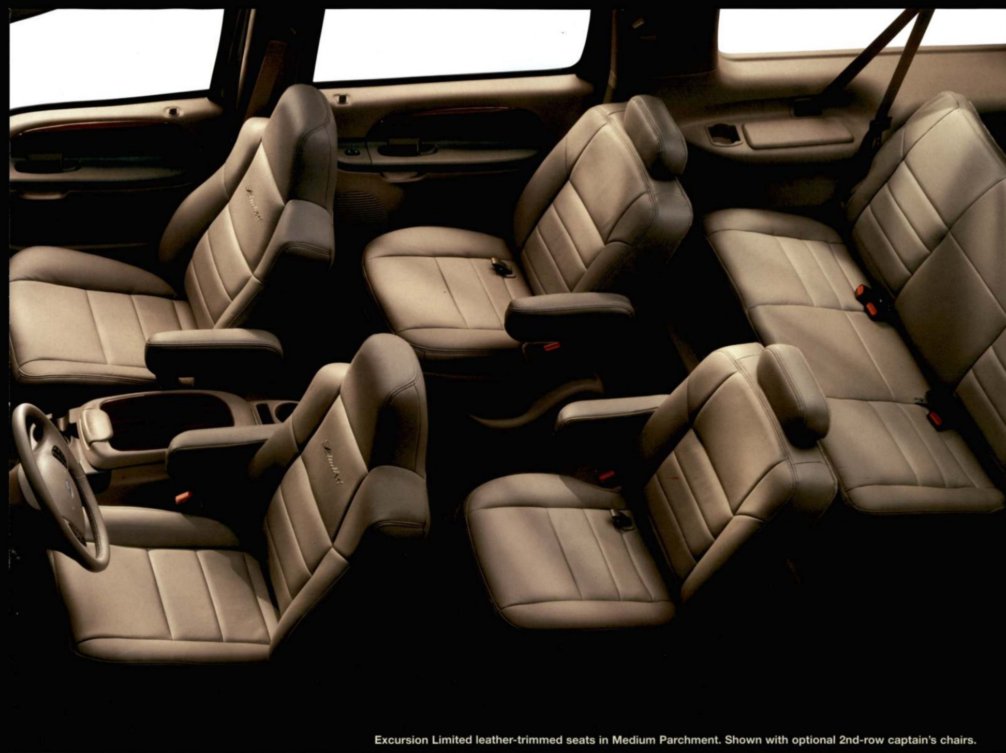
Excursion Limited leather-trimmed seats in Medium Parchment. Shown with optional 2nd-row captain's chairs.