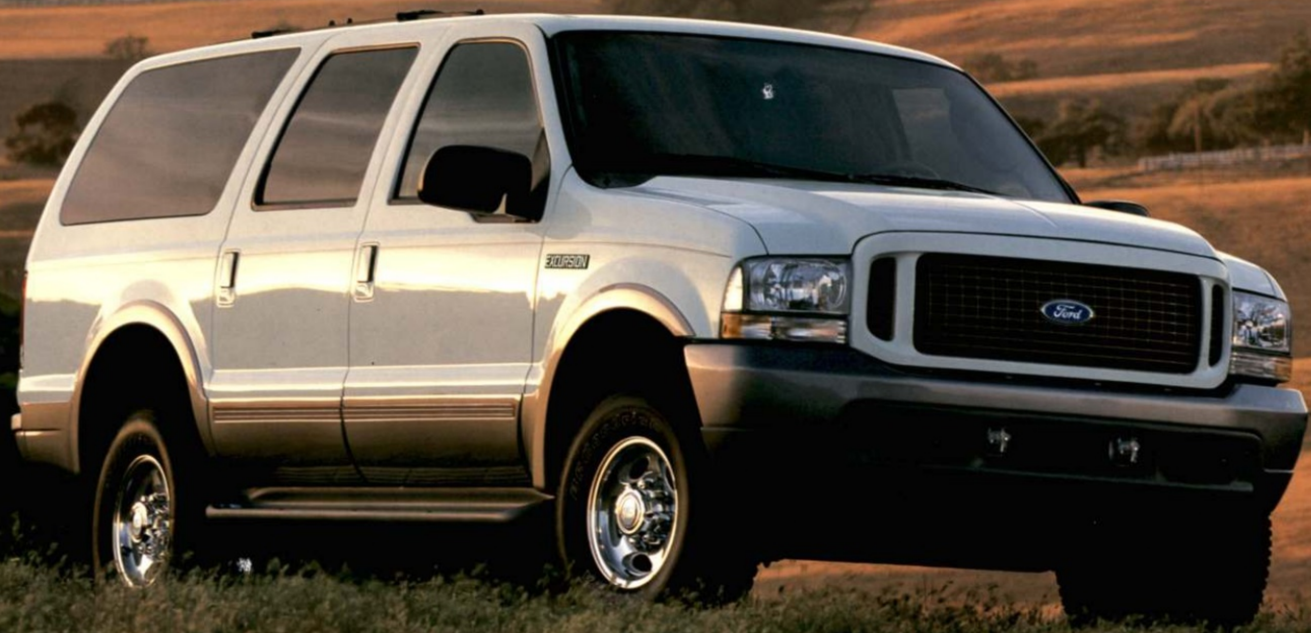
Excursion Eddie Bauer 4x4 in Oxford White.