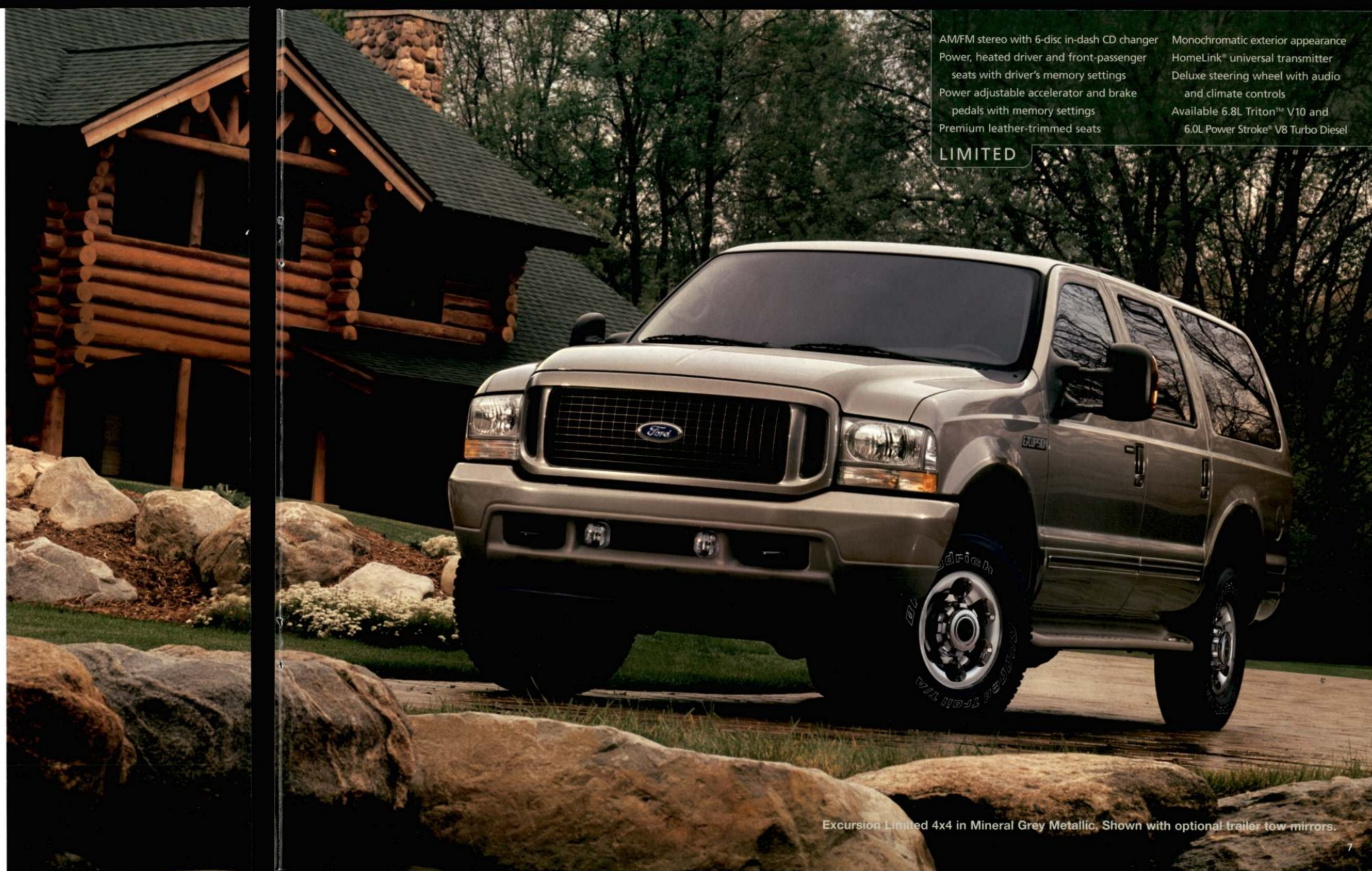
Excursion Limited 4x4 in Mineral Grey Metallic. Shown with optional trailer tow mirrors.