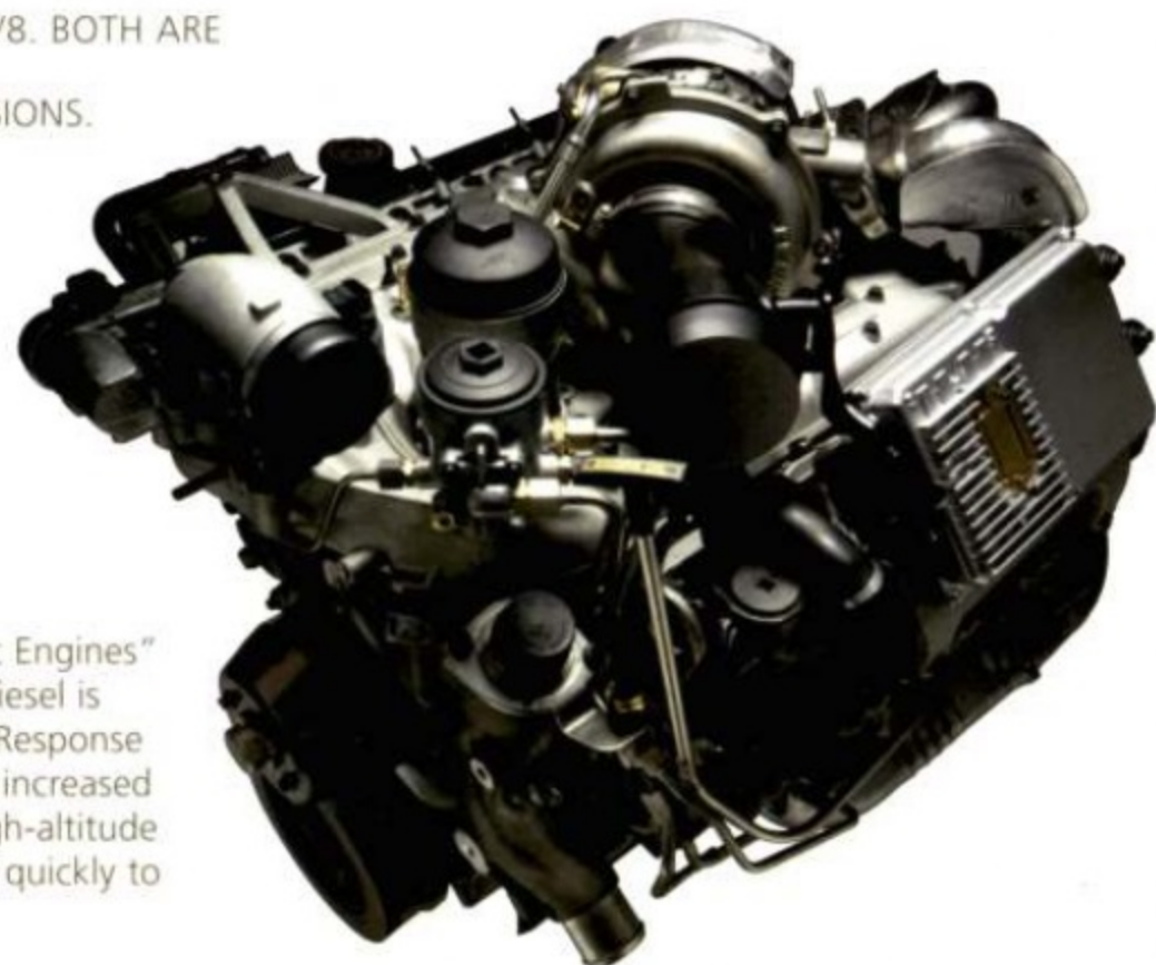
6.0L Power Stroke V8 Turbo Diesel

Named one of Ward's AutoWorld's "10 Best Engines" of 2003, the 6.0L Power Stroke V8 Turbo Diesel is truly state of the art. Its Electronic Variable Response Turbocharger (EVRT™) provides significantly increased airflow during steep grade climbing and high-altitude performance and towing, while responding quickly to low-speed launch demands.