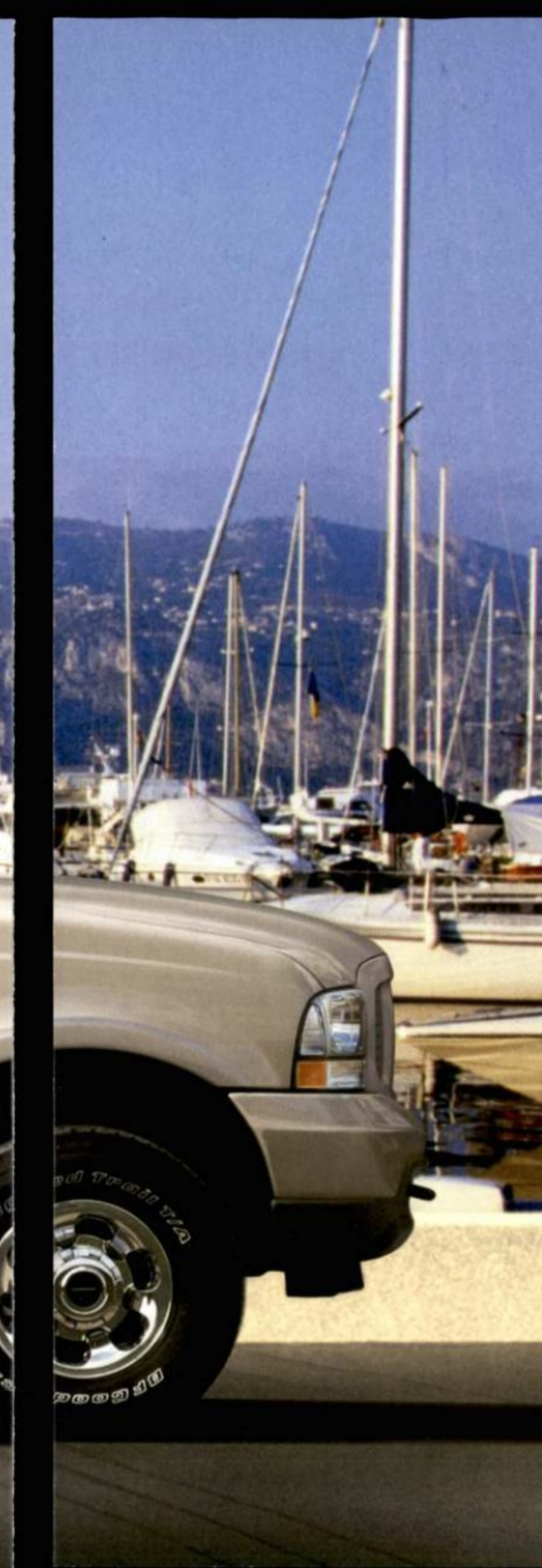
Shown above and on cover: Excursion Limited 4x4 in Pueblo Gold Metallic. Shown with optional trailer tow mirrors.