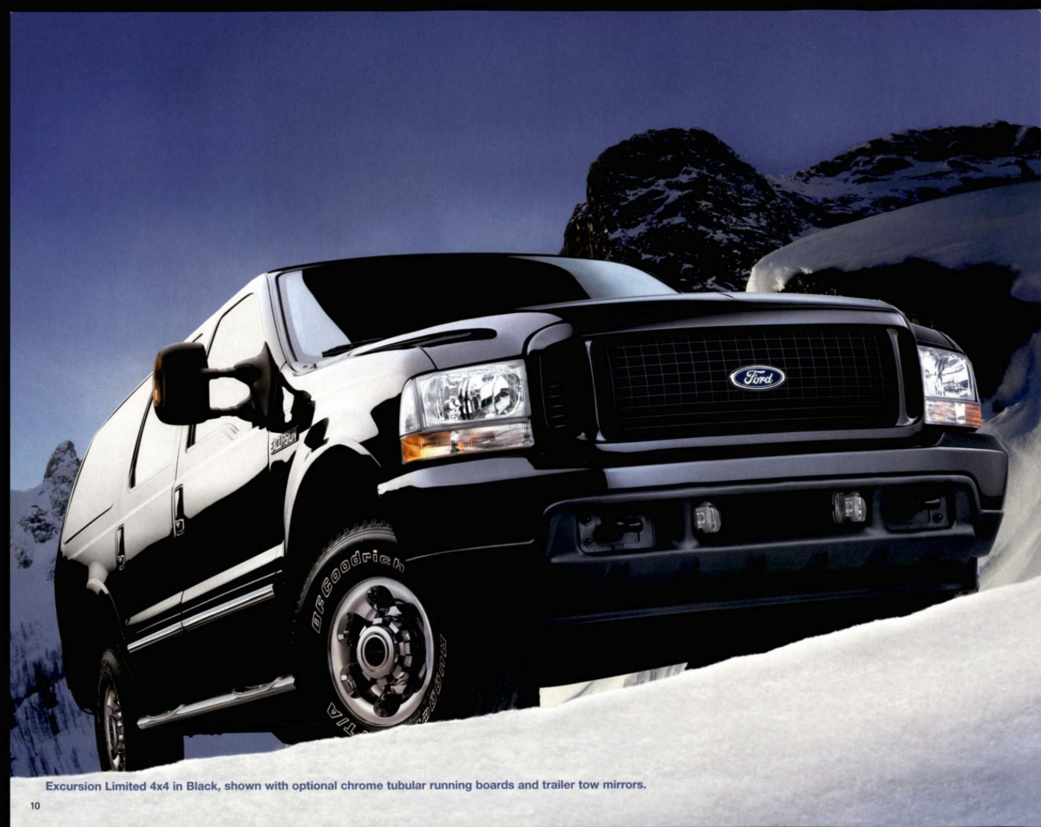
Excursion Limited 4x4 in Black, shown with optional chrome tubular running boards and trailer tow mirrors.