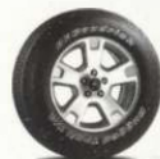
17" Machined Aluminum Wheel