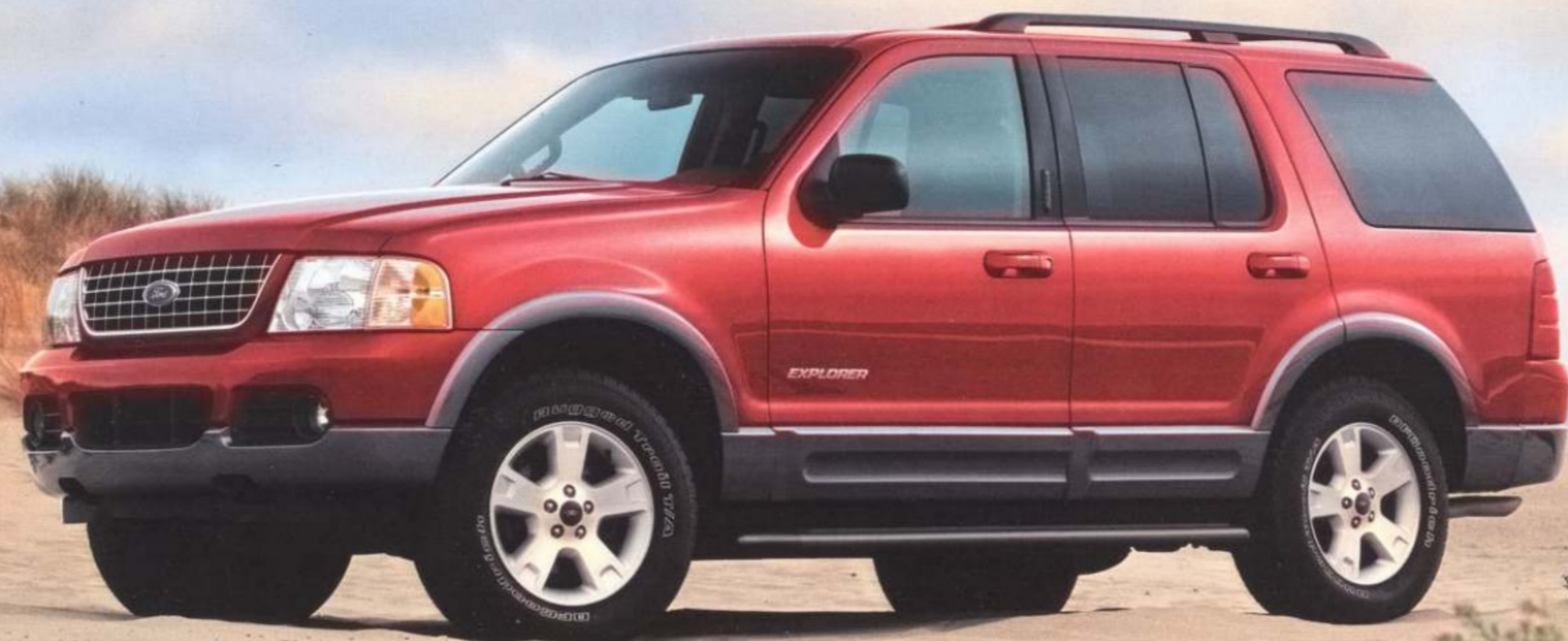
Explorer XLT Sport in Red Fire Metallic with optional roof rail crossbars

*Pre-approved credit is subject to the following conditions: All of your Ford Credit accounts, if any, must be in good standing, and your income must be sufficient to cover normal living expenses and your vehicle payment at the time of transaction. For new vehicles, the pre-approved amount applies to the manufacturer's suggested retail price (MSRP). If you have any questions regarding your pre-approval credit offer, just call Program Headquarters at 1-800-235-5346. Please note that information contained in your credit record was used to generate your name for this offer. The offer of credit was extended because you met the credit criteria established by Ford Motor Credit Company. The credit offer may be withdrawn if it is found that you no longer meet the established credit criteria. You have the right to notify any credit bureau that you do not wish to have information from your credit report used in future offerings involving pre-approved credit. Experian Target Marketing Services, P.O. Box 919, Allen, TX 75013, 1-888-567-8688; TransUnion - Name Removal Opt-Out Request, P.O. Box 7245, Fullerton, CA 92367, 1-888-567-8688; Equifax Option, P.O. Box 740123, Atlanta, GA 30374-0123, 1-888-567-8688.