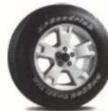
17" Satin-Nickel Aluminum Wheel