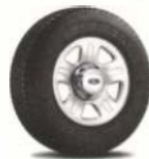
16" Full-Face Steel Wheel

Audiophile is a trademark of Audiophile, Inc.