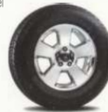
17" Chromed-Clad Aluminum Wheel