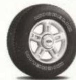
16" Painted Cast Aluminum Wheel