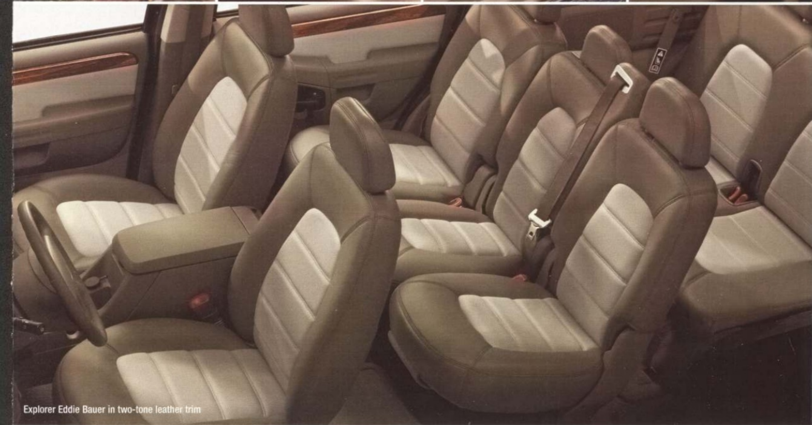
Explorer Eddie Bauer in two-tone leather trim

1 Explorer's Independent Rear Suspension allows each wheel to move independently of the other, resulting in a smooth ride. 2 The available Rear Seat DVD Entertainment System includes a fold-down 7" LCD screen, two sets of wireless headphones and a remote control. 3 The easiest and fastest folding available third-row seat disappears into the