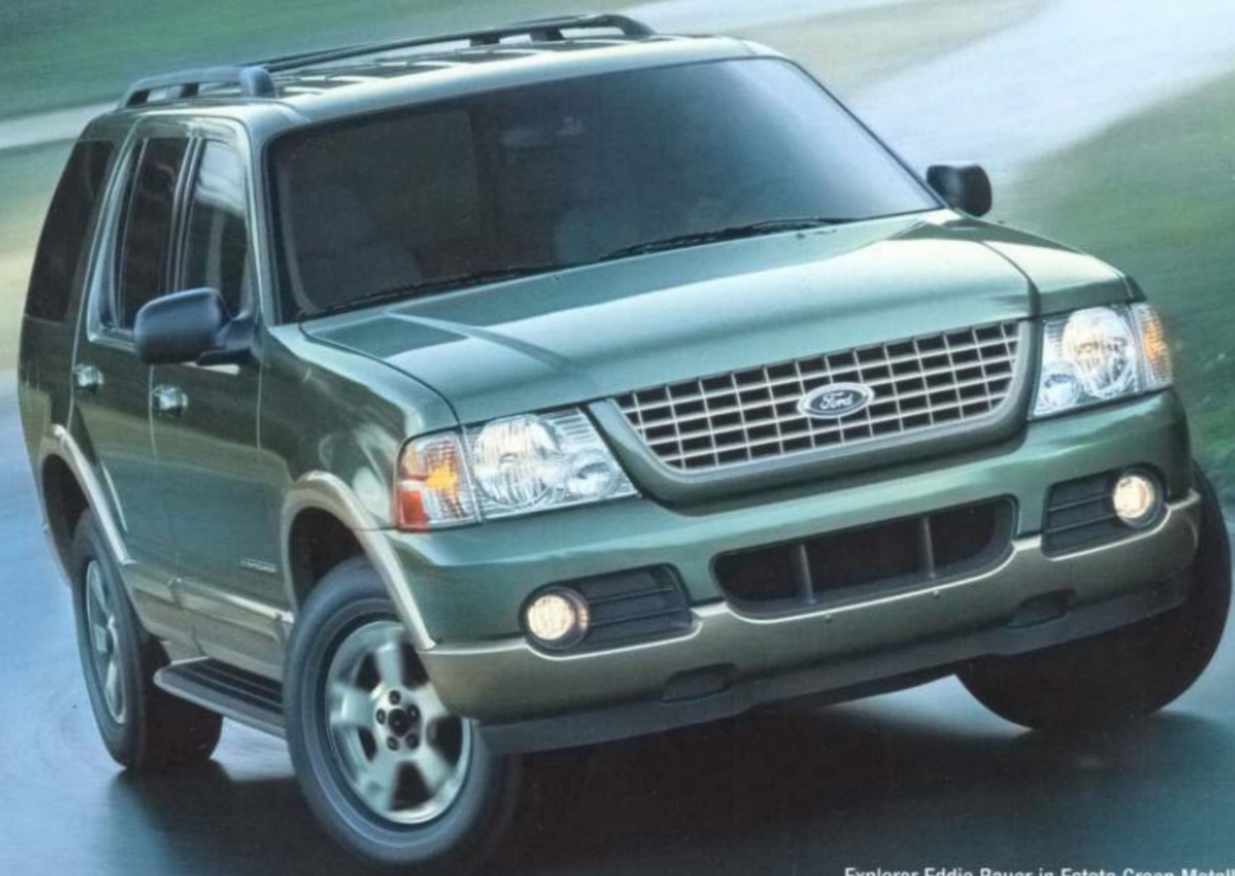
Explorer Eddie Bauer in Estate Green Metallic with optional roof rail crossbars

You have been pre-approved by Ford Credit and your local Ford Dealer for $35,000.* Offer expires 1/15/04.