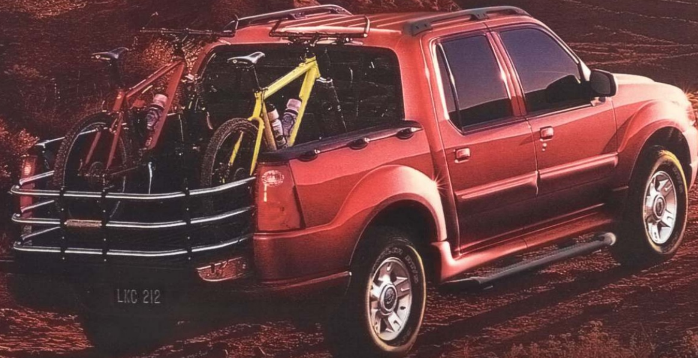
Explorer Sport Trac XLT Premium in Red Fire Metallic with optional Cargo Cage

*Pre-approved credit is subject to the following conditions: All of your Ford Credit accounts, if any, must be in good standing, and your income must be sufficient to cover normal living expenses and your vehicle payment at the time of transaction. For new vehicles, the pre-approved amount applies to the manufacturer's suggested retail price (MSRP). If you have any questions regarding your pre-approval credit offer, just call Program Headquarters at 1-800-235-5346. Please note that information contained in your credit record was used to generate your name for this offer. The offer of credit was extended because you met the credit criteria established by Ford Motor Credit Company. The credit offer may be withdrawn if it is found that you no longer meet the established credit criteria. You have the right to notify any credit bureau that you do not wish to have information from your credit report used in future offerings involving pre-approved credit. Experian Target Marketing Services, P.O. Box 919, Allen, TX 75013, 1-888-567-8688; TransUnion - Name Removal Opt-Out Request, P.O. Box 7245, Fullerton, CA 92367, 1-888-567-8688; Equifax Option, P.O. Box 740123, Atlanta, GA 30374-0123, 1-888-567-8688.