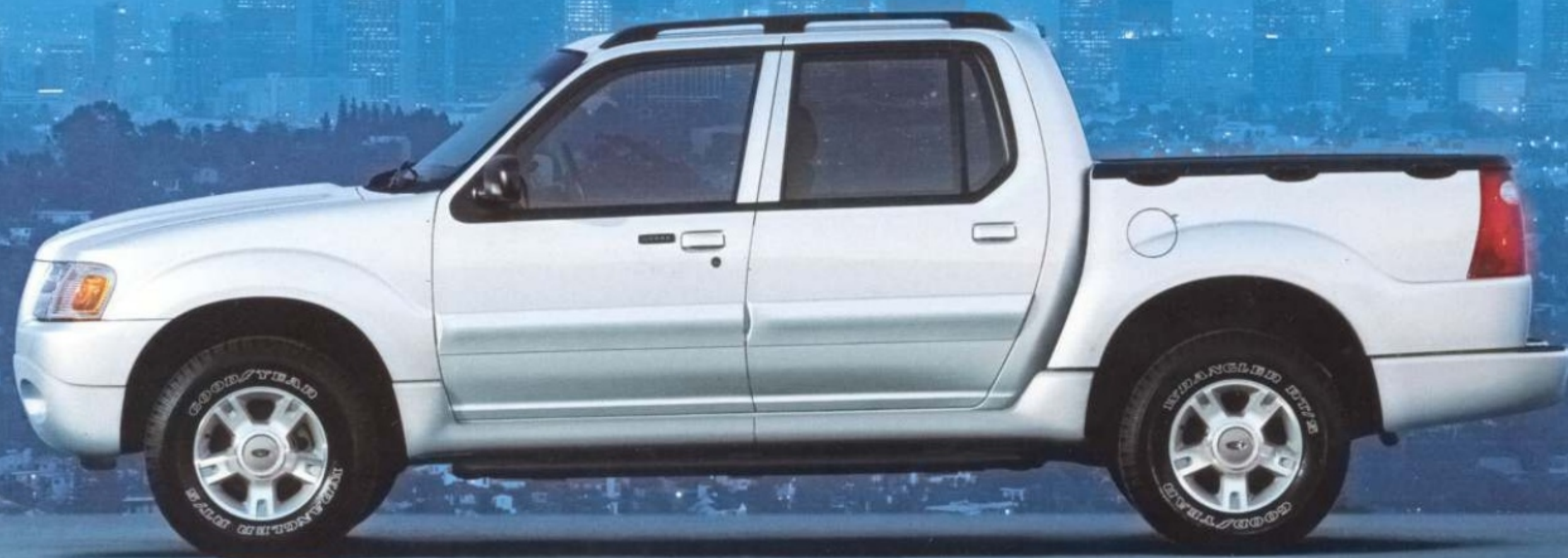
Explorer Sport Trac XLT Premium in Silver Birch Metallic

You have been pre-approved by Ford Credit and your local Ford Dealer for $30,000.* Offer expires 1/15/04.