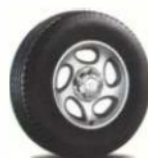
16" 5-Spoke Cast Aluminum Wheel

PIONEER ® is a registered trademark of Pioneer Kabushiki Kaisha.