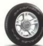
16" 5-Spoke Bright Cast Aluminum Wheel