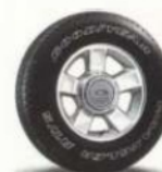
16" 5-Spoke Chromed Wheel