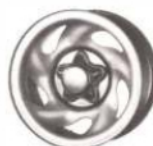
16" Styled Steel Wheel