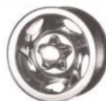
16" Polished Aluminum Wheel