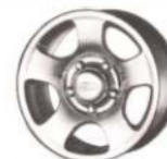
16" Cast Aluminum Wheel