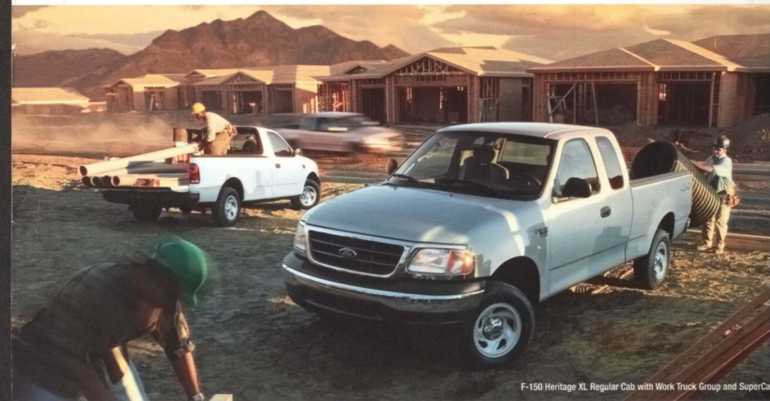
F-150 Heritage XL Regular Cab with Work Truck Group and SuperCab

You have been pre-approved by Ford Credit and your local Ford Dealer for $30,000.* Offer expires 1/15/04.