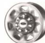
16" 7-Lug Grey Styled Steel Wheel