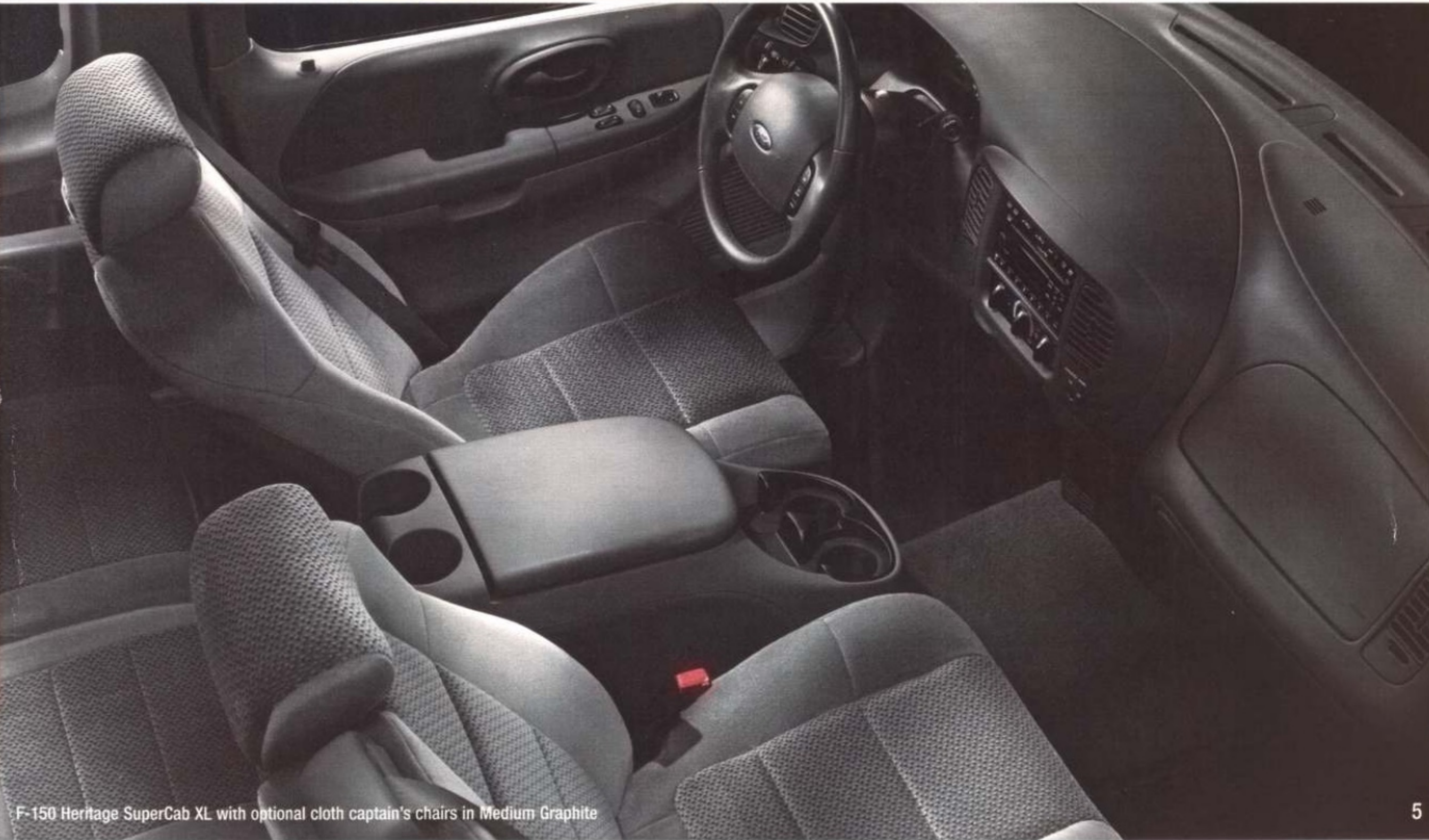
F-150 Heritage SuperCab XL with optional cloth captain's chairs in Medium Graphite