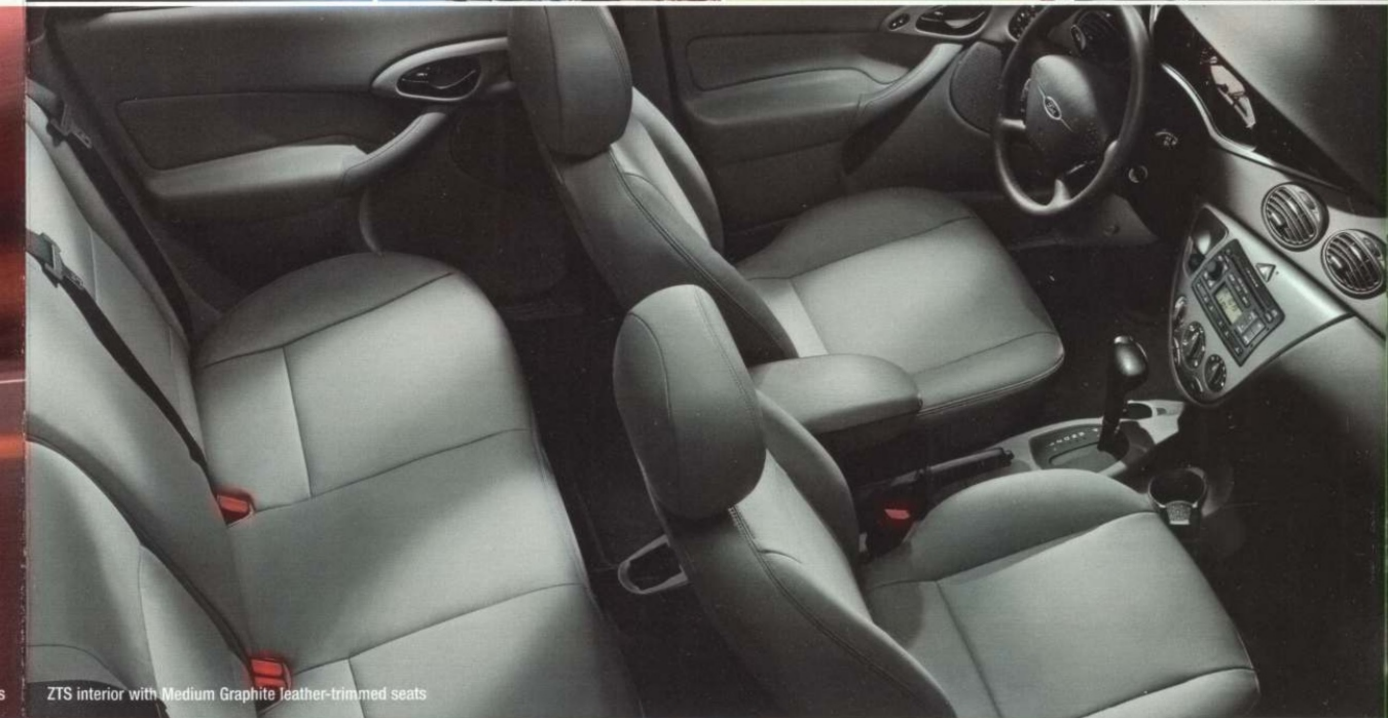
ZTS interior with Medium Graphite Leather-trimmed seats

1 Focus' suspension is comprised of an independent rear control blade, independent front MacPherson struts, a front stabilizer bar and power rack-and-pinion steering. All together giving Focus precise, responsive handling. 2 The 2.3L DOHC PZEV engine not only kicks out 144 horses and 149 lbs.-ft. of torque, it meets PZEV standards. 3 Standard on ZX5