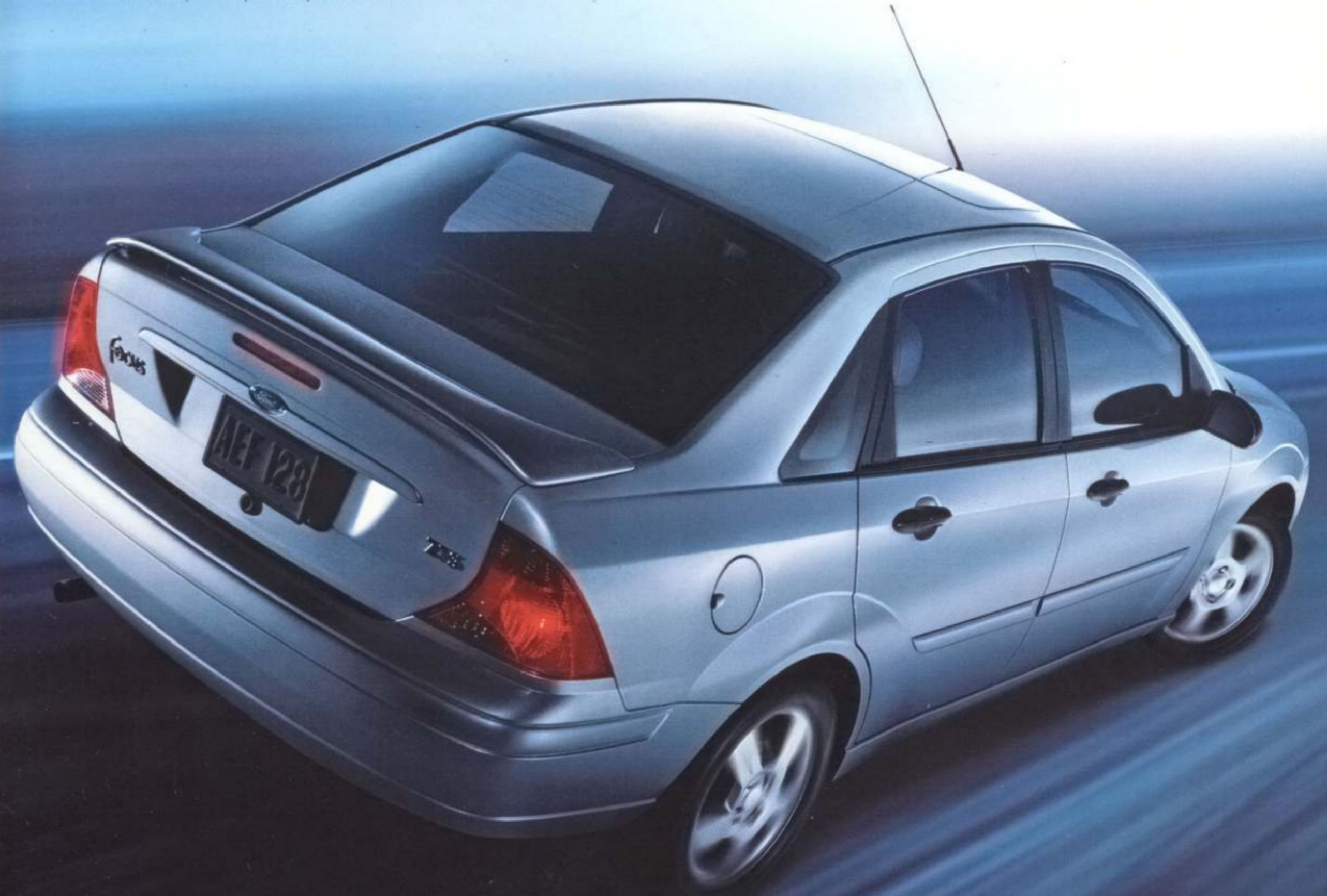
Focus ZTS with optional Sport Group and moonroof.